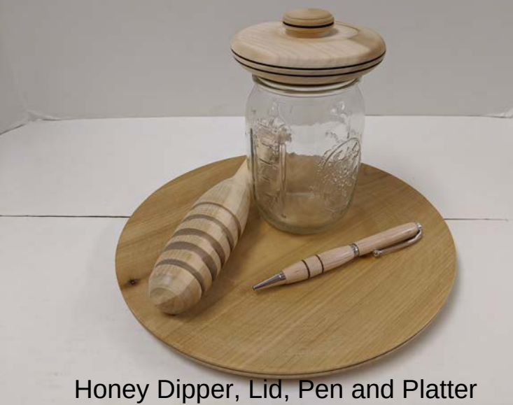
- Gavin Eutsler