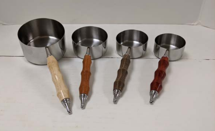
4 Measuring Cups - Ken Eutsler