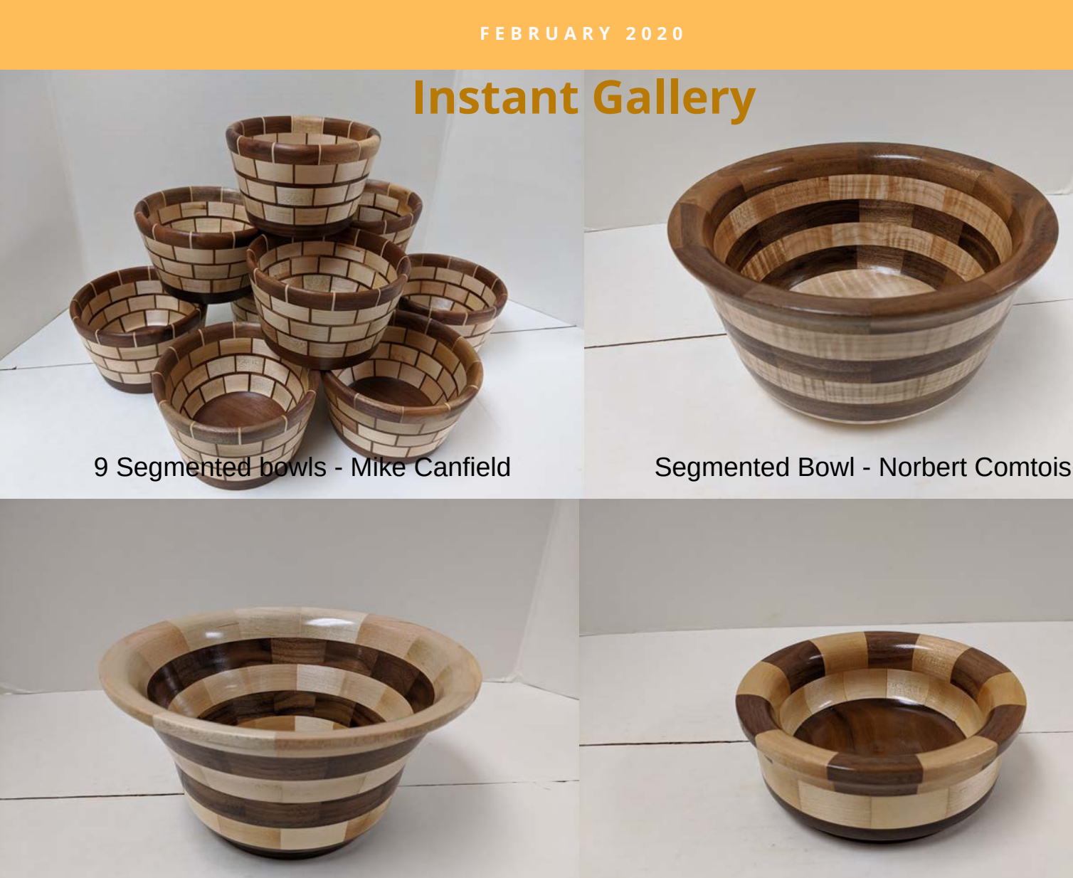
Segmented Bowl - Norbert Comtois Segmented Bowl - Norbert Comtois