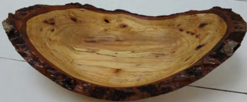
Natural Edge Bowl - Bryce Ellison