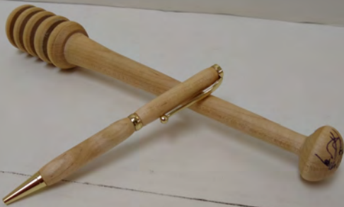
Honey Dipper, Pen - Dillon Canfield