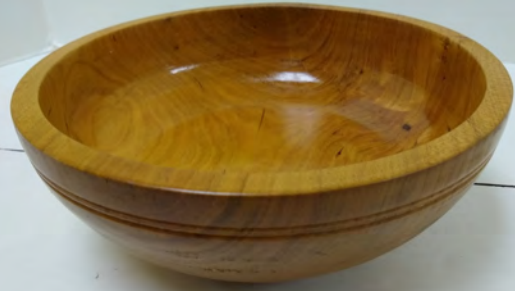
Cherry Bowl - Tim Powers