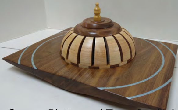
Square Platter and Top - Jon Haigh