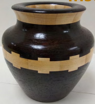
Segmented Vase- Darrel Burkhart