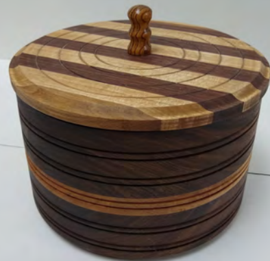
Box and Top - Jon Haigh