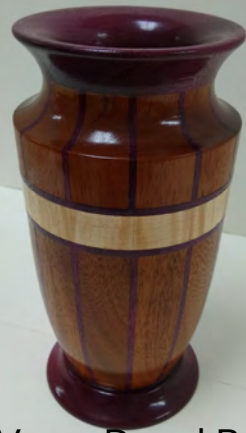
Segmented Vase- Darrel Burkhart