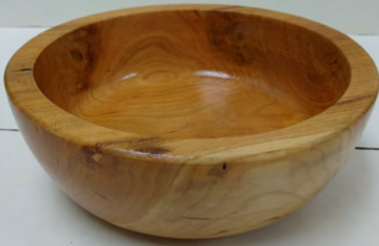
Cherry Bowl - Tim Powers