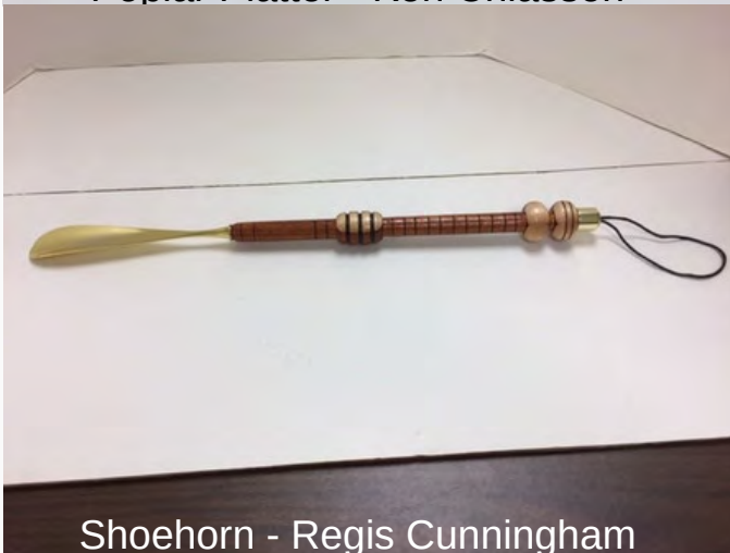
Shoehorn - Regis Cunningham