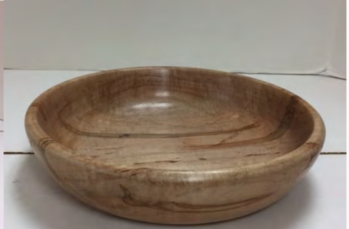
Maple Platter - Ken Chiasson