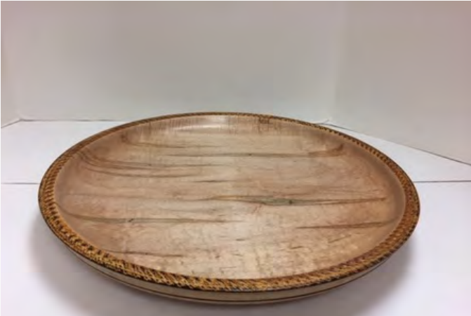
Maple Platter - Ken Chiasson