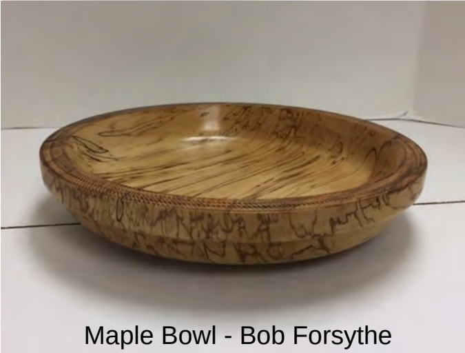
Maple Bowl - Bob Forsythe