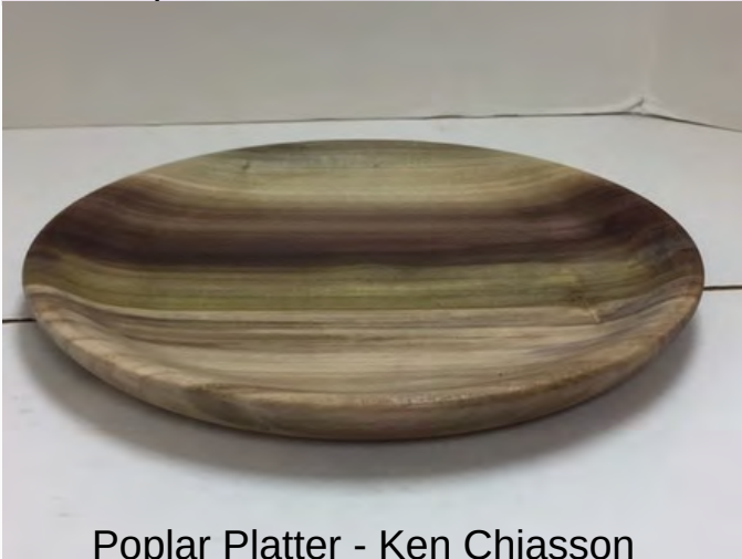
Poplar Platter - Ken Chiasson