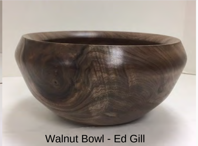
Walnut Bowl - Ed Gill