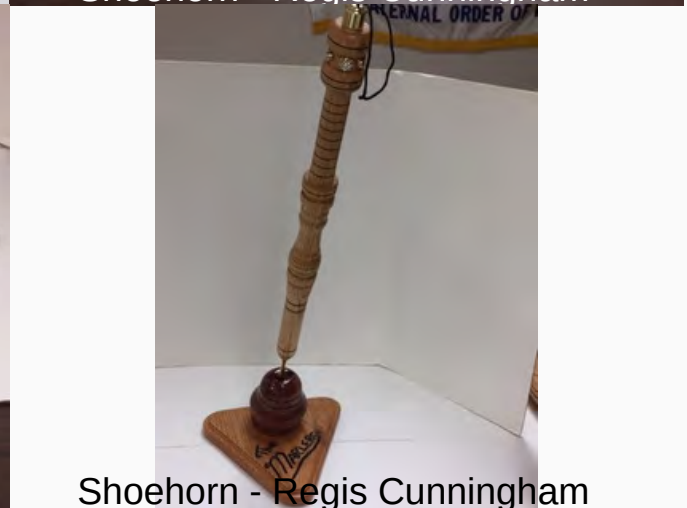
Shoehorn - Regis Cunningham