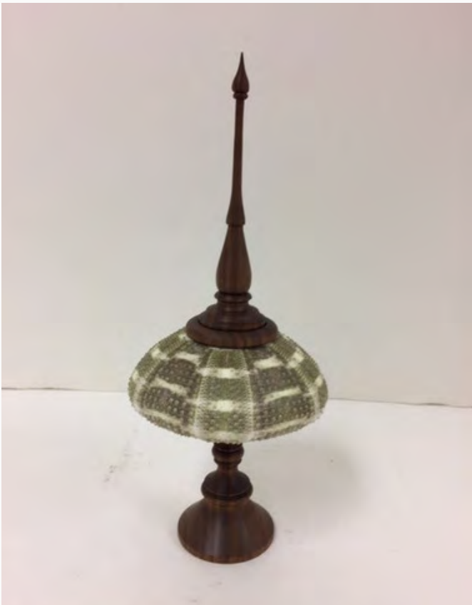
Sea Urchin Ornament - Diana Filbeck