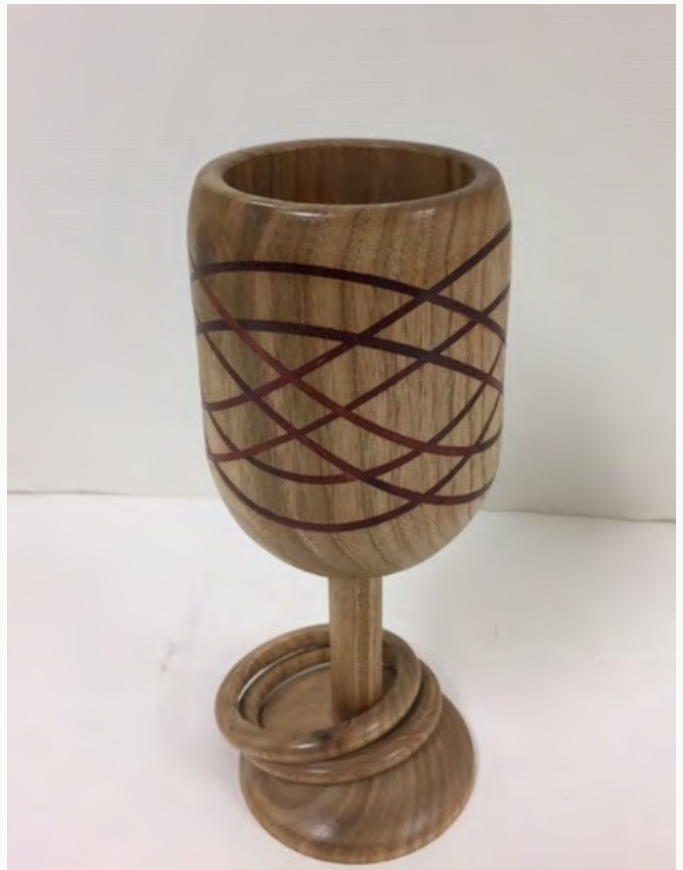
Walnut Goblet - Jon Haigh