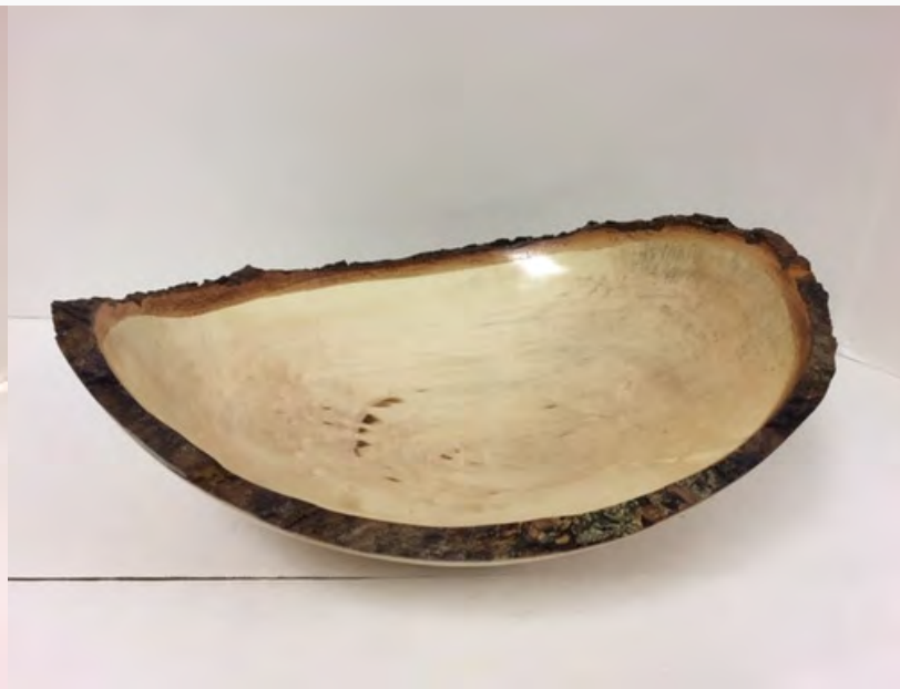
Maple Natural Edge Bowl/Platter - Jim Mason