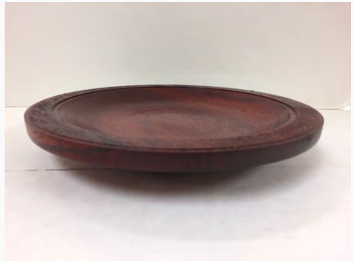
Bubinga Platter - Jon Haigh