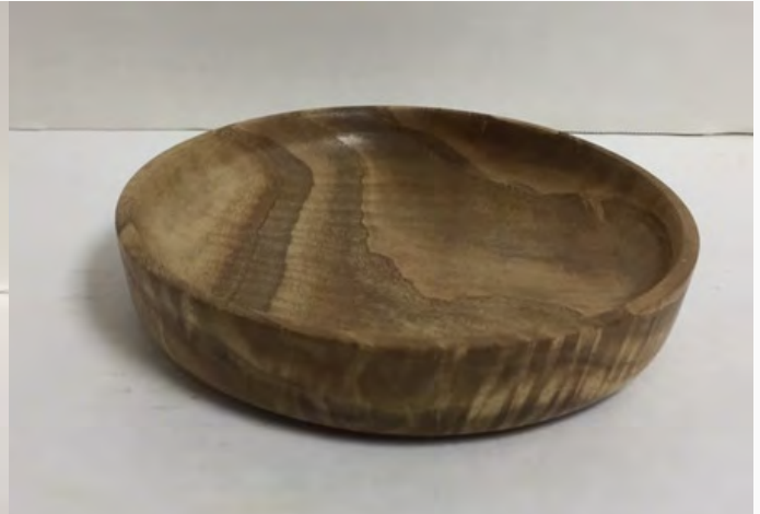
Chestnut Platter - Bryce Ellison