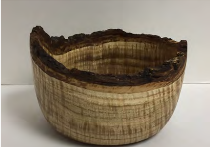
Chestnut Bowl - Bryce Ellison