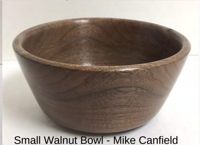
Small Walnut Bowl - Mike Canfield