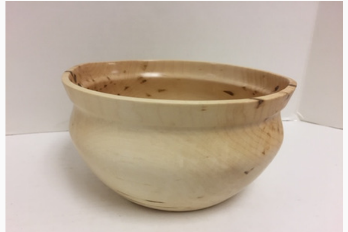
Maple Bowl - Matt Bashore