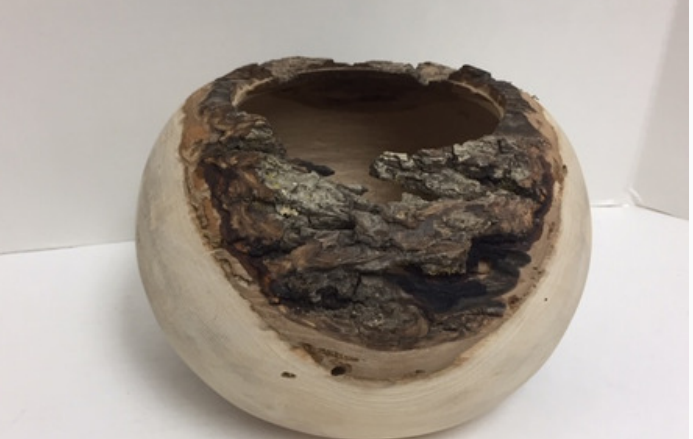
Natural Edge Apple Vase - Bob Forsythe