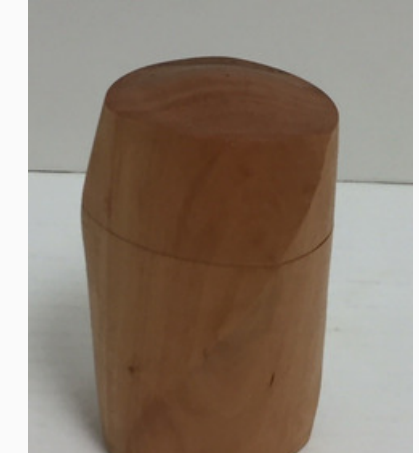
Cherry Offset Box - Matt Bashore