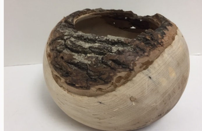
Natural Edge Ash Vase - Bob Forsythe