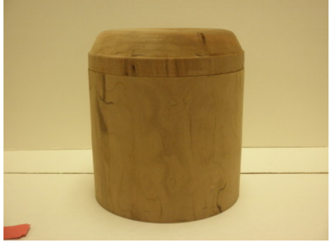
Cherry Bowl fumed with amonia