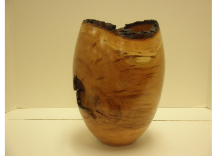
Natural Edge Cherry Vase with Voids