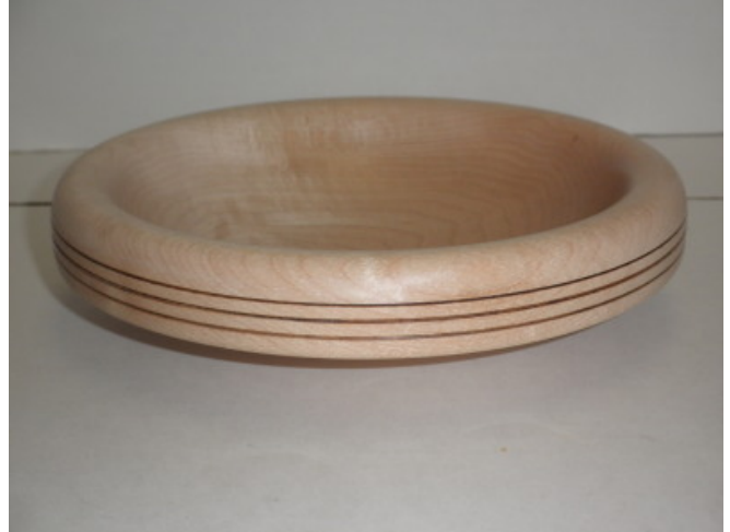
Platter for the Nashville Empty Bowls Project