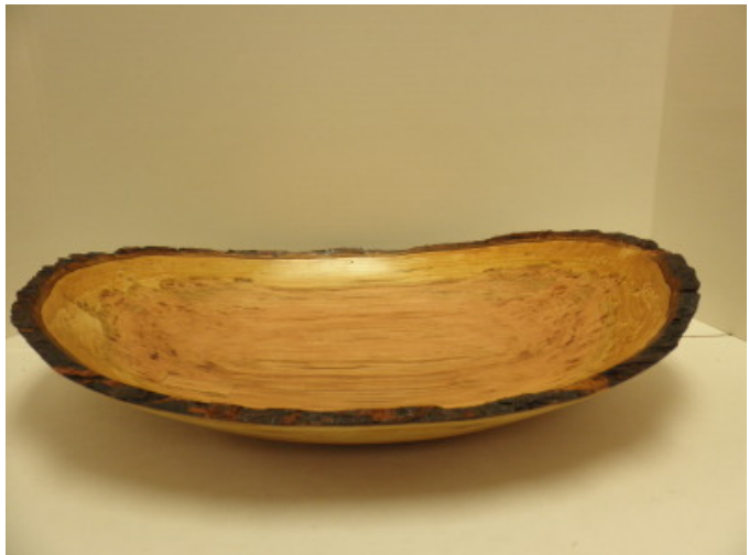
19 Inch Natural Edge Cherry Platter