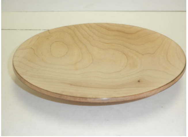
Maple bowl for Nashville Empty Bowls Project