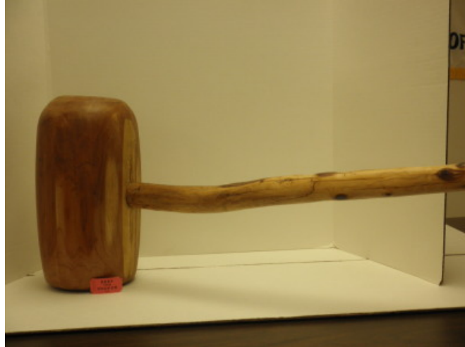
Large Cedar Mallet note the size in relation to the raffle ticket.