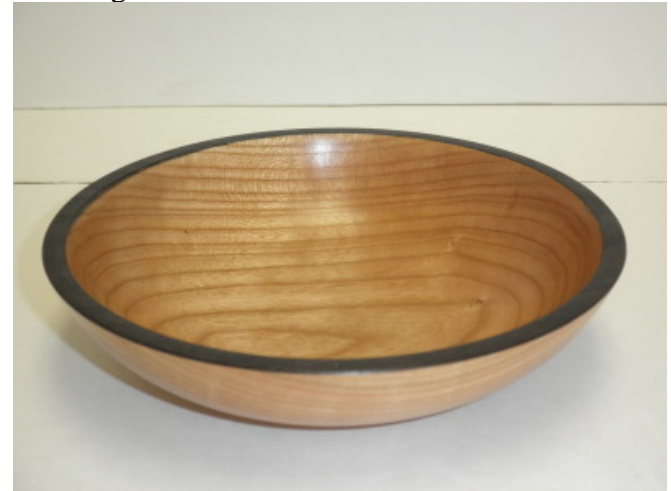
Cherry Bowl for Nashville Empty Bowls Project