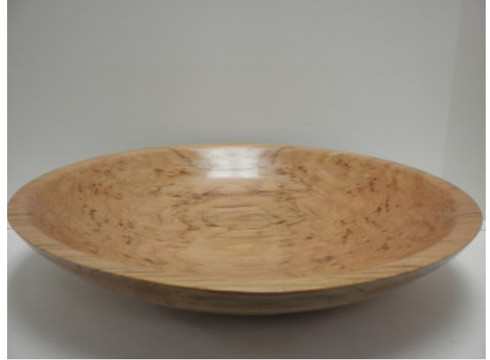
15 Inch Shallow Cherry Salad Bowl