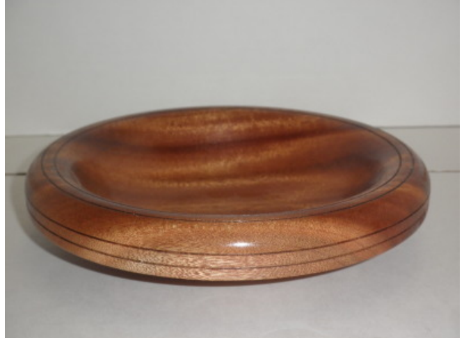
Platter for the Nashville Empty Bowls Project