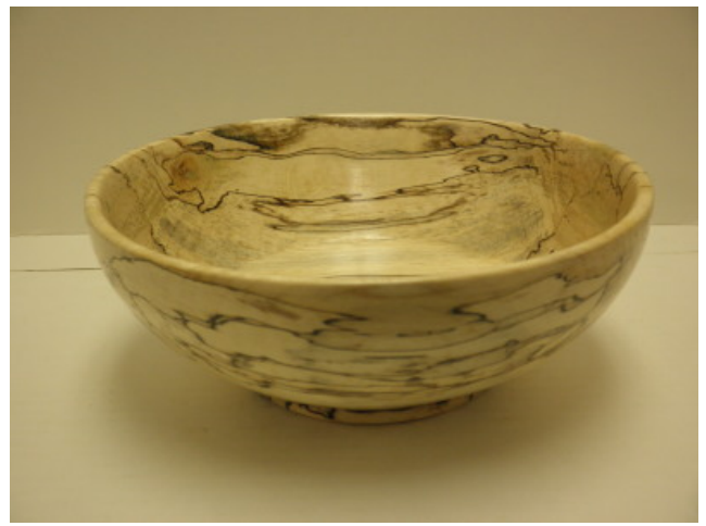
10" Maple Salad Bowl