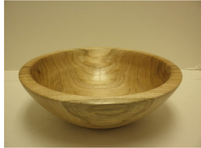
Butternut Salad Bowl