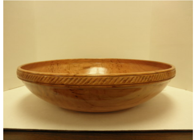
Cherry Salad Bowl 20" Embellished