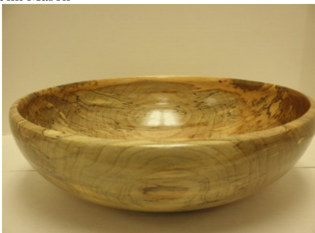
18" Maple Salad Bowl