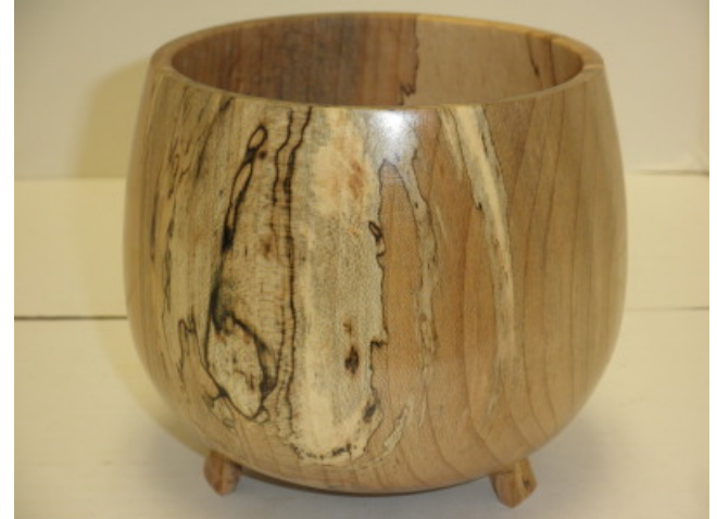
Maple three-legged Deep Bowl