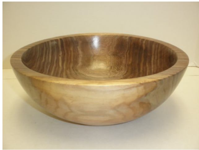
Walnut Salad Bowl