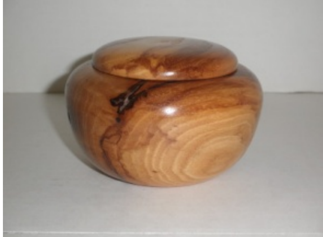
Pecan lidded box