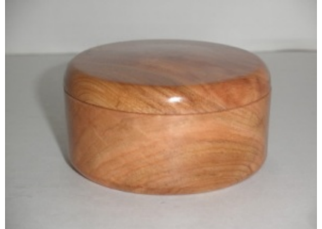
Cherry Lidded Box