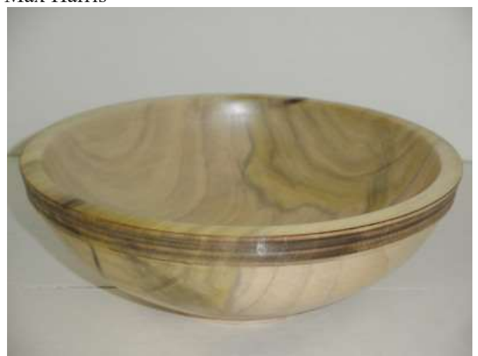
Poplar Salad Bowl