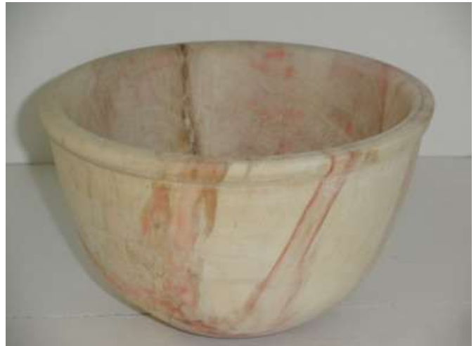
Box Elder bowl with no finish.