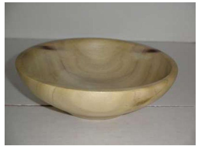
Poplar Salad Bowl