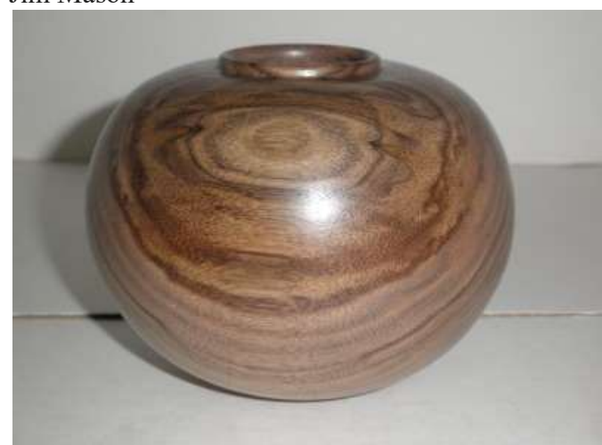
Walnut hollow form