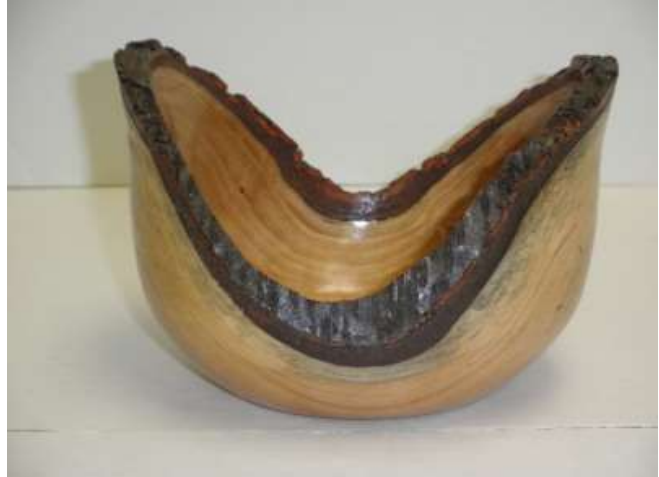
Natural Edge Cherry Bowl