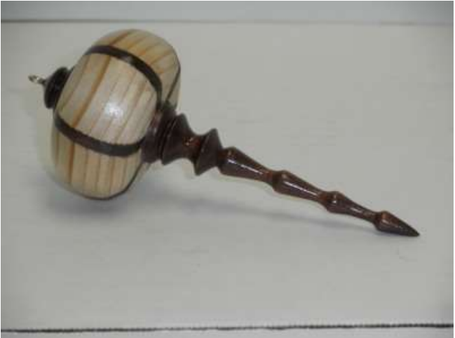
Segmented turned ornament