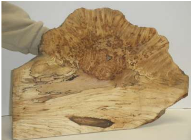
Large burl slice