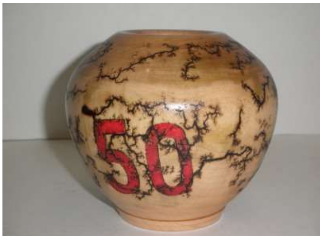
Electrically charged burns on turned vase