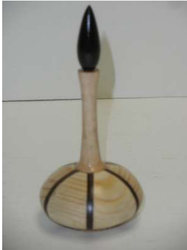
Segmented ring holder