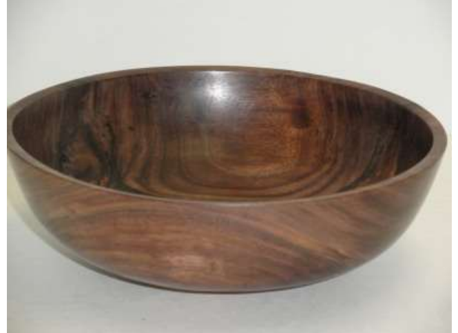
Large Walnut Salad Bowl