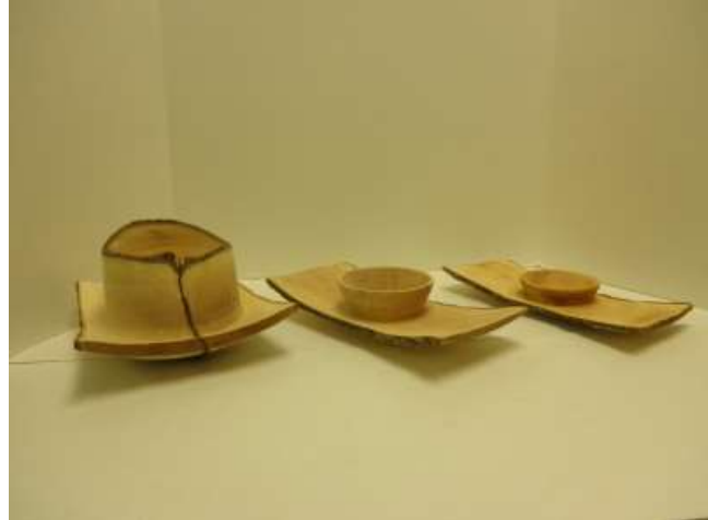
Bradford Pear Cheese and Dip