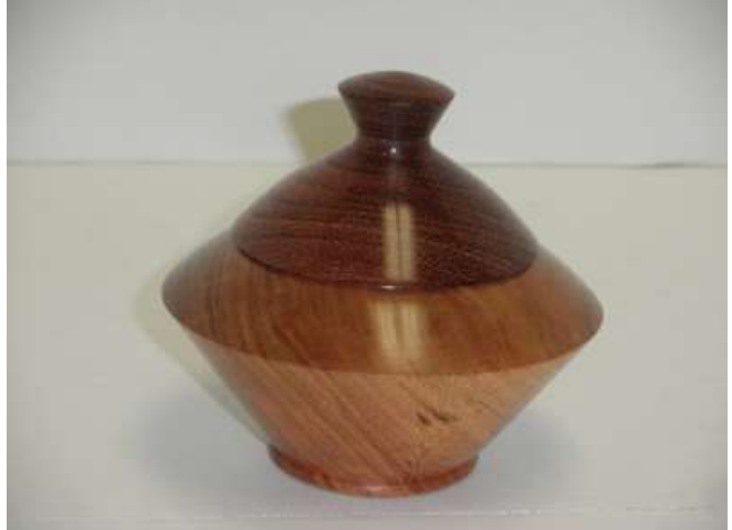
Round Cherry Box with Paduk Lid