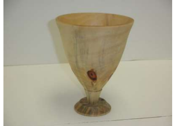
Norfolk Island Pine from Rudy Lopez wood