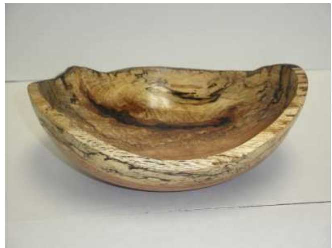
Natural Edge Bowl form Oak Crotch