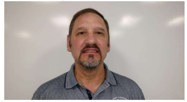
The Presidents Message ...

We have the summer season upon us and the Farmers Market scheduled for the 1st and 3rd Saturday of each month starting on 20 May.