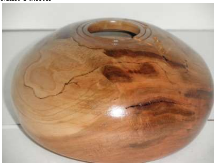
Hollow Form - Cherry