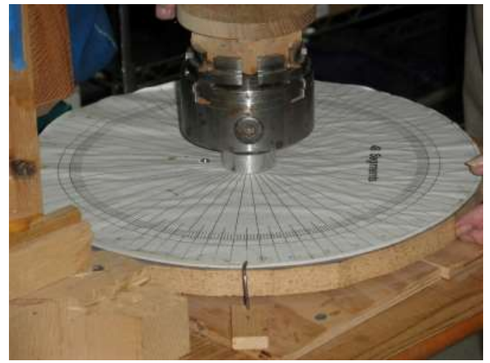
His indexing chart used for obtaining precise angles when cutting the hundreds of pieces in each of his turnings.