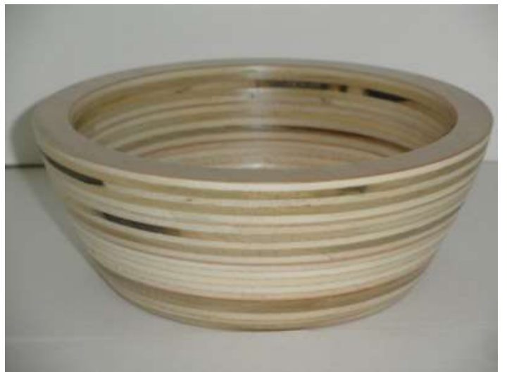
Salad Bow from Plywood