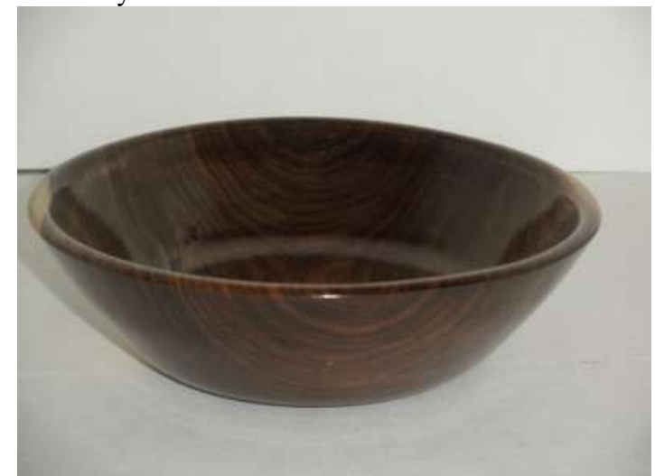
Walnut Salad Bowl