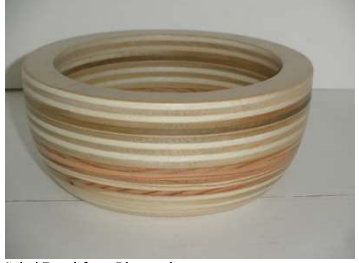
Salad Bowl from Plywood