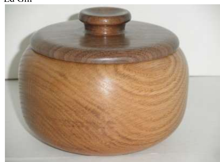
Oak Bowl with Walnut Lid