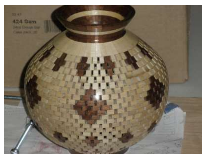
One of Bob Myers turnings