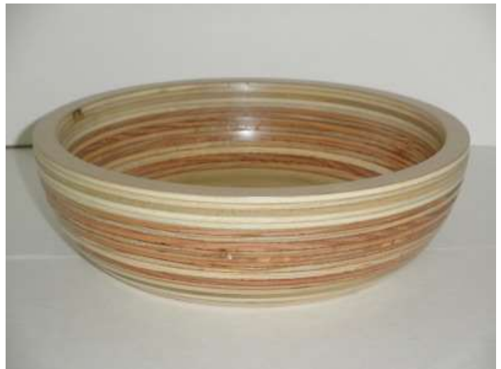
Salad Bowl from Plywood