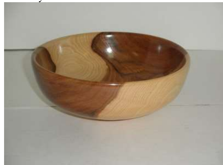
Elm Salad Bowl