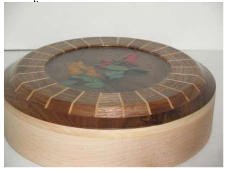
Jewelry Box of Walnut and Maple