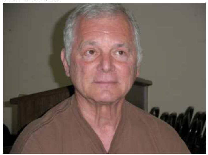
Visitor from the Nashville Club (TAW)