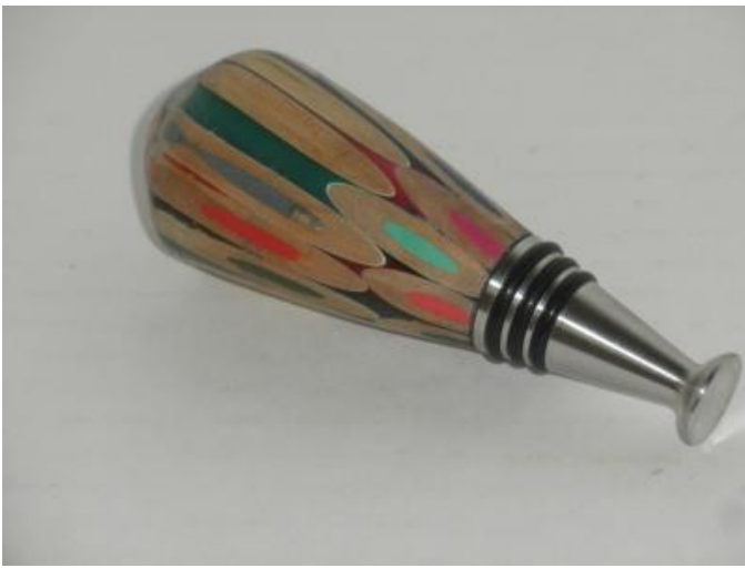
Bottle Stopper made of Pencils