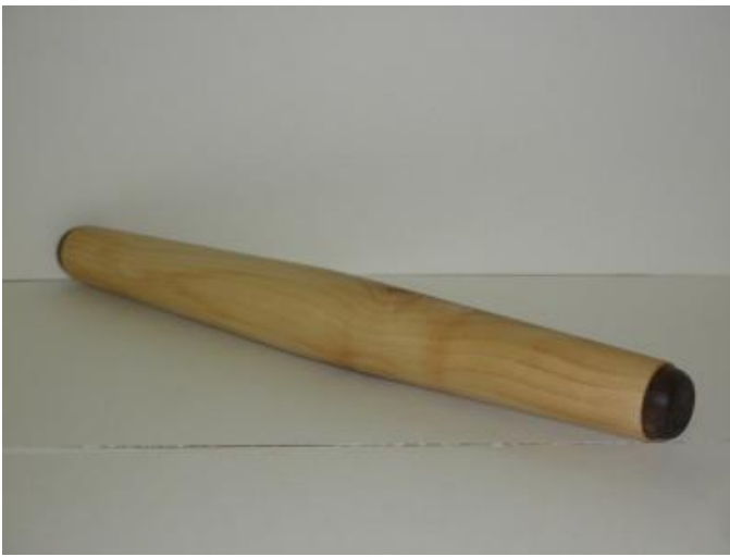
French Rolling Pin – Cherry and Walnut