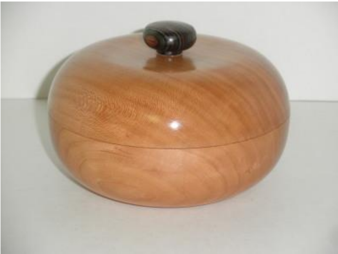
Cherry Lidded Box