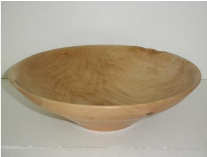
Cherry Salad Bowl