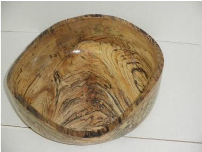
Elm Crotch Salad Bowl