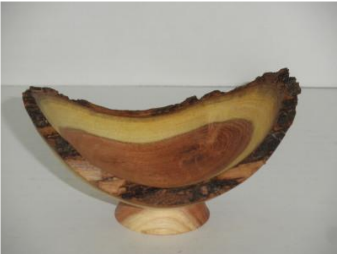
Dogwood Natural Edge Bowl