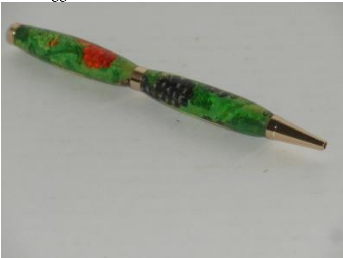
Painted Writing Pen