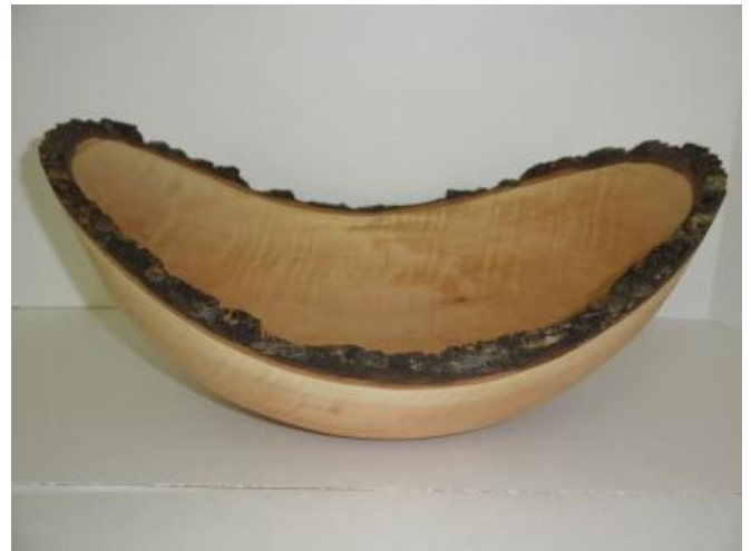
Eighteen inch Elm Natural Edge Platter