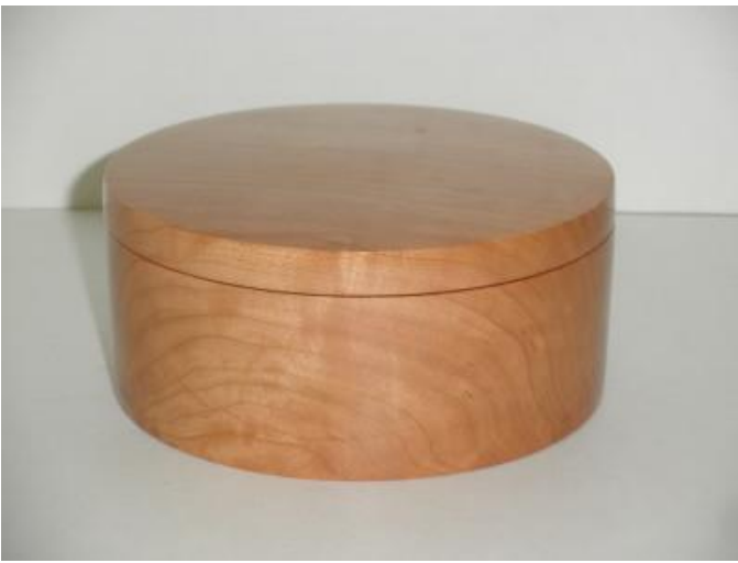
Cherry Lidded Box