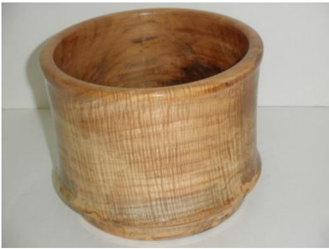
Spalted Maple Bowl