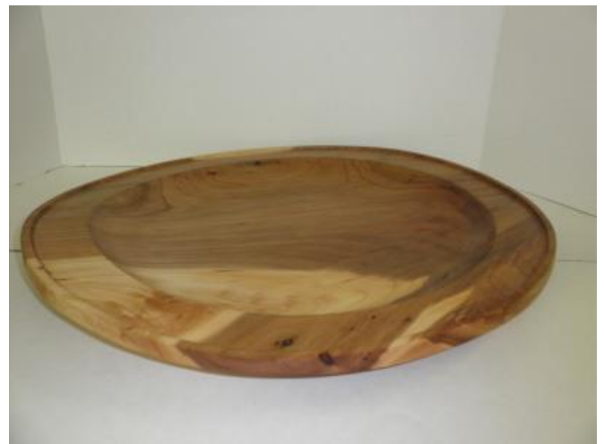
Bradford Pear Bowl