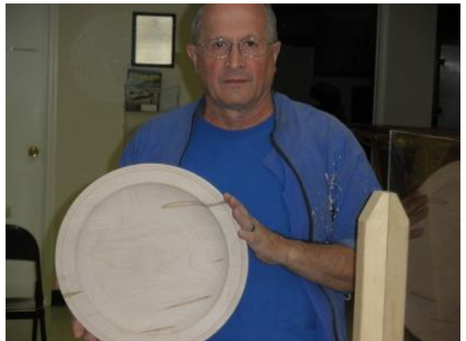
Completed 15 inch platter of Ambrosia Maple