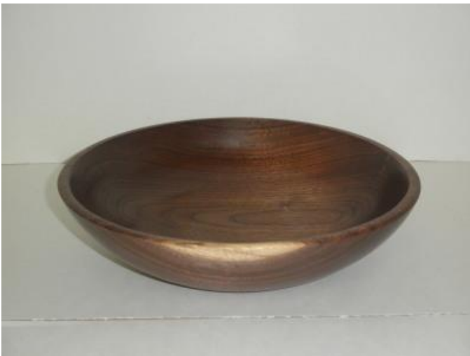
Walnut Salad Bowl