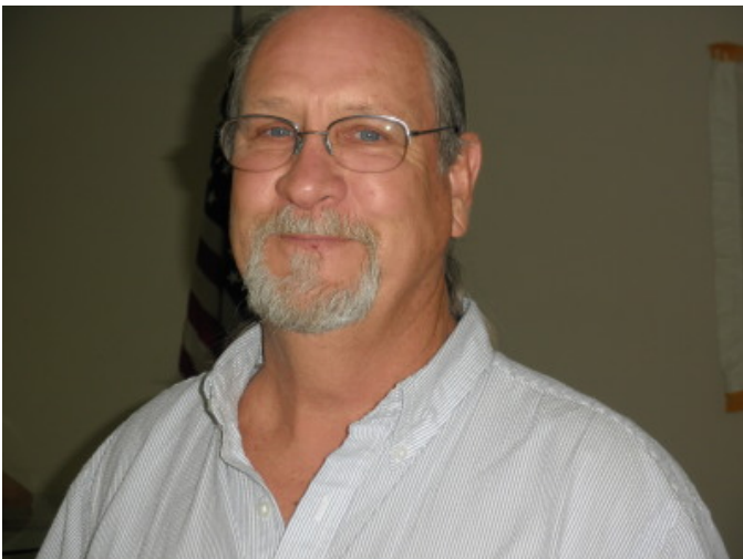
1408 Soules Chapel Rd, Cumberland Furnace, TN 615 219 2194 lilygfarms@gmail.com