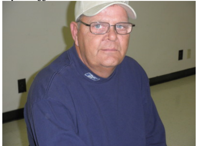
3516 Hwy 12 N., Ashland City, TN 37015 Cell 615 438 4233 cbfgman1@aol.com