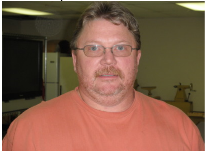
1324 Old Stewart Rd, Tennessee Ridge, TN 37178 Cell 931 721 8674 mtwstavely@peoplestel.net