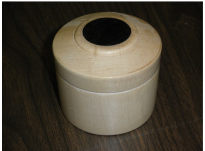
Maple Lidded Box