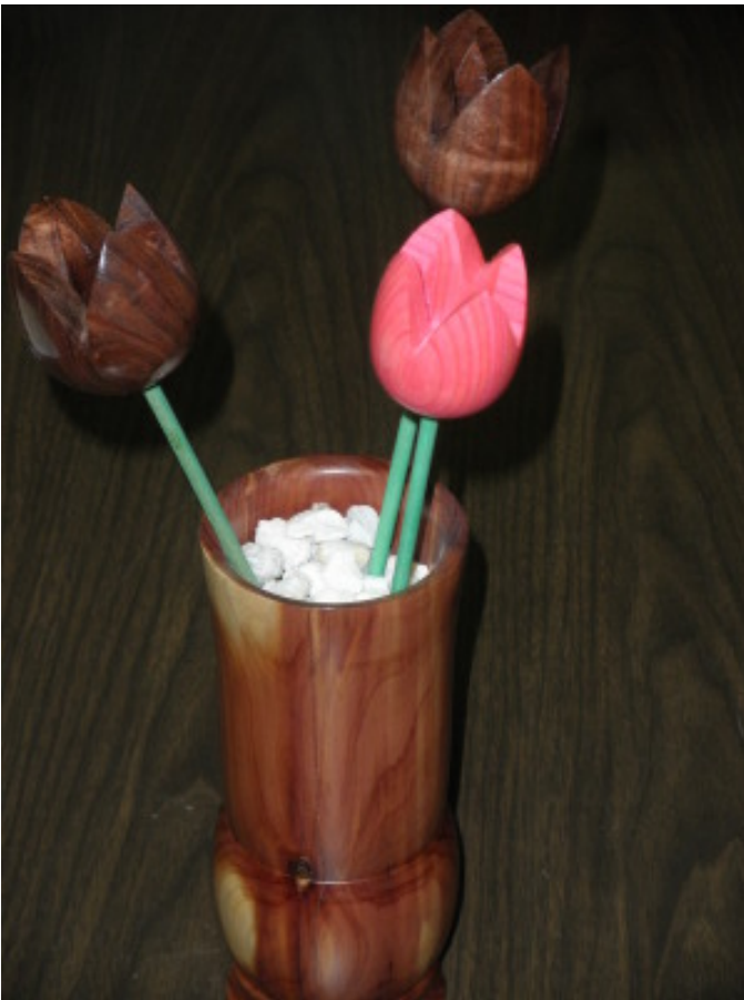
Vase with Colorwood and Walnut Tulips