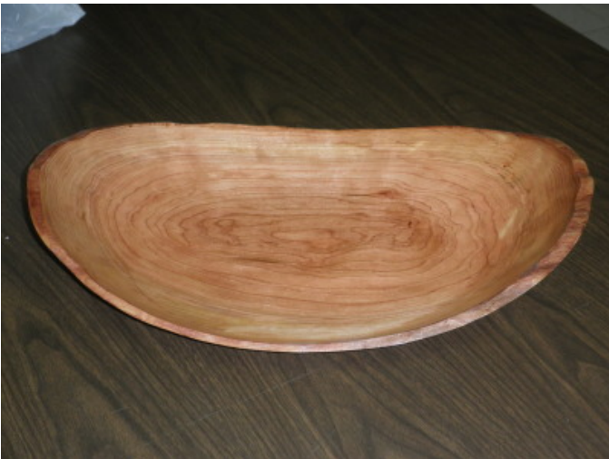
18 inch Natural Edge Cherry Platter