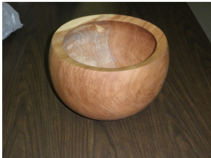
8 X 11 Pecan Salad Bowl