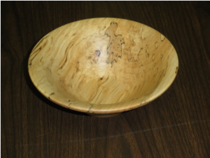
8 inch Spalted Maple Salad Bowl