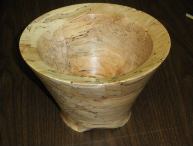
10 inch Spalted Maple Bowl