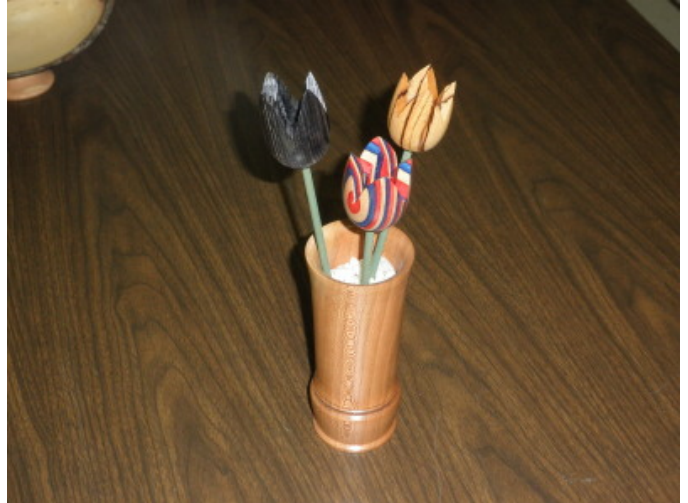
Vase with Colorwood and Zebra Wood Tulips