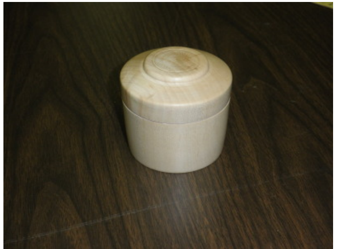
Maple Lidded Box