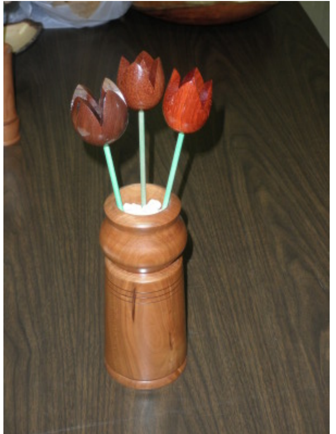
Vase with Walnut, Lacewood & Zebrawood Tulips