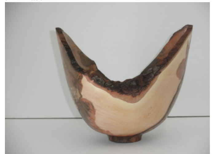
Eight X Eight Natural Edge Dogwood Bowl