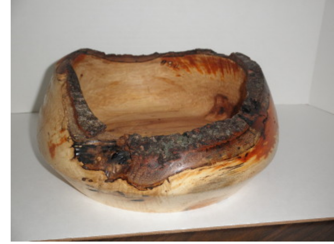
Eight Inch Natural Edge Maple Bowl