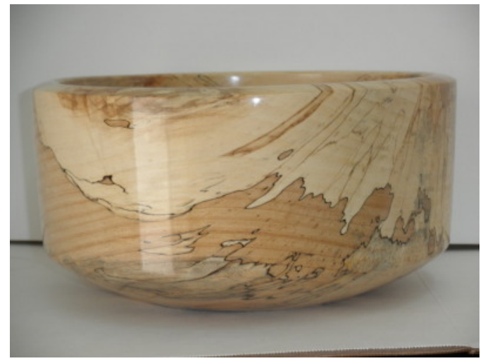
Twelve Inch Spalted Maple Salad Bowl