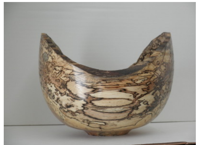
Eight X Ten Natural Edge Spalted Elm Bowl