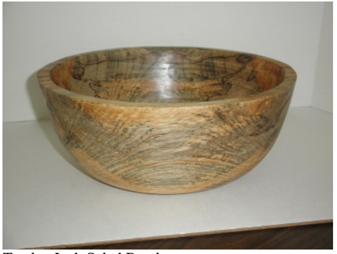
Twelve Inch Salad Bowl