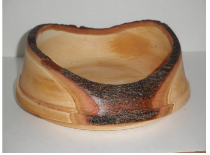
Seven Inch Natural Edge Maple Bowl