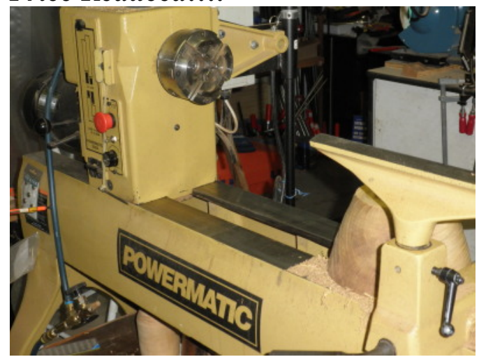
Lathe for Sale – $2,200 including mobile base.

This is an original 3520A (not a "b" model) It is in like new condition. The seller has a shop full of accessories...chisels, chucks, vacuum system, extra lights, grinding systems, etc.