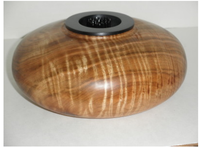
Tiger Maple Bud Container. See his other works in the Show 'n Tell section