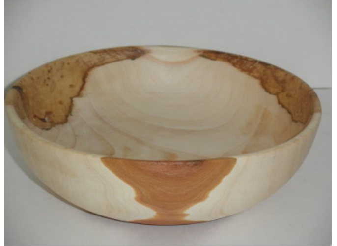
Maple Salad Bowl