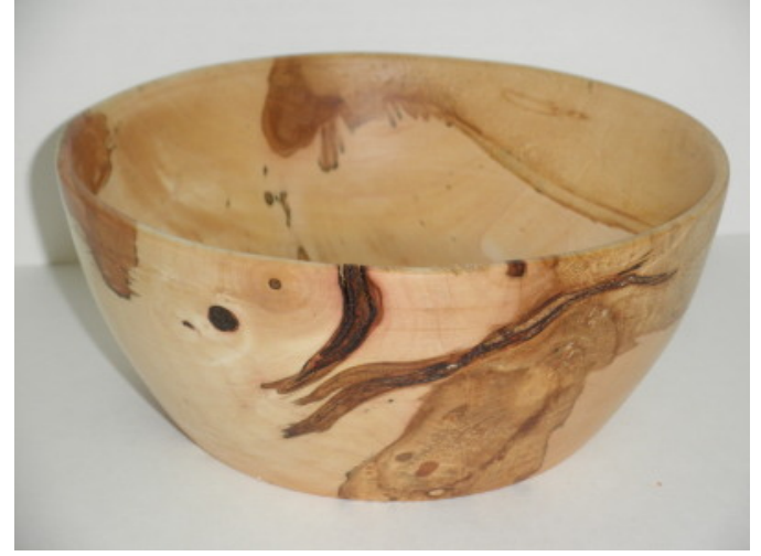
Maple Salad Bowl