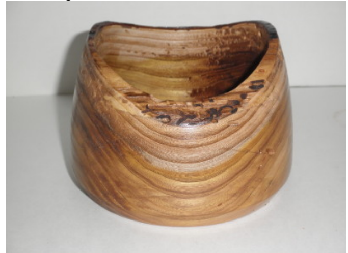
Redbud Natural Edge Bowl