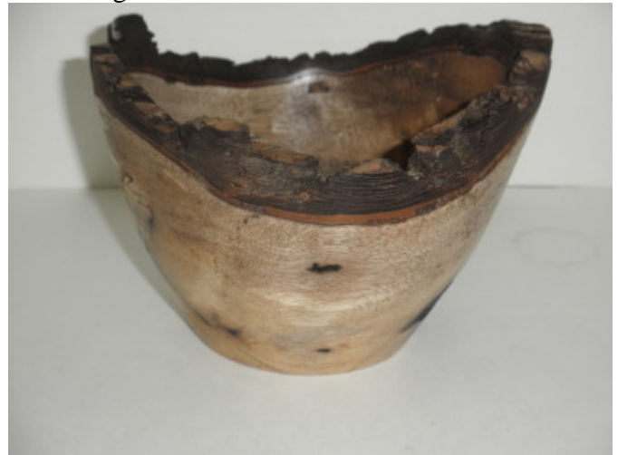
Four Inch Natural Edge Persimmon Bowl