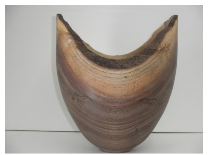
Ten X Ten Natural Edge Walnut Bowl