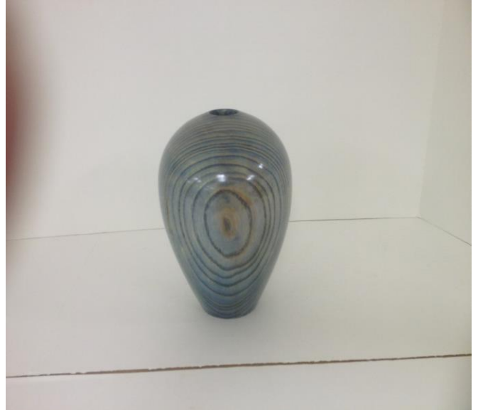
Ash Hollow Vase with Blue Dye