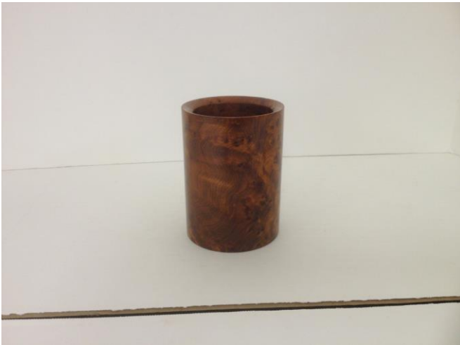
Exotic Wood Cup