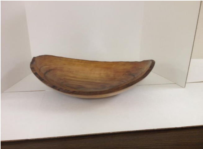
Nineteen Inch Natural Edge Cherry Platter