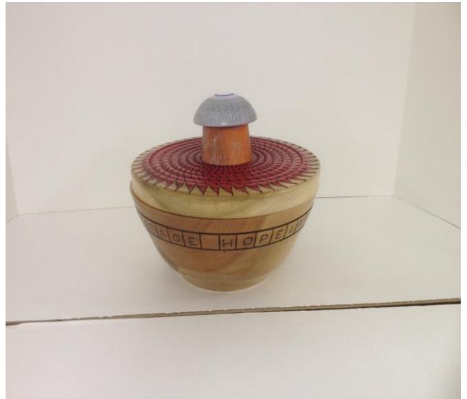
Bowl with Lid for the Beads of Courage project