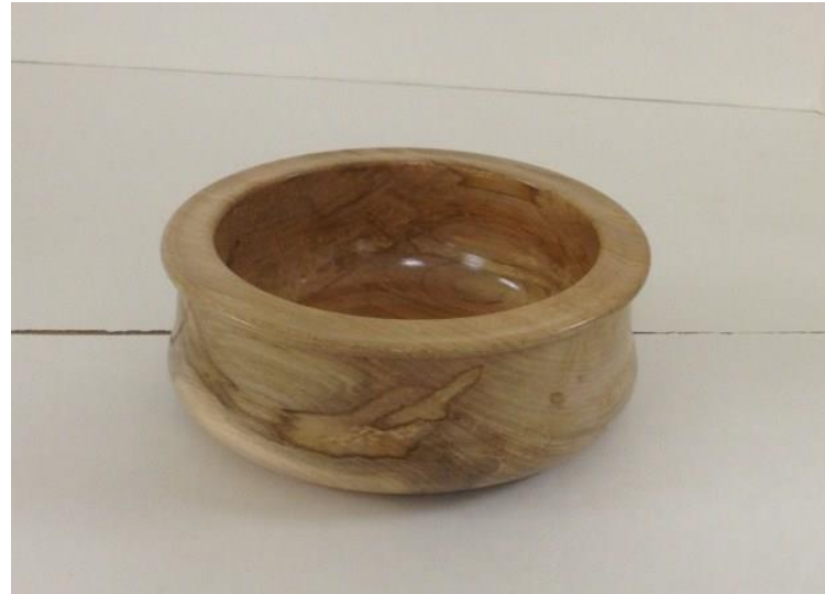
Ambrosia Bowl for Empty Bowl Project