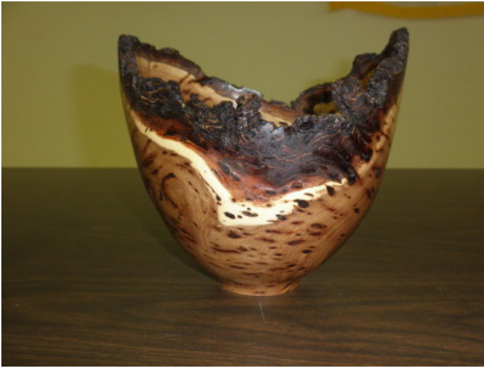
Siberian elm bowl/vase with bark