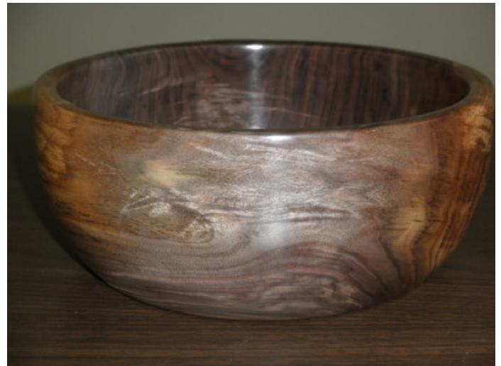
10 inch walnut salad bowl