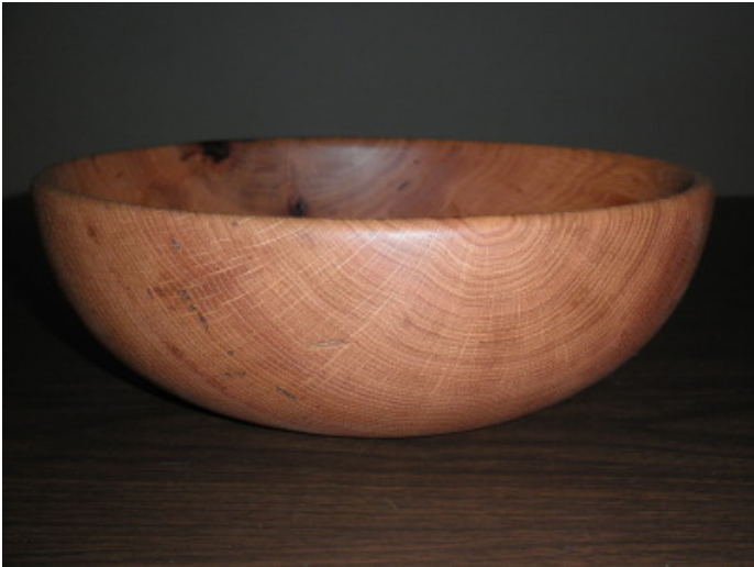
12 inch oak salad bowl