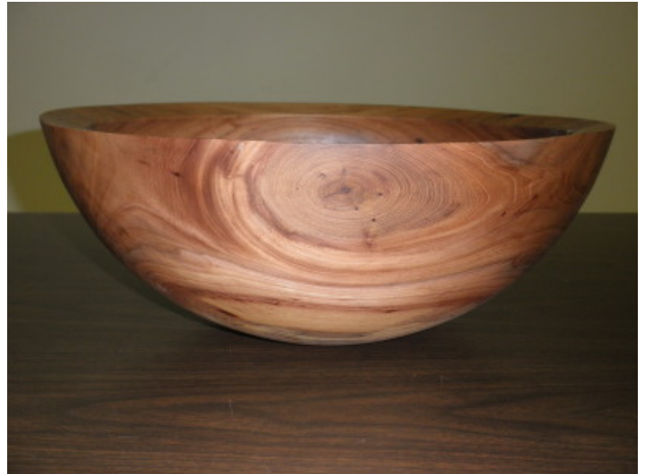
18 inch elm salad bowl