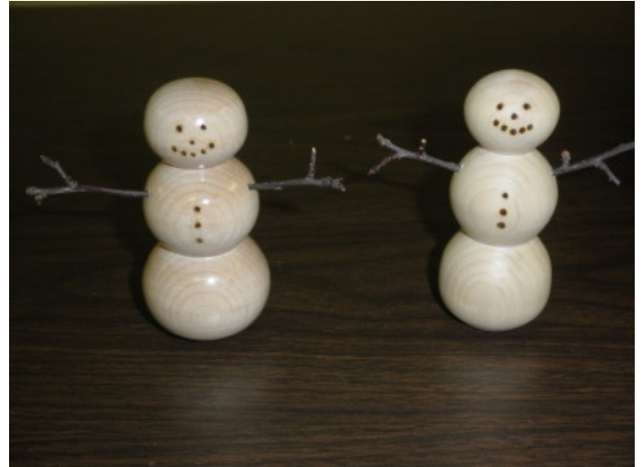
Yellow poplar and maple snowmen