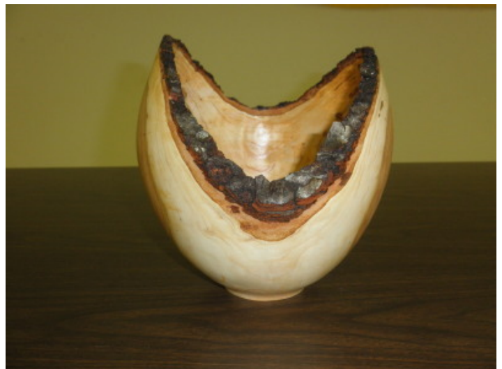
8 inch cherry natural edge bowl/vase