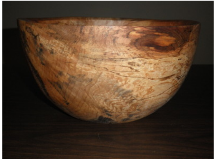
14 inch Spalted Maple Salad Bowl