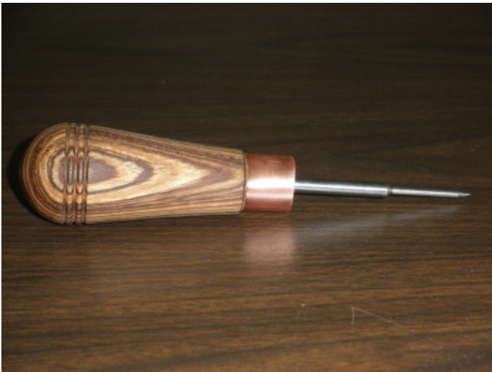
Zebra wood awl