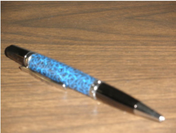
Blue/black poly clay pen