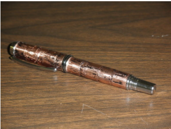
Copper stompunk pen