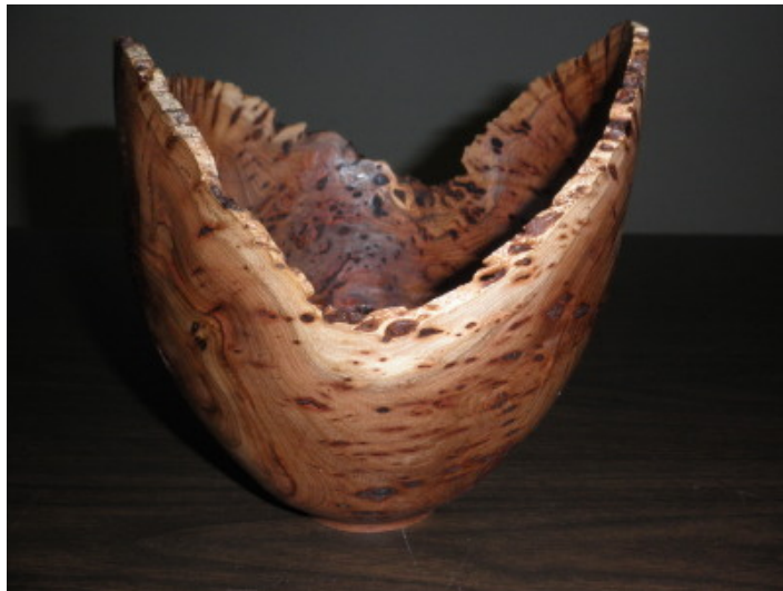
Siberian elm natural edge vase without bark