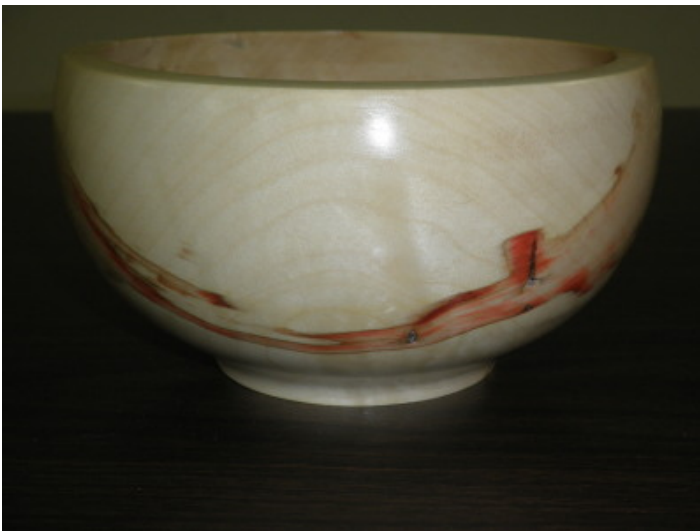
Box elder maple bowl