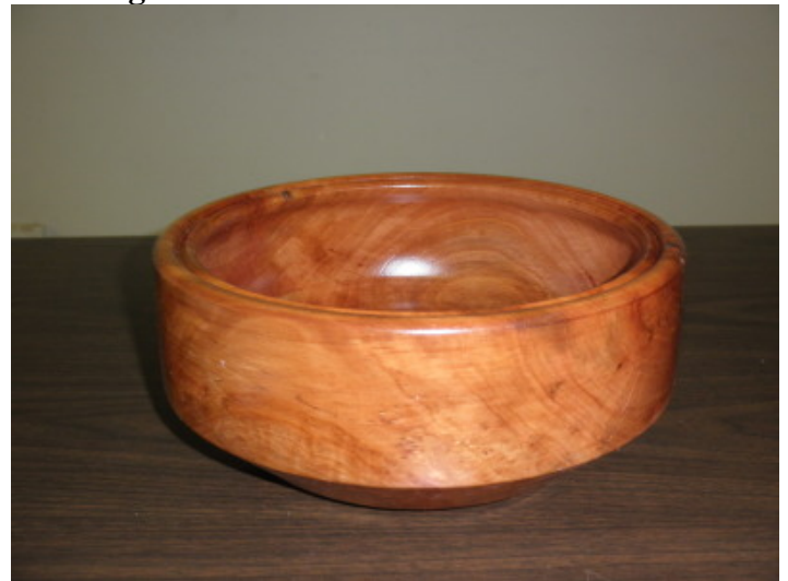
14 inch Cherry salad bowl