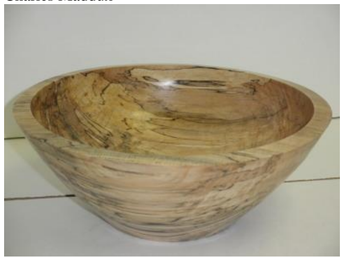
Spalted maple salad bowl