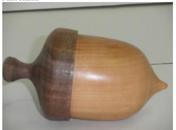
Walnut and maple acorn