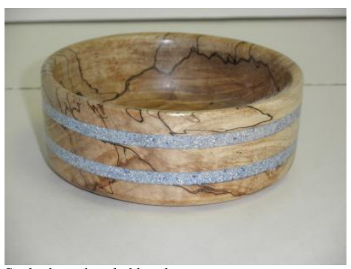
Spalted maple salad bowl