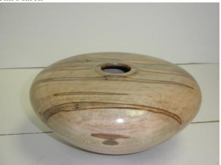
Ambrosia maple hollow form