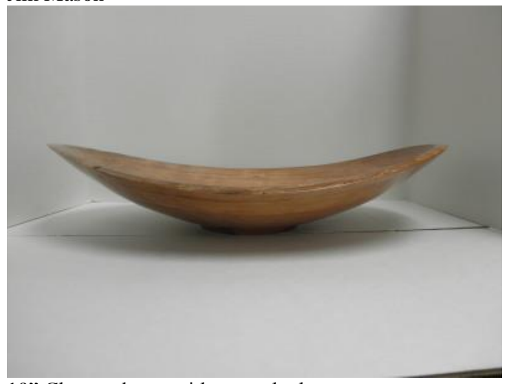
19" Cherry platter with natural edge