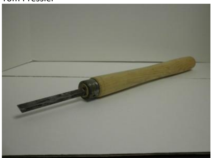
Hickory Tool Handle