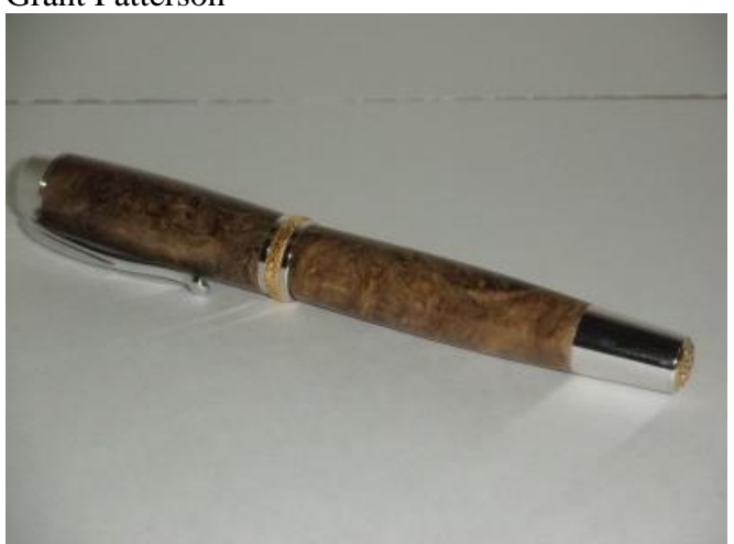
Polyanna burl Statesman pen