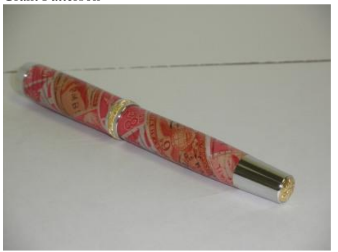
Vintage air mail stamps Statesman pen