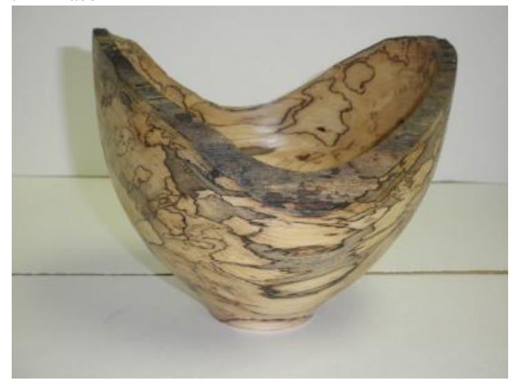
Spalted elm natural edge bowl