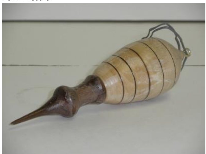
Ornament of walnut and crepe myrtle