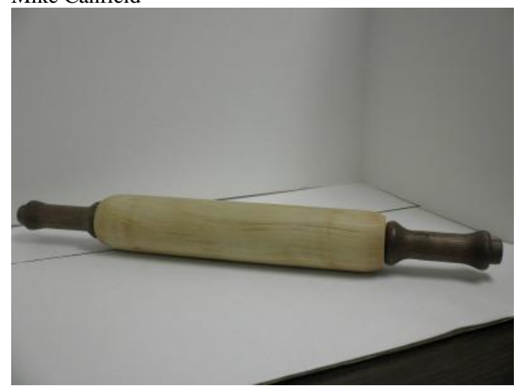
Rolling pen made of fog wood