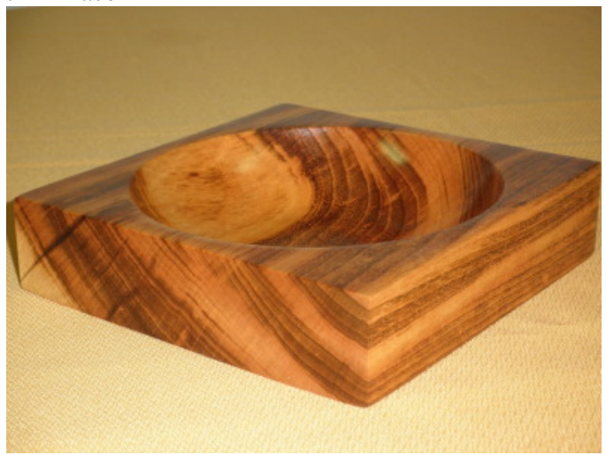
Square Bowl of Unidentified Wood