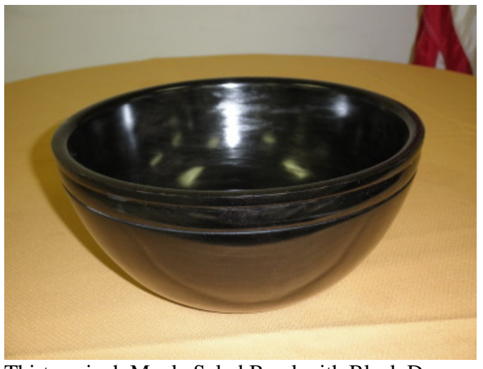
Thirteen inch Maple Salad Bowl with Black Dye