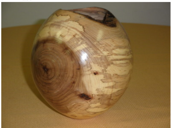
Natural Edge Vase of Spalted Elm