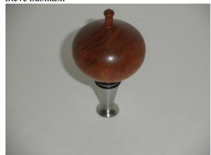
Goncald? Bottle Stopper