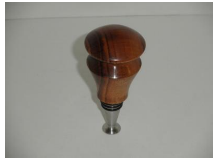
Jatoba Bottle Stopper