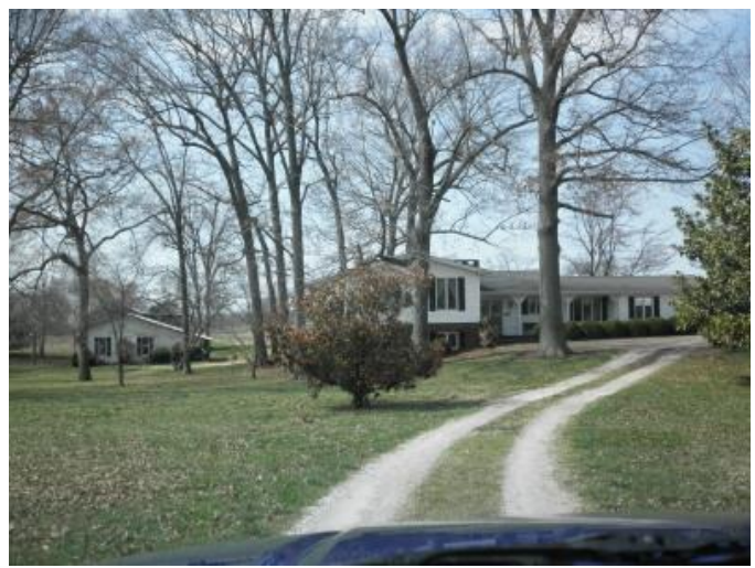
Tom lives on a big farm in this beautiful setting as shown with his workshop left rear.