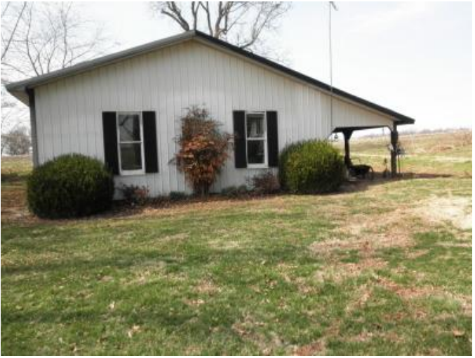
Tom's shop is packed full of woodworking tools and materials.