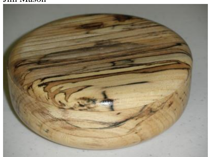
Spalted Elm Lidded Box