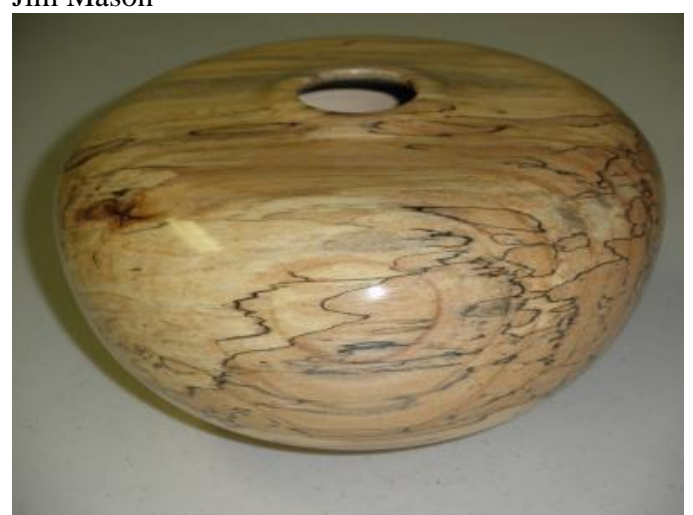
Spalted Elm Hollow Form