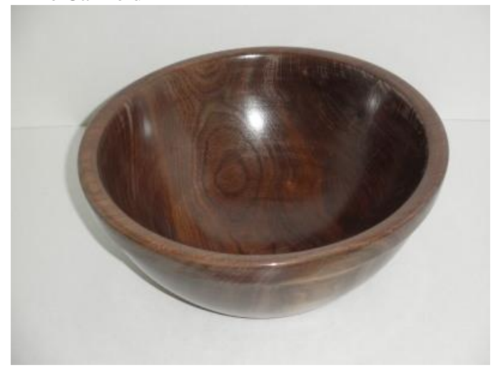
Walnut Salad Bowl