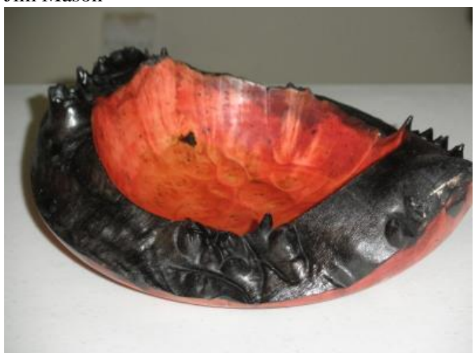
Poplar Burl Bowl Dyed Red and Black