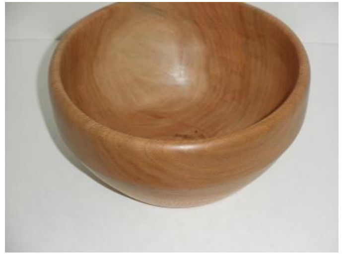
Cherry Salad Bowl