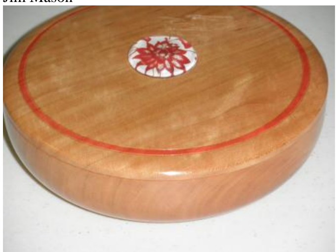
Cherry Lidded Box with Red Dye and Medallion