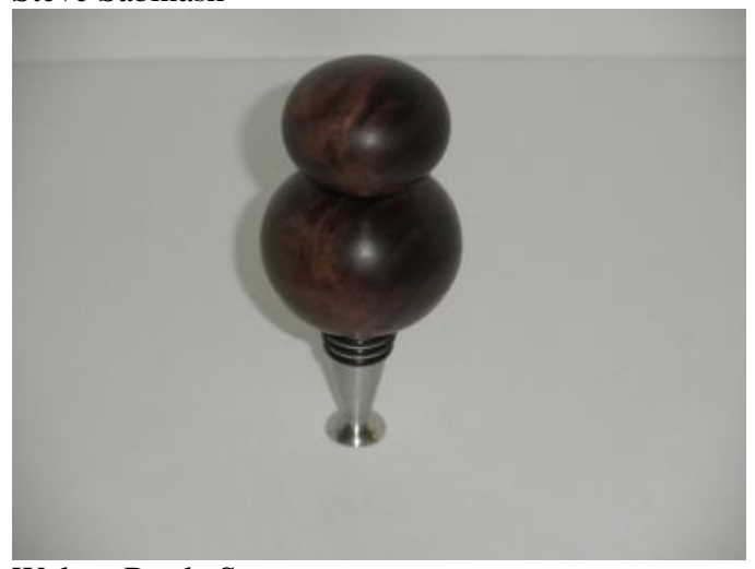
Walnut Bottle Stopper