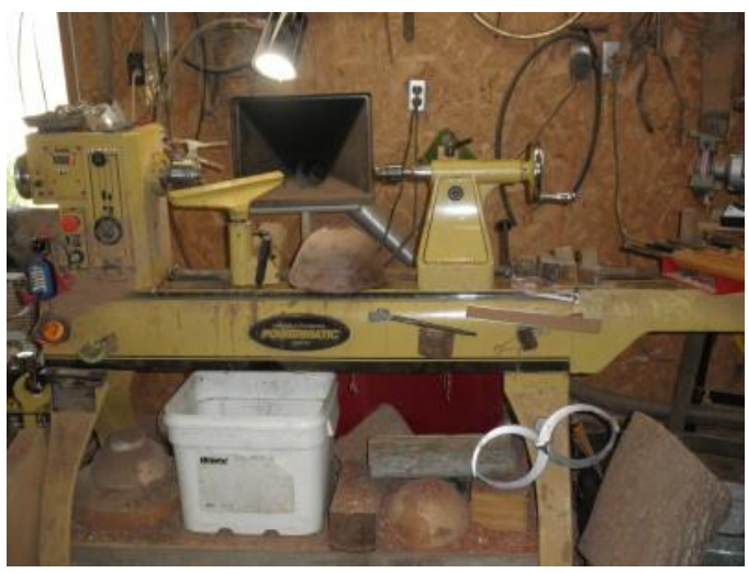
This is one of two lathes where he does his turning.