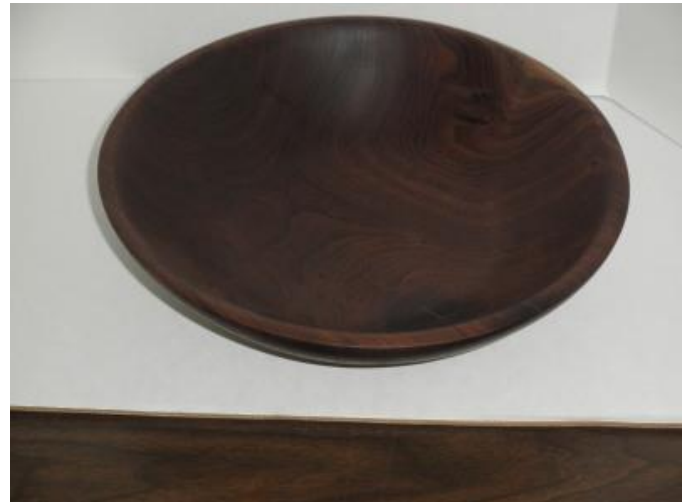
Walnut Salad Bowl