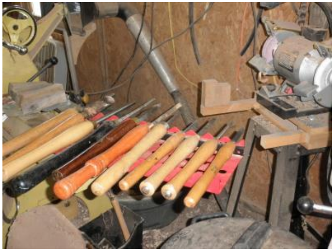
Here are his tools and sharpening system.