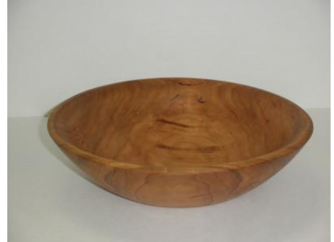
Eight Inch Cherry Salad Bowl