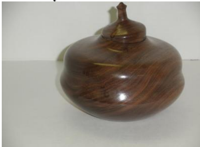
Walnut Lidded Box