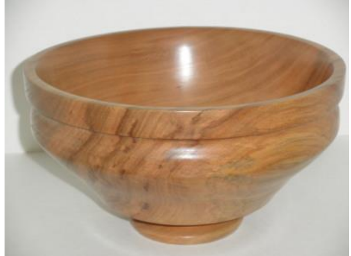
Ten Inch Cherry Bowl