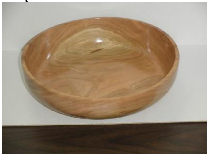
Thirteen Inch Cherry Salad Bowl