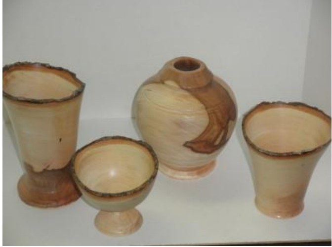
Four Natural Edge Maple Items