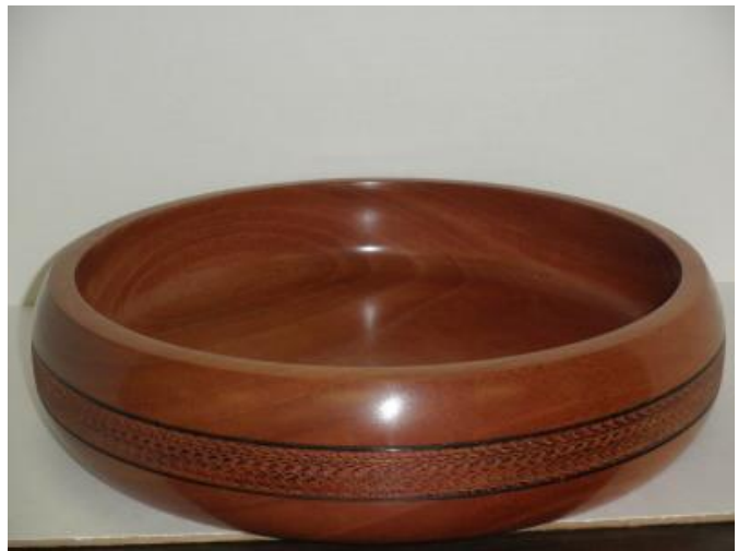
Fifteen Inch Mahogany Platter