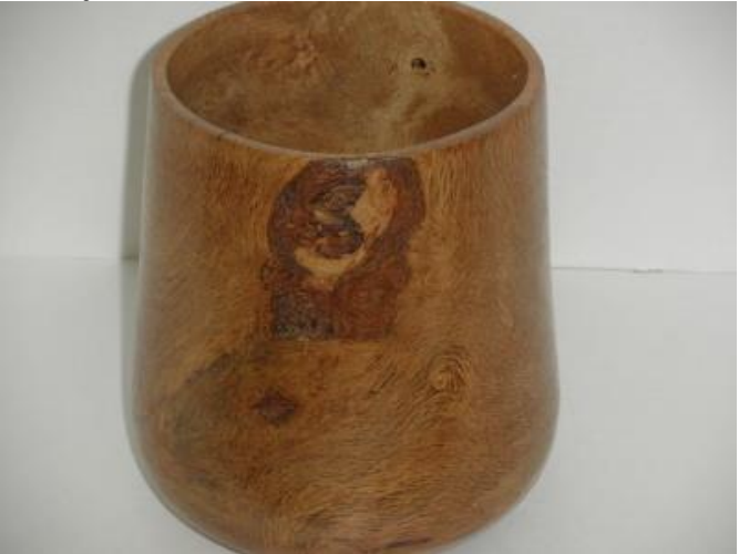
Oak Burl Vase