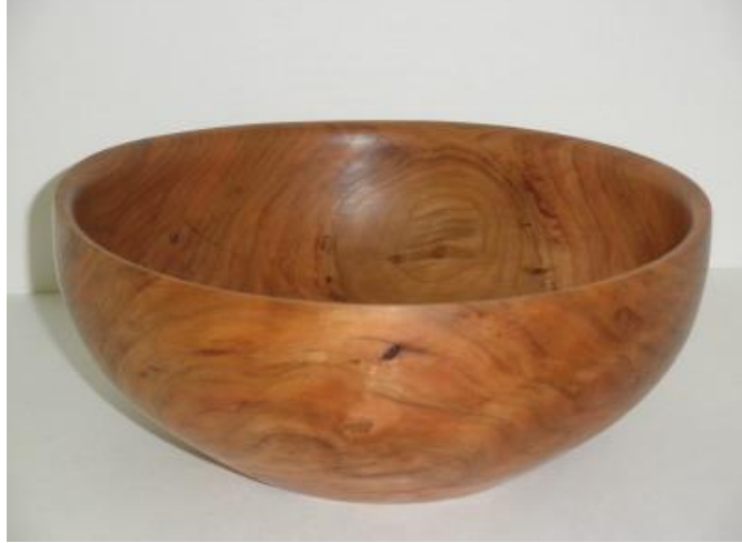
Ten Inch Cherry Salad Bowl