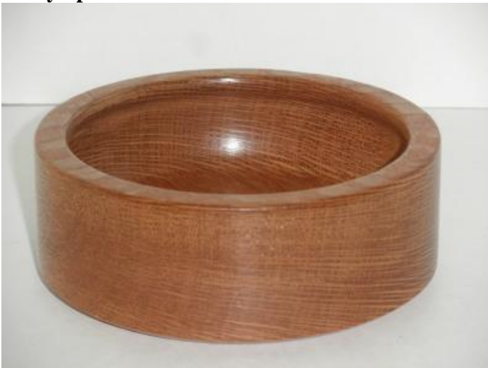
6" Lacewood Bowl