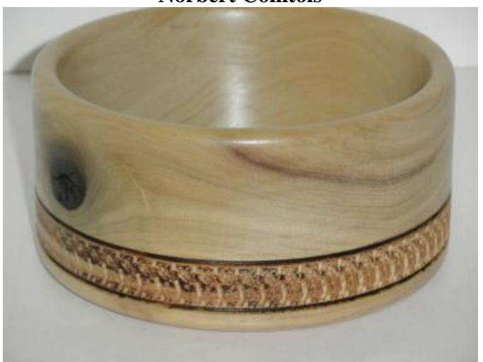
Six Inch Poplar Bowl