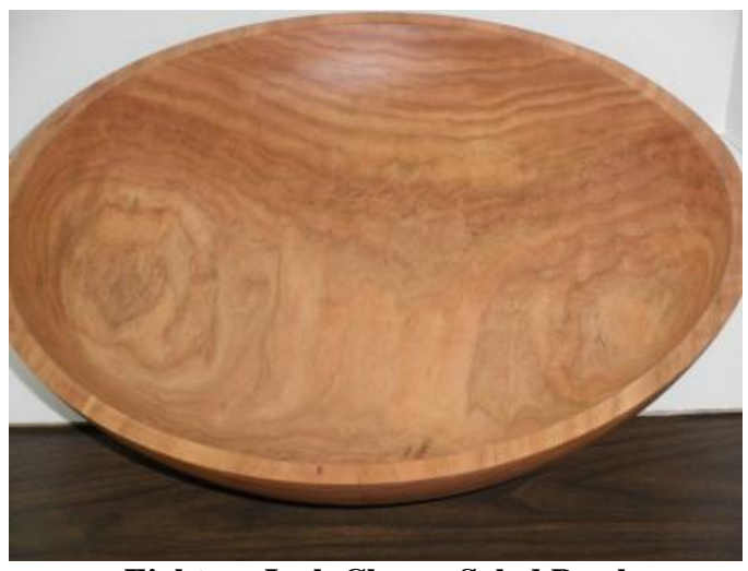
Eighteen Inch Cherry Salad Bowl