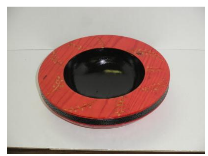
Ten Inch Ash Bowl Dyed and Carved