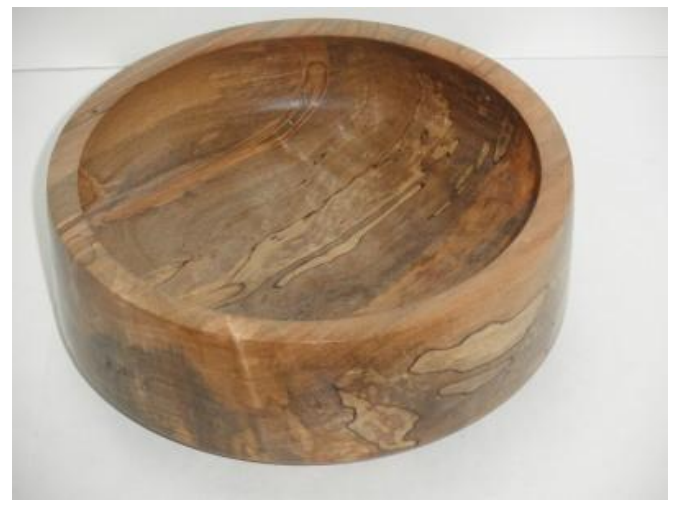
Eight Inch Spalted Maple Bowl