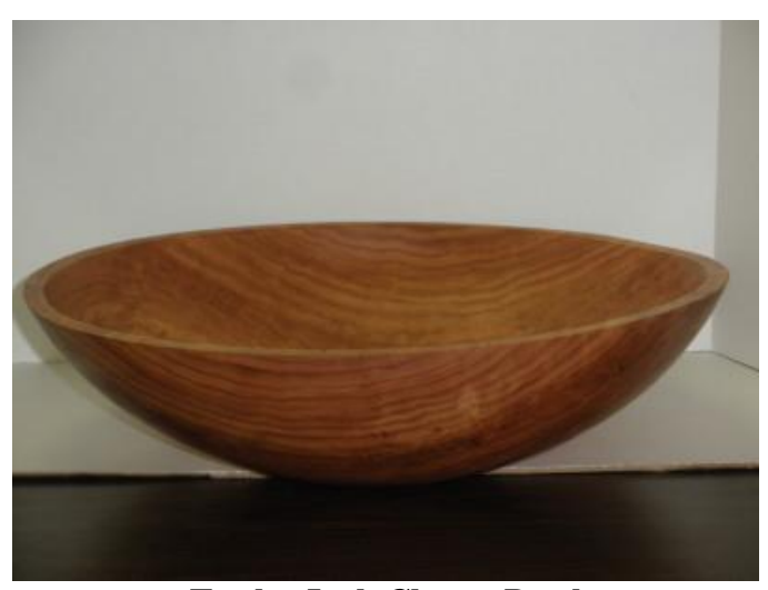
Twelve Inch Cherry Bowl