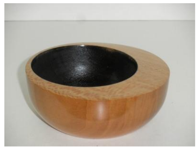
Eccentric Turned Sycamore W/Black Dye