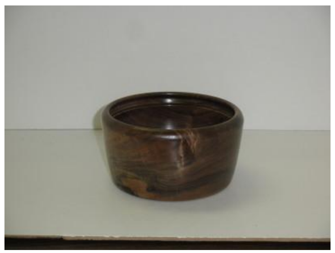
Eight Inch Zebrawood Bowl