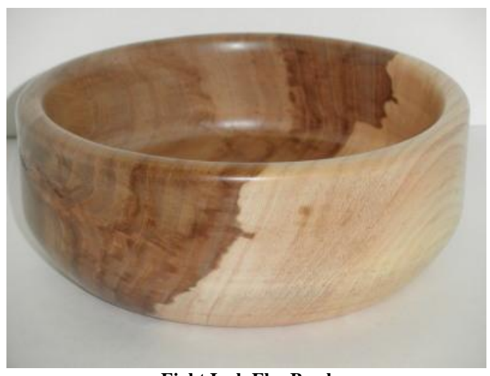
Eight Inch Elm Bowl