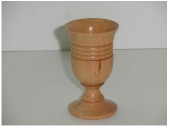
Cherry Toothpick Holder