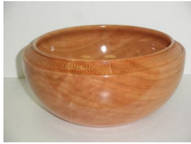
Twelve Inch Cherry Salad Bowl W/ Carving