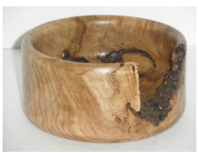
Six Inch Oak Burl Bowl