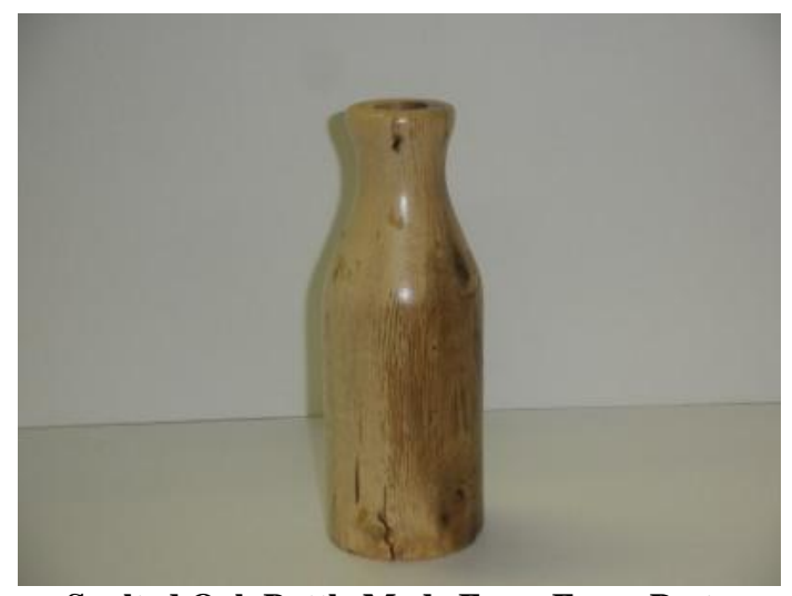
Spalted Oak Bottle Made From Fence Post