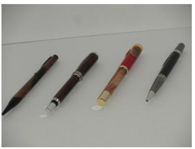
Mesquite, Cocabolo, Mystery Wood, & Carbon