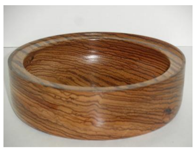
Six Inch Walnut Bowl