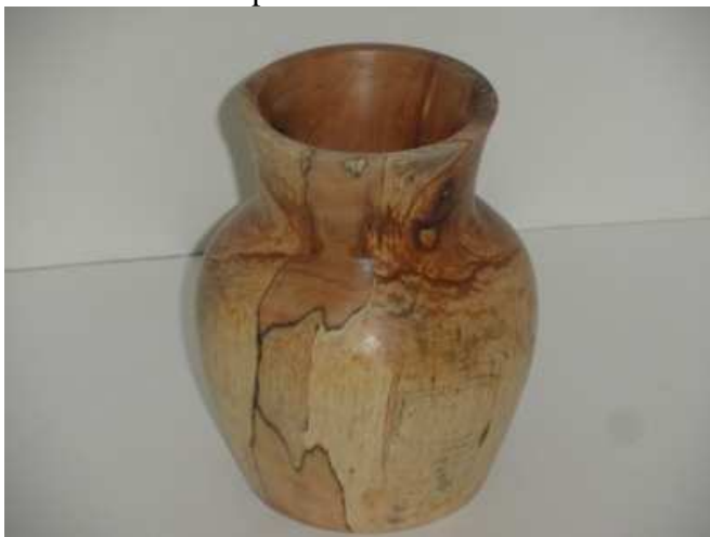
Spalted Peach Vase