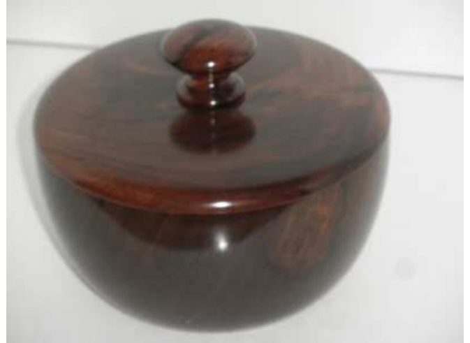
Lidded Walnut Box