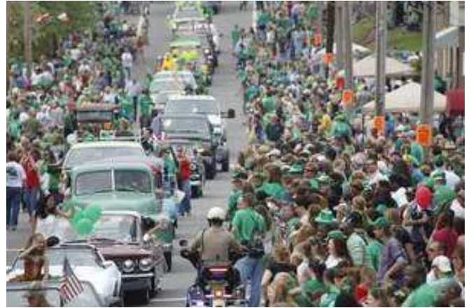
News releases stated there were over 25,000 people at the Erin Irish Festival, Saturday March 17 th .