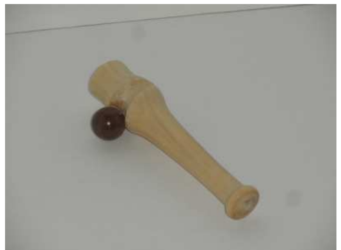
Ball & Bat