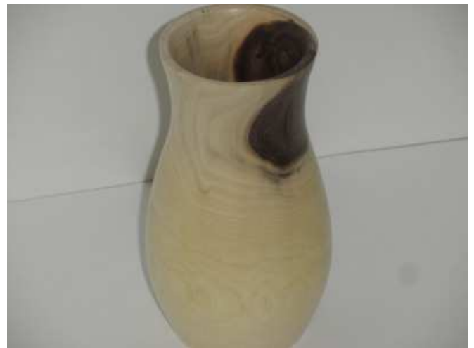
Walnut Sapwood Vase