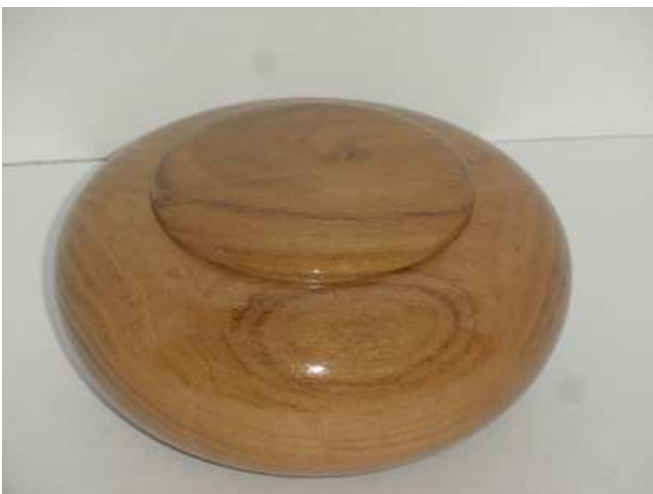
Honey Locust Lidded Box