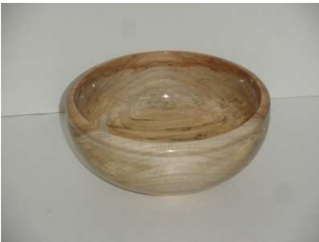
Spalted Maple Bowl