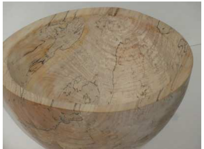
Ten Inch Spalted Maple Bowl