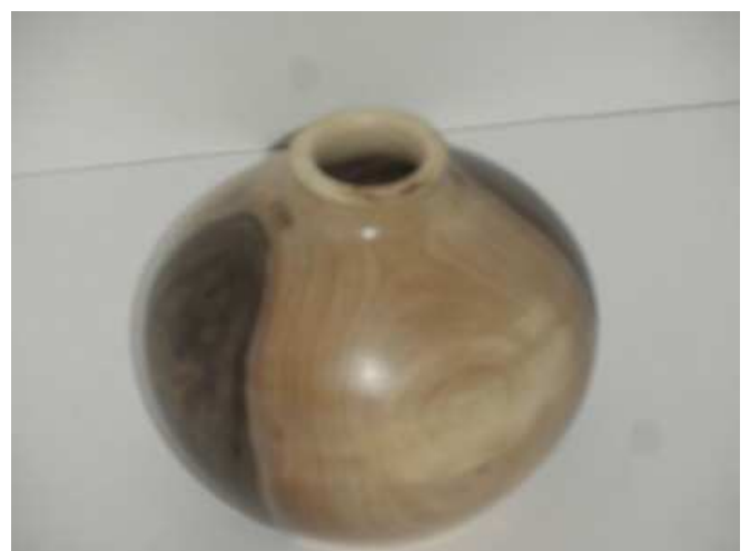
Walnut Hollow Form