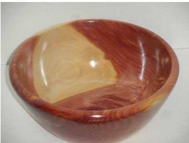
Eleven Inch Cedar Bowl