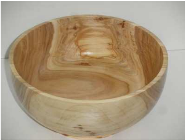
Silver Leaf Poplar