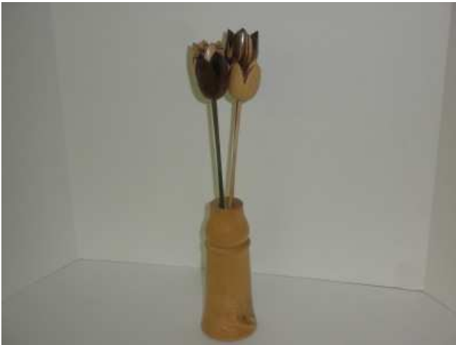
Tulips and Vase