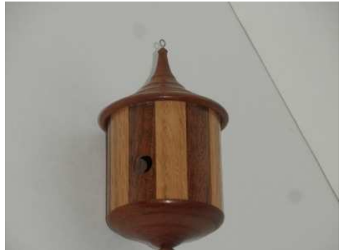
Segmented Bird House