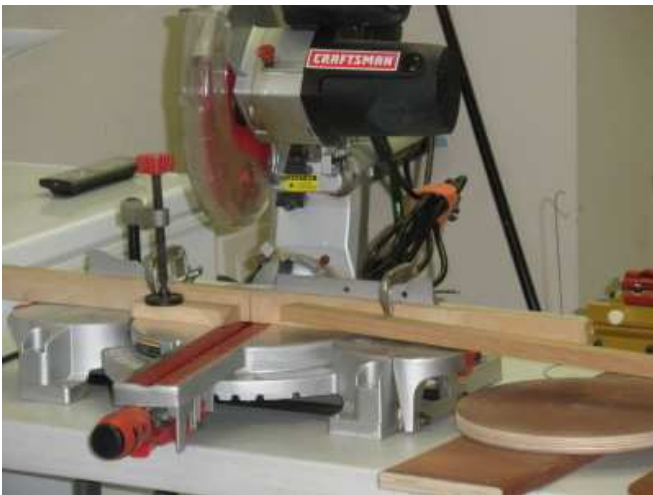
Kevin uses a table saw with the Inca miter gauge to cut his segments and a miter saw set up with a wood stop block to cut segments the same size.