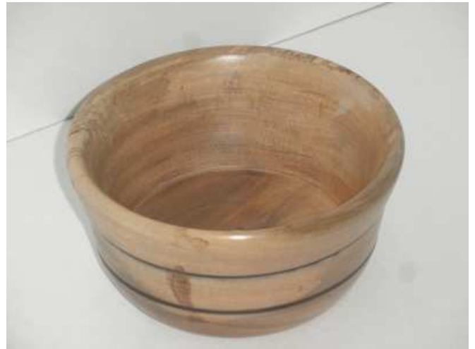
Bowl Made of Coffee Wood