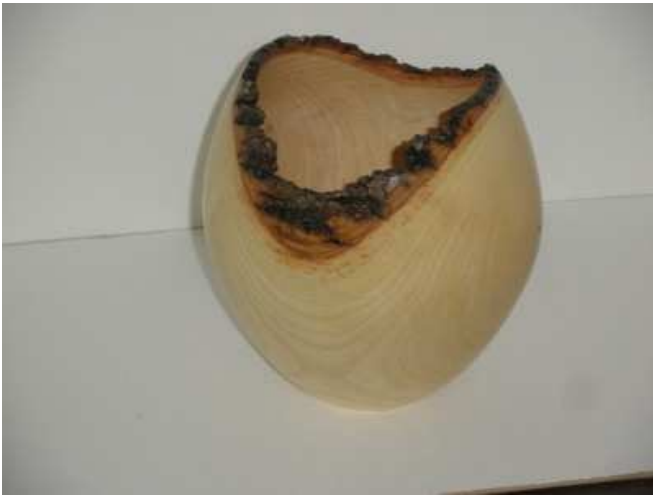
Natural Edge Ash Vase