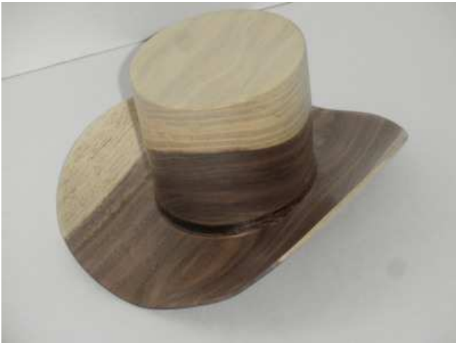
Walnut Top Hat