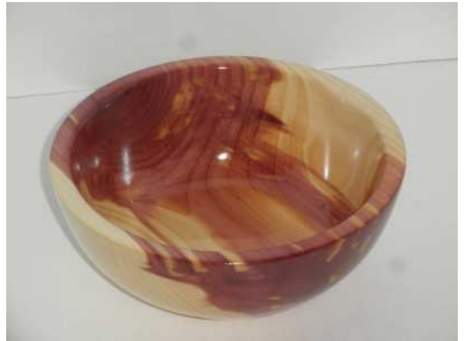
Five Inch Cedar Bowl