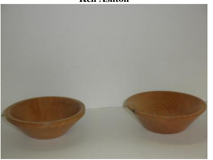
Four inch Charry Bowls