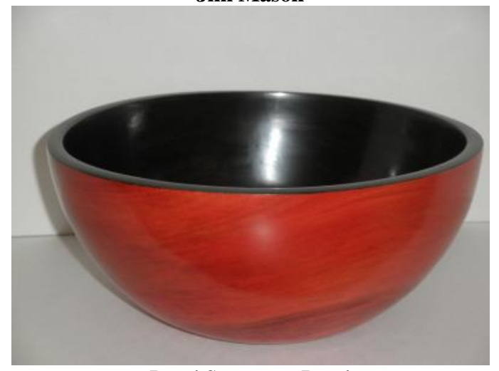
Dyed Sycamore Bowl