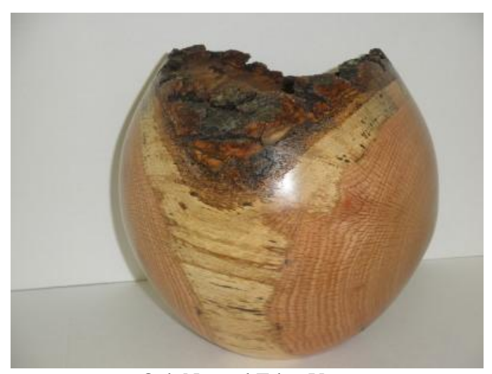
Oak Natural Edge Vase

Please bring something to show at next meeting. Don't be ashamed to show some of your first work...it is as good as the beginning works of some or our better turners. We all share the same trouble and frustrations. It is a tough learning curve, but you will master turning and will begin to really enjoy turning. Whatever you bring, be proud of it.