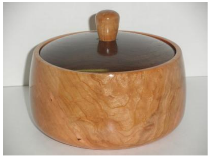
Cherry and Walnut Lidded Bowl