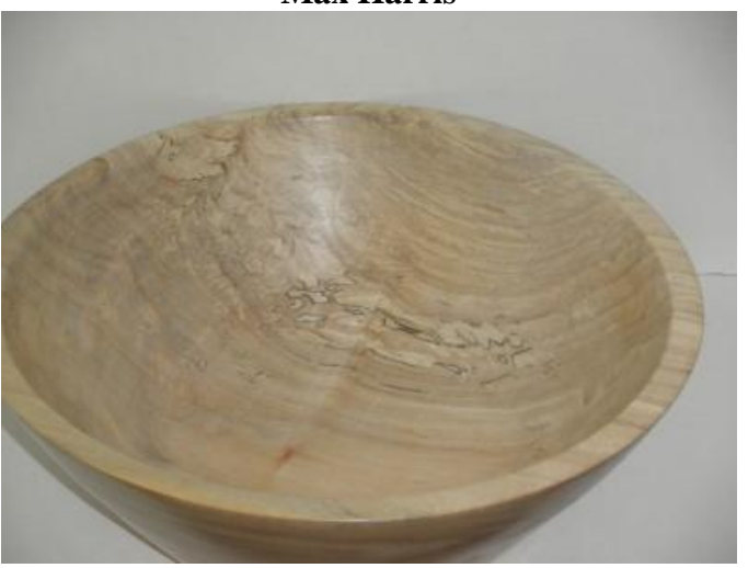
Fifteen inch Maple Bowl