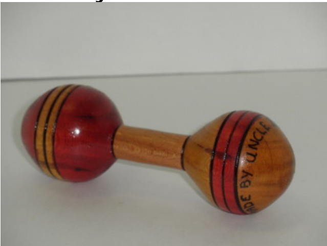
Cherry Baby Rattle