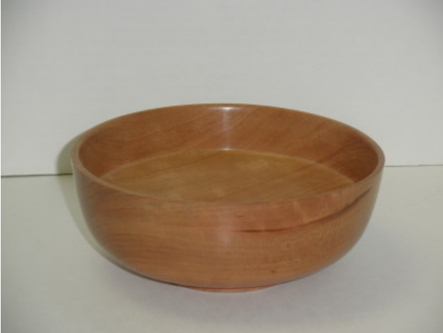
Small Cherry Salad Bowl