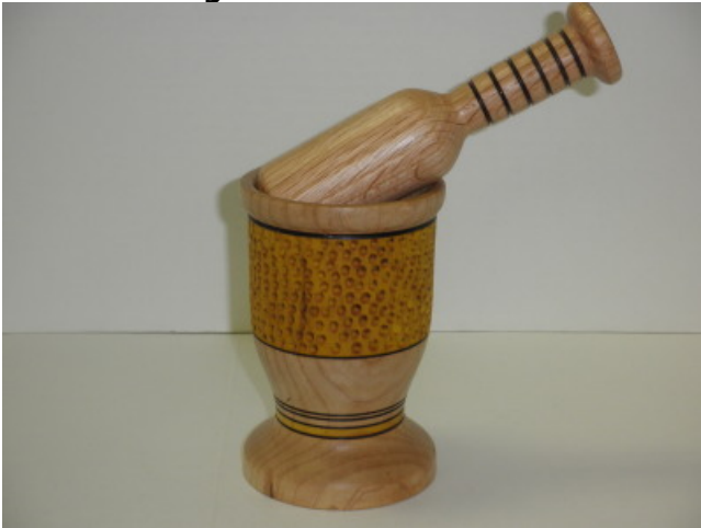
Mortar and Pestle