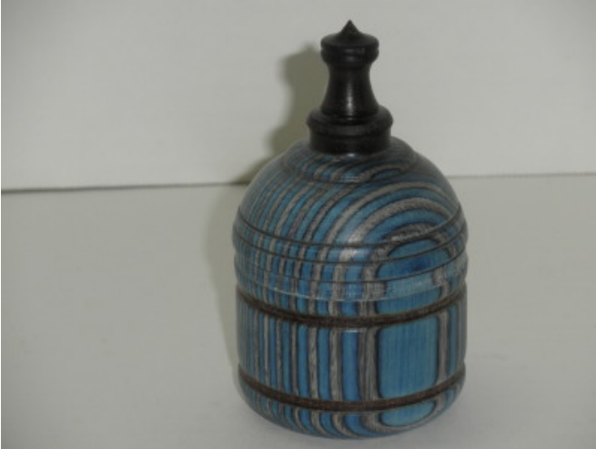
Colorwood Lidded Box