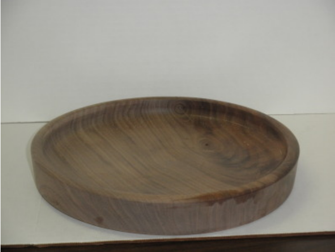
Unfinished Walnut Bowl