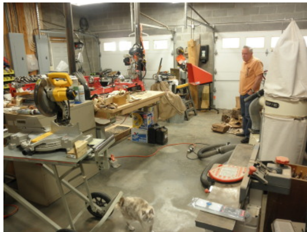
Lots of serious woodworking tools in his huge shop with a 10 or 12 ft ceiling.