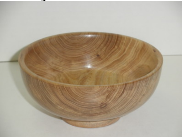
Small Elm Salad Bowl