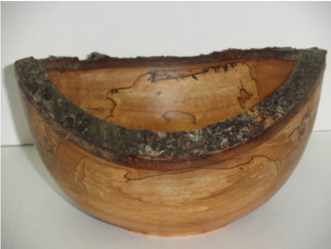
Natural Edge Cherry