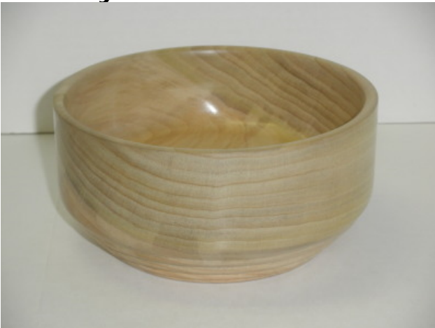
Small Poplar Salad Bowl