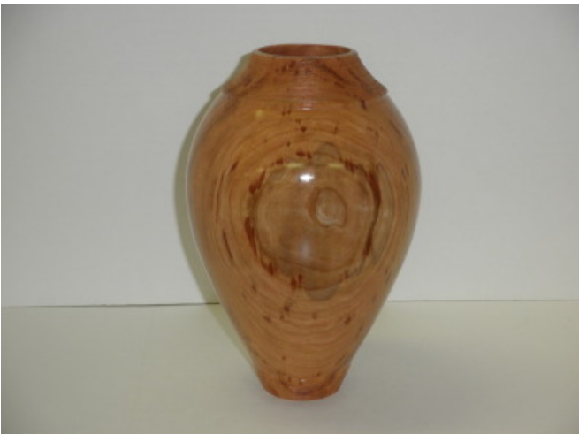
Cherry Case Partially Textured