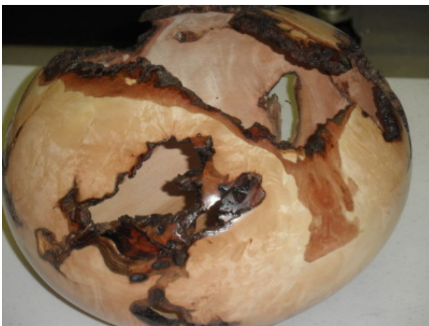
A recently turned thin walled ornamental piece that Jimmy brought to show. As you can see, there are lots of voids, which makes this piece so incredibly beautiful and difficult to turn.