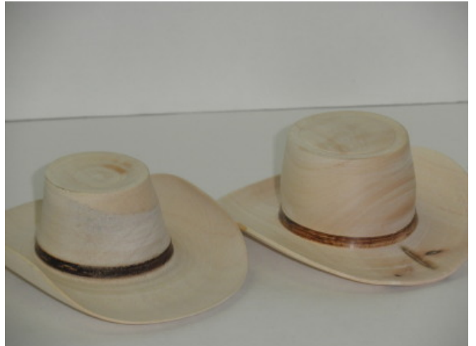
Two Miniature Maple Hats