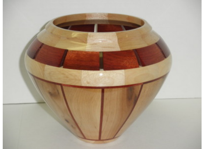
Segmented bloodwood/maple Bowl