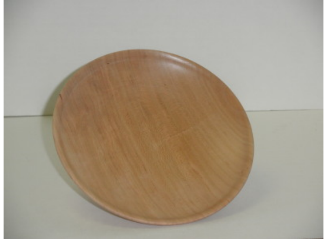
Cherry Shallow Bowl