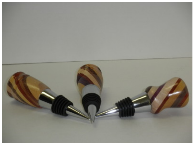
3 bottle stoppers