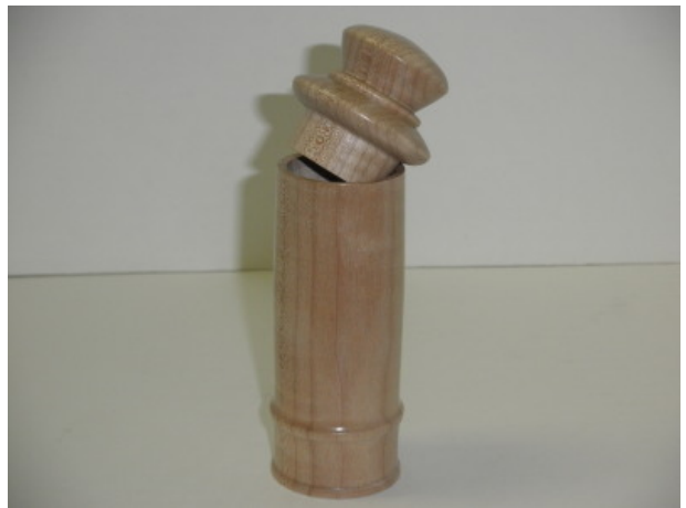
Maple lidded box