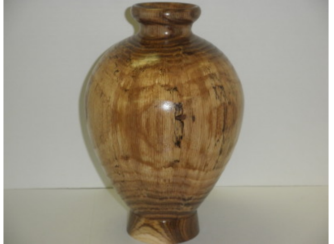
Pin Oak Vase