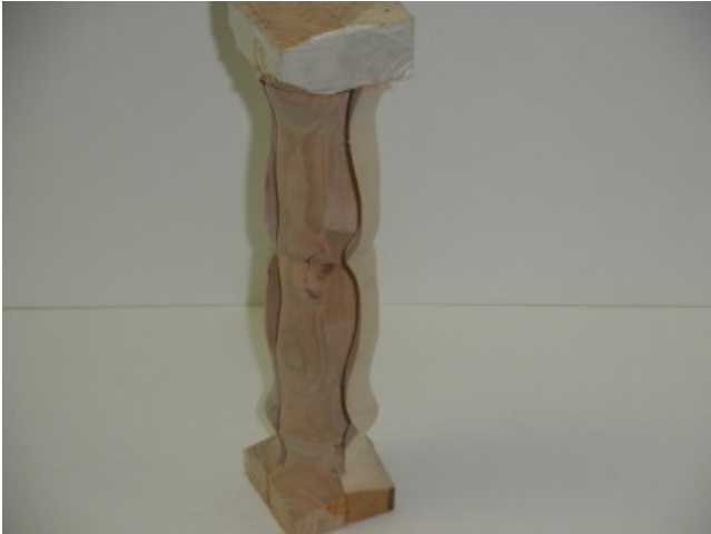
Incomplete inside out turning that max used to demonstrate how it is done.