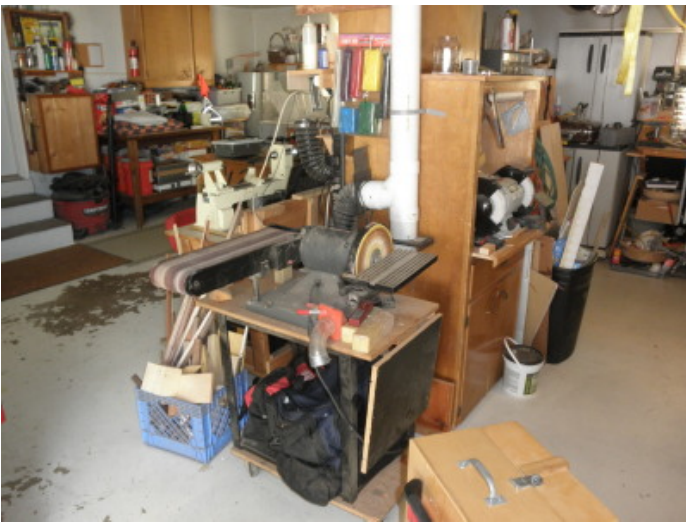
Jon's two-car garage is full of woodworking tools of all kinds. The shop is well organized, clean, and uncluttered. He does much more than turn wood. He is also a master craftsman.