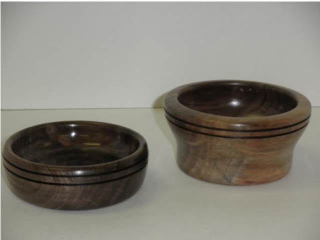
Three inch Walnut Bowls