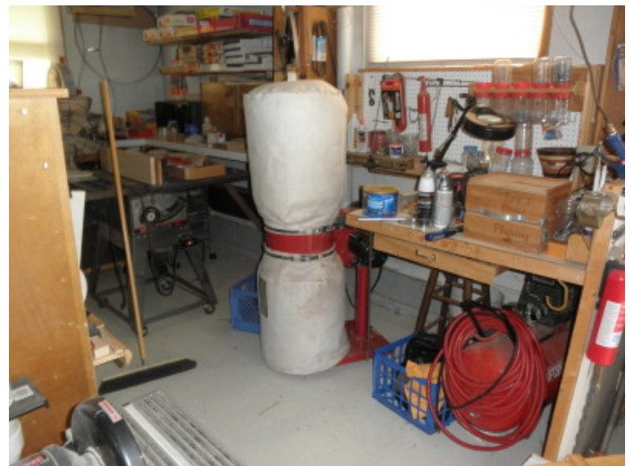
A good dust collection system shown here. His system is piped to most of his tools.