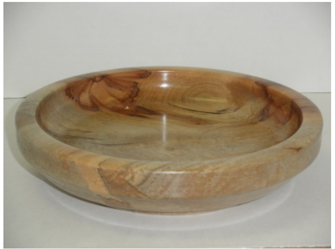
8" spalted sugar maple platter