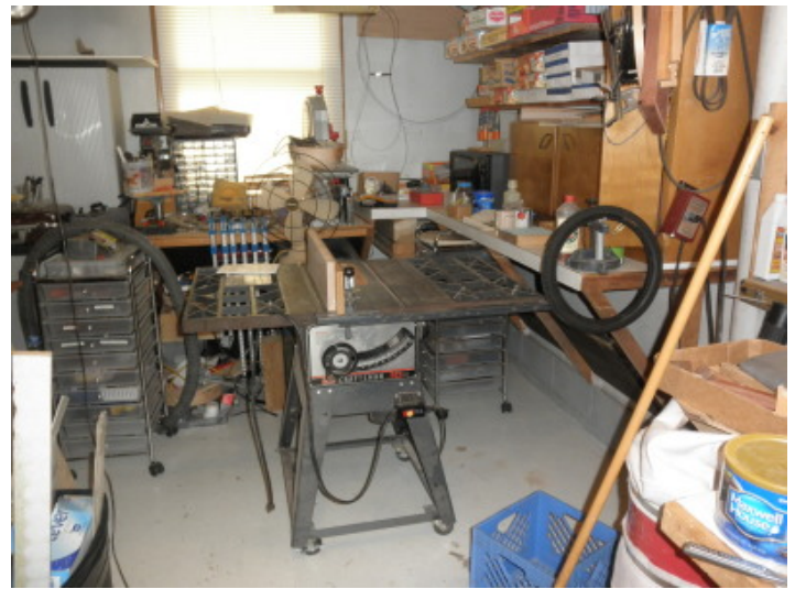
Tablesaw with many jigs and fixtures for delicate cuts.