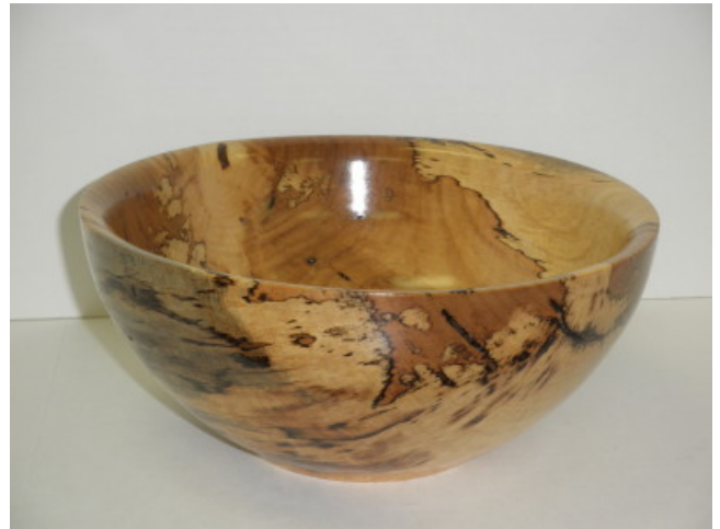
10 inch Spalted Post Oak Salad Bowl