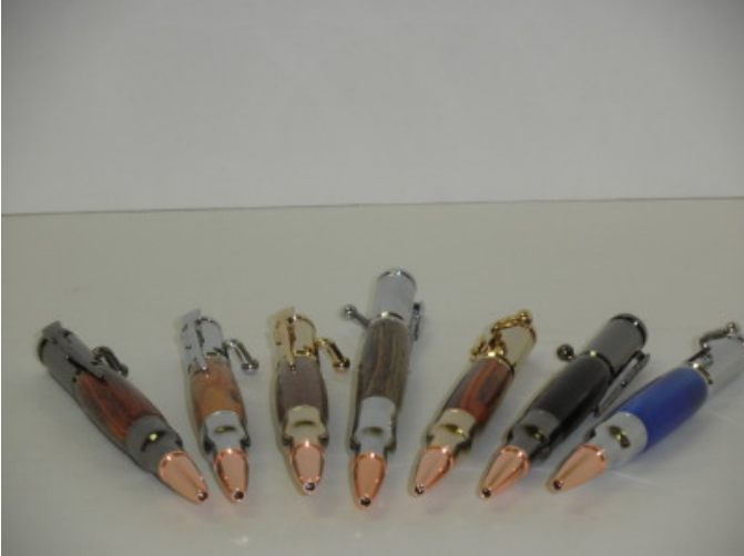
Bullet Pens – 30 Cal mini Bolt Action