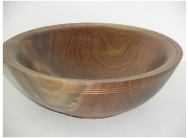
Large Walnut Salad Bowl