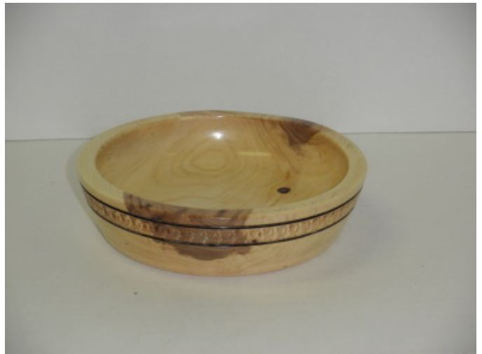
7" Elm Bowl