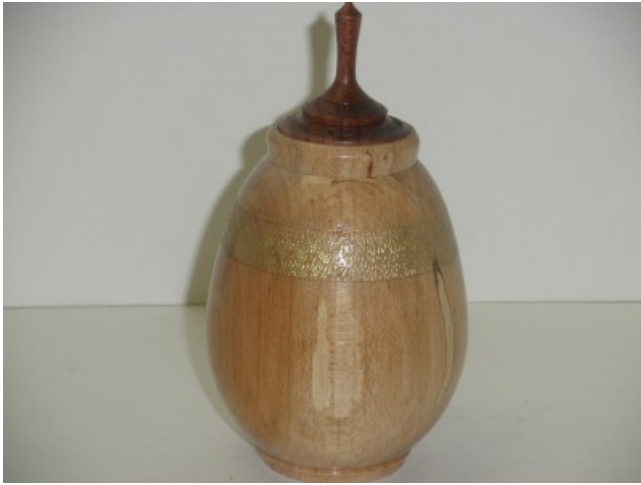
Decorated Finial Vase