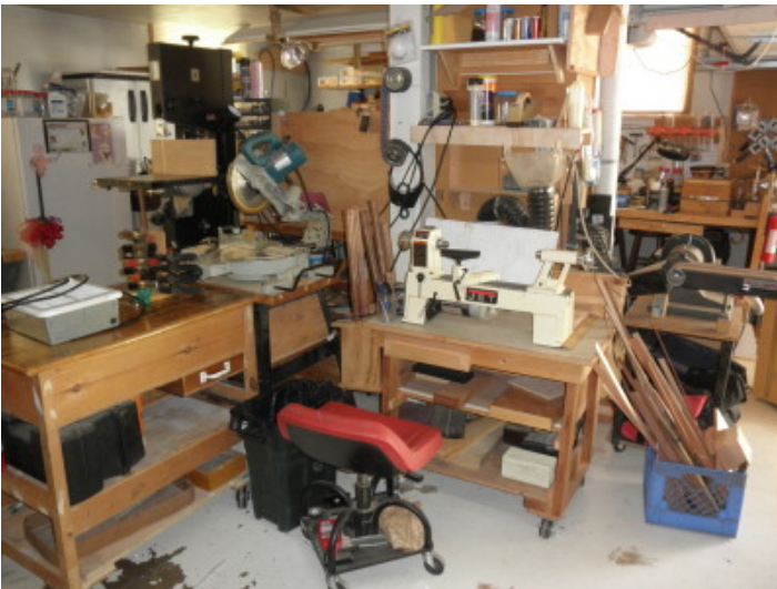
A view of his mitre saw, mini lathe, and sander.