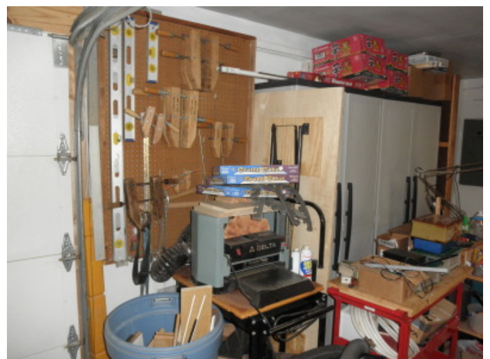
Here is his planer and more storage.