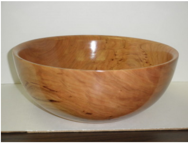
15 inch Cherry Salad Bowl