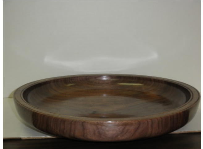
15 inch Walnut crotch Platter