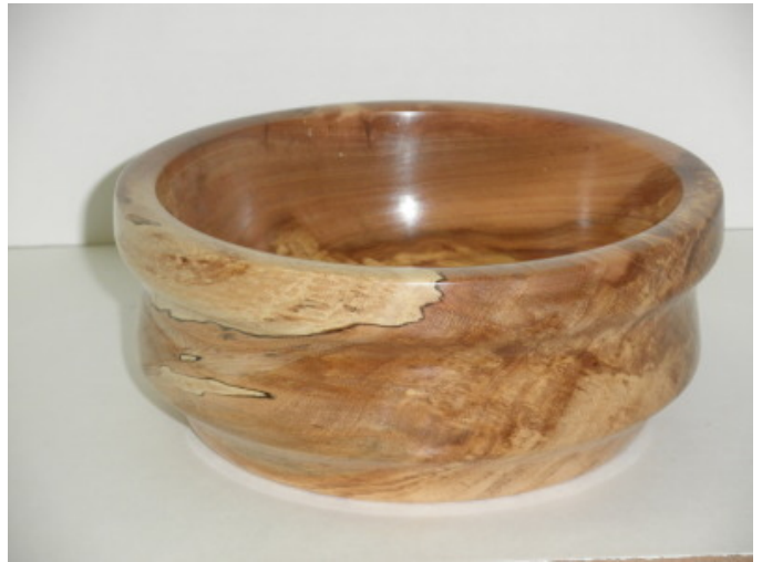
7" spalted maple bowl