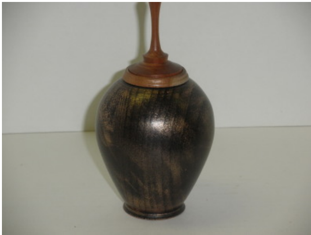
Finial Vase with pigment added