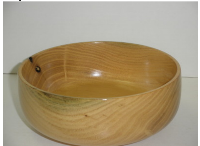
Honey Locust Salad Bowl