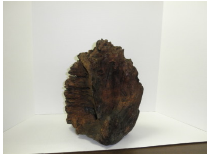
Chunk of Artistic Wood