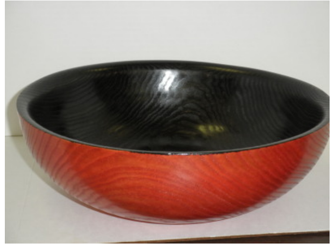
11" Sassafras Salad Bowl...Black and Red Dyes