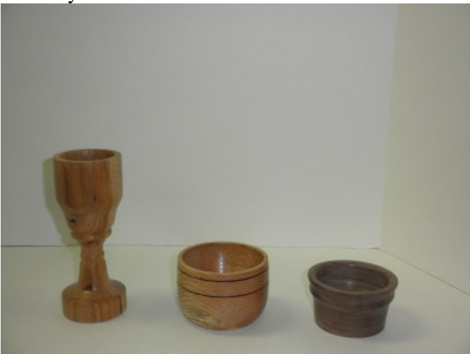
Oak Chalice, Oak Bowl, and Walnut Bowl