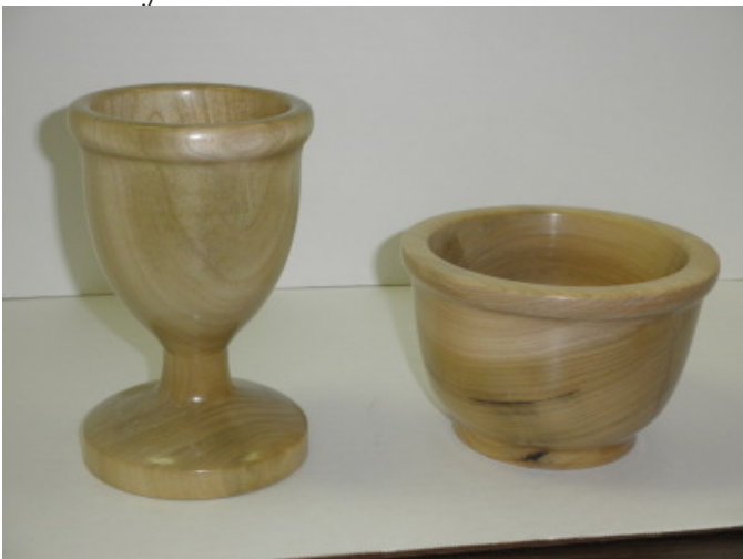
Poplar Goblet and Bowl