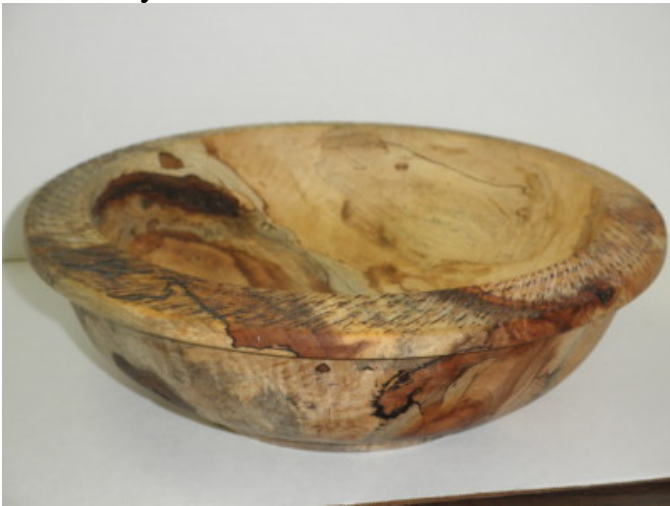
12" Maple Bowl