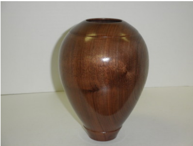
Tall Walnut Vase