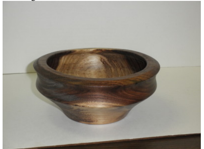
8" Walnut Bowl