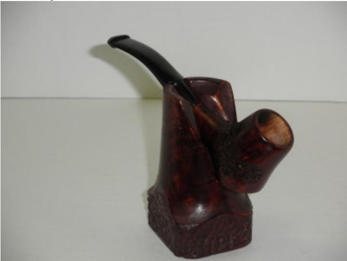
Cherry Pipe with Rest