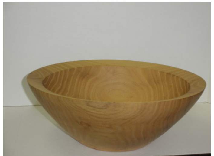
13" Honey Locust Salad Bowl