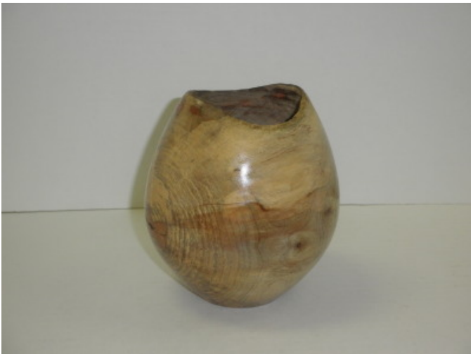
Maple Naural Edge Vase