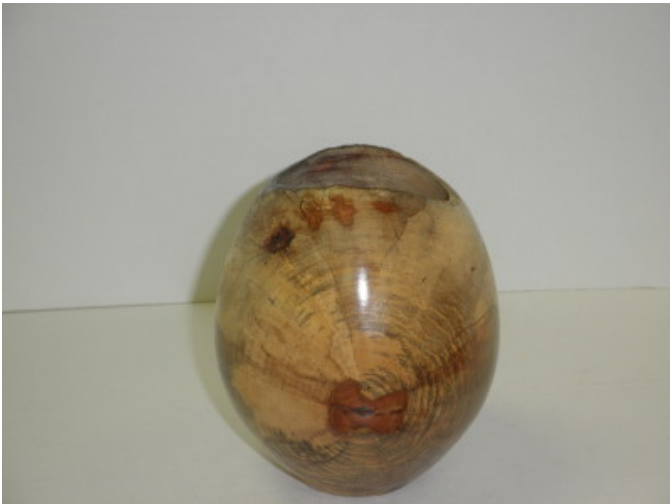
Maple Natural Edge Vase