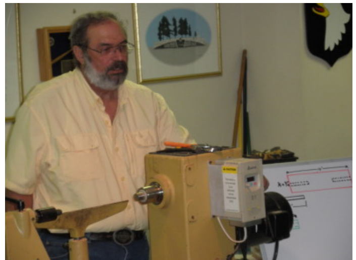
Here, using the chart he explains the process.