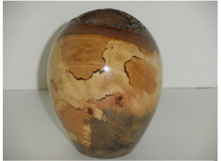
Natural Edge Maple Vase