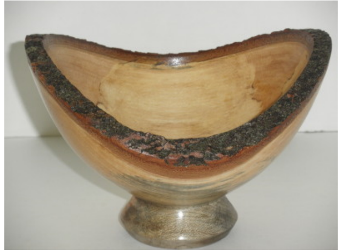
Natural Edge Maple Bowl