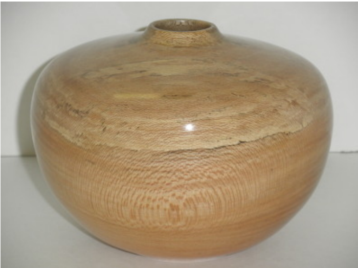
Sycamore Hollow Form