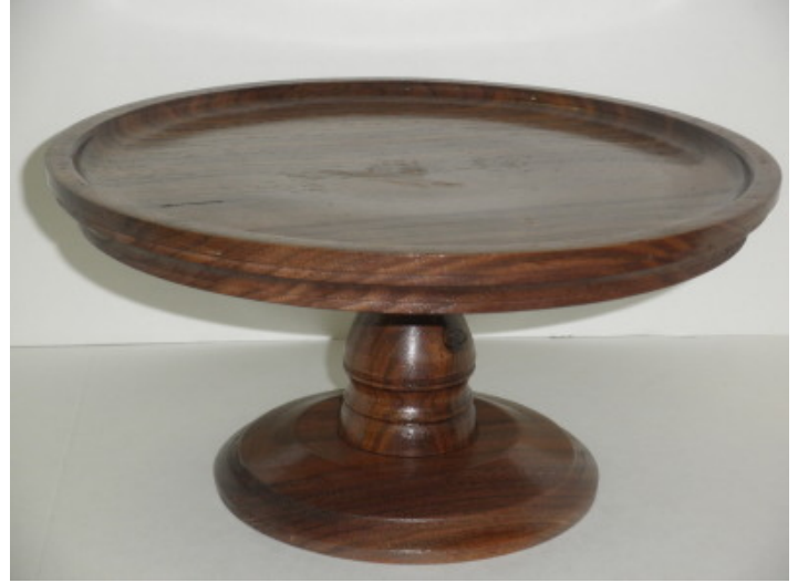
Walnut Cake Stand