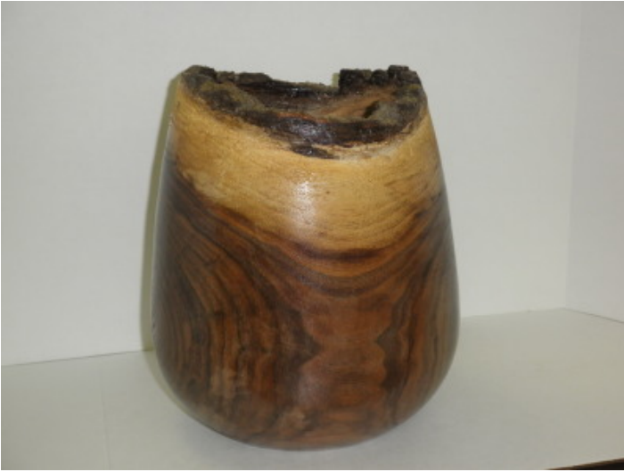
Walnut Natural Edge Vase