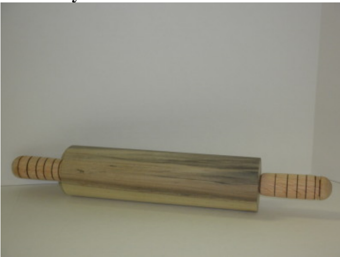
Five Piece Rolling Pin