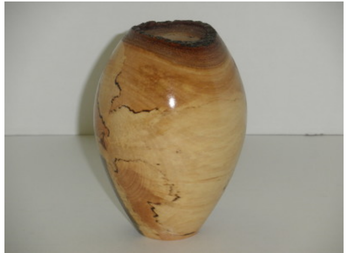
Natural Edge Maple Vase