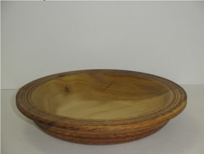
Poplar Bowl with Texturing