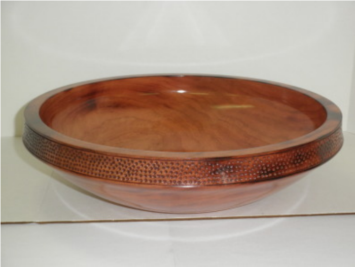
Thirteen Inch Cherry Bowl