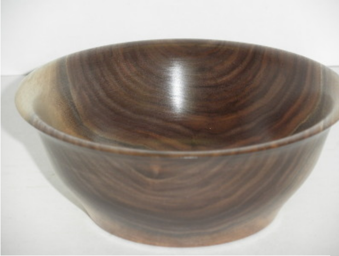
Walnut Salad Bowl