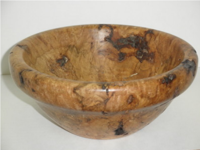
Oak Burl Bowl