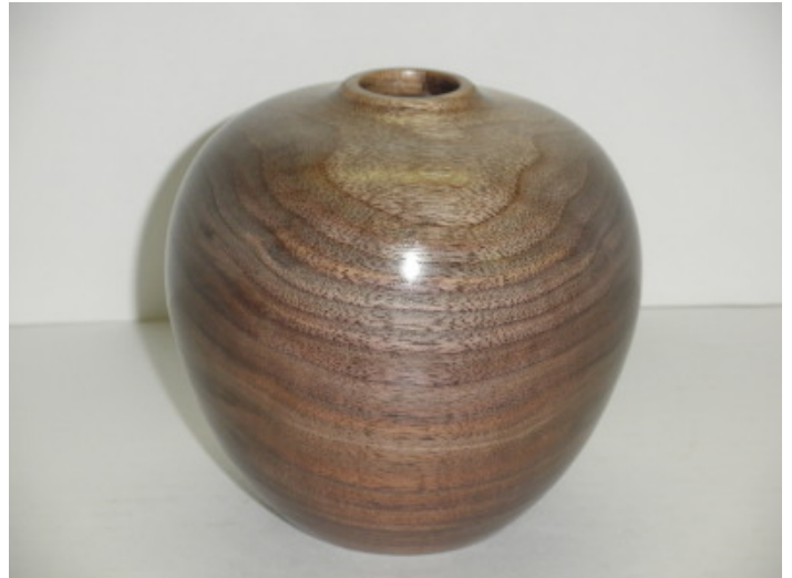
Walnut Hollow Form