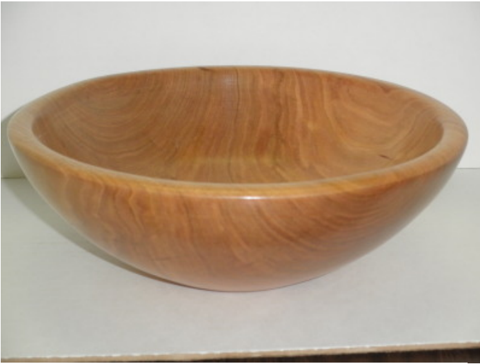
Cherry Salad Bowl – 1 of 3 from 1 Chunk of Wood