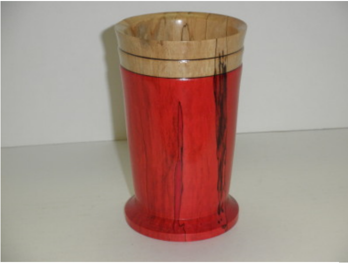
Maple Goblet with Red Dye