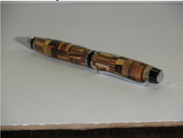
Crazy Quilt Pen