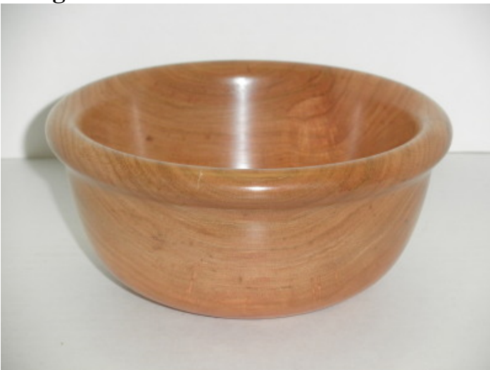
Cherry Salad Bowl