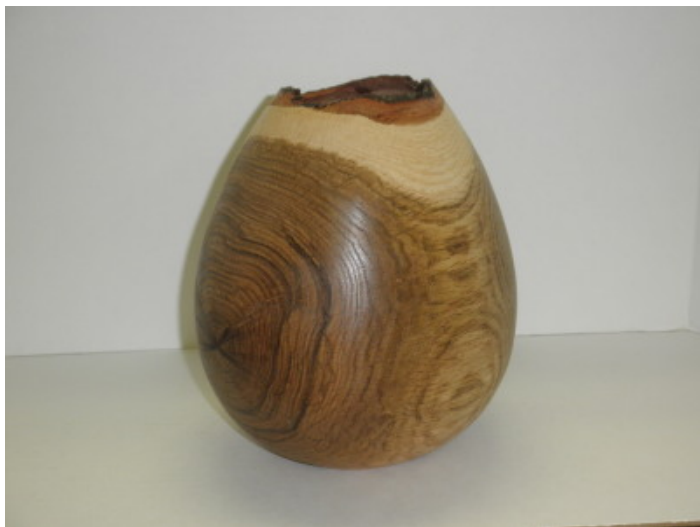
Pin Oak Natural Edge Vase