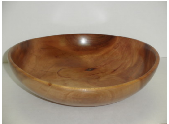
Cherry Salad Bowl