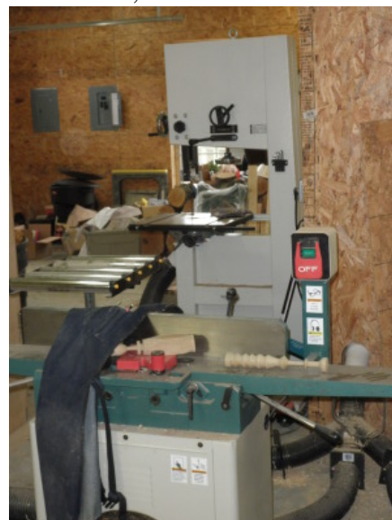
Band Saw and Wood Jointer