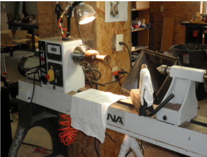
Laguna 18/47 Wood Lathe