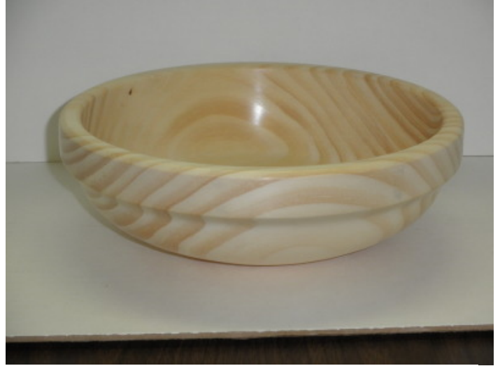
Pine Salad Bowl