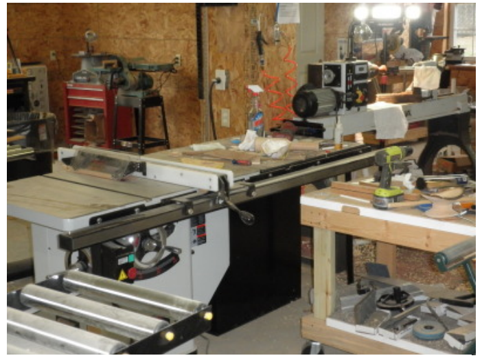
Laguna Table Saw