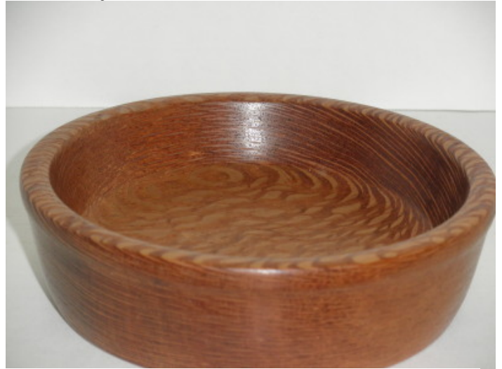
Lacewood Salad Bowl