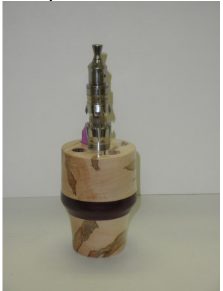
E-cig Cup Holder Ambrosia Maple & Purple Heart