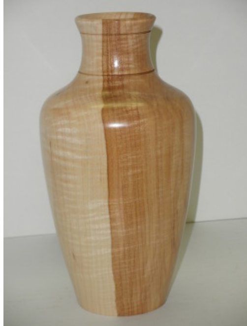
Sugar Maple Vase – One Half Heart Wood