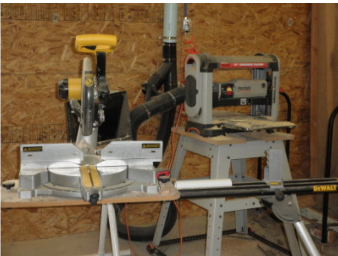
Chop Saw and Planer