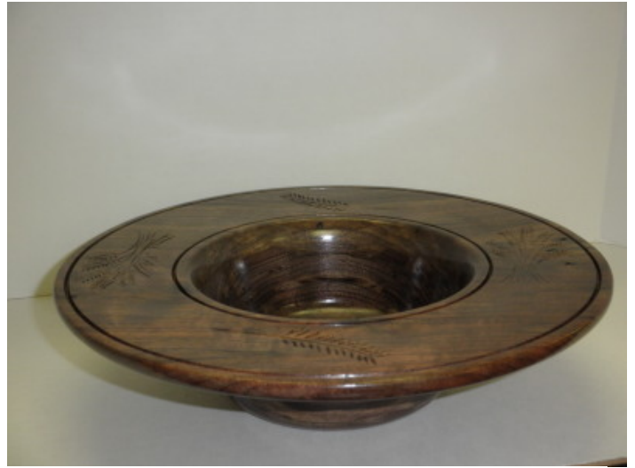
Walnut Bowl with Wheat Stalk Carvings