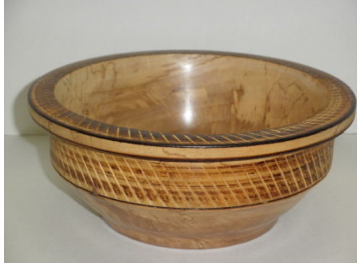
Textured Maple Bowl