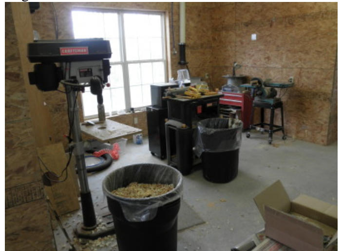
Drill Press, Router Table and Tool Storage Boxes