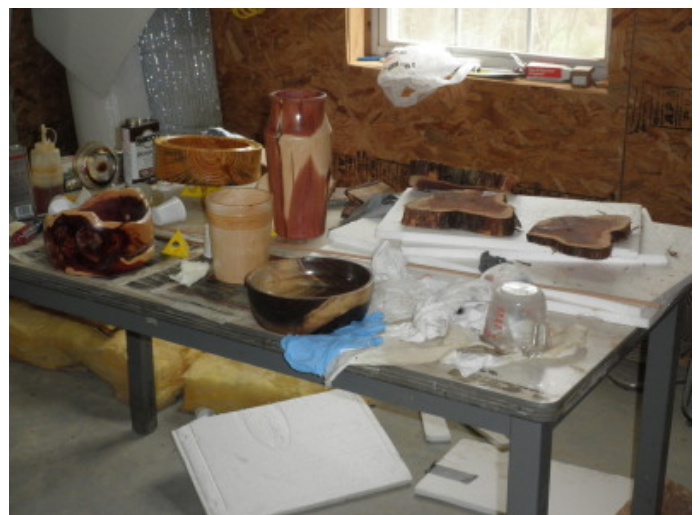
Separate Finishing Room