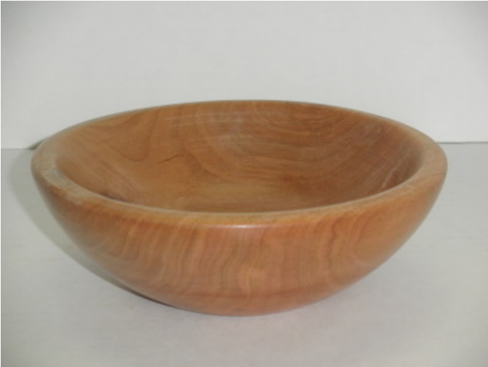
Cherry Salad Bowl - 3 of 3