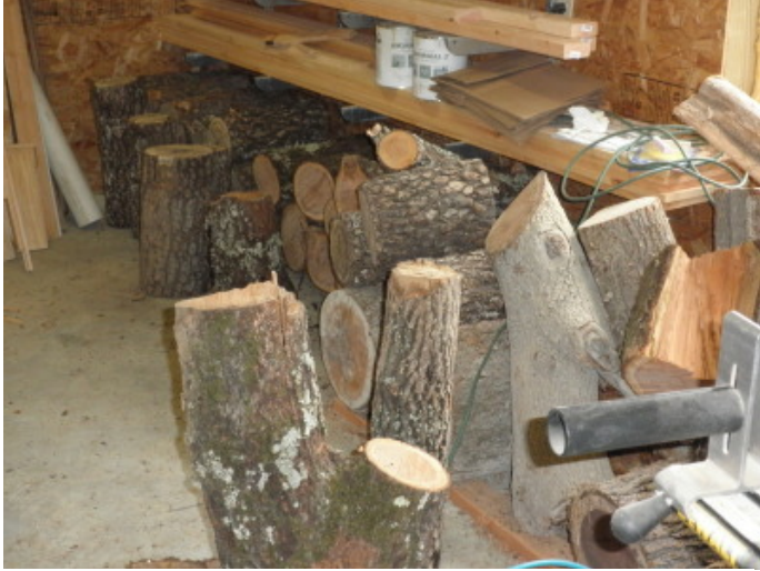
One of four Woodpiles