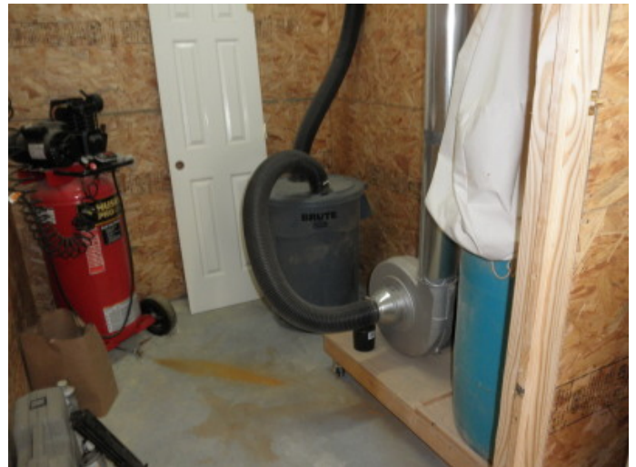
Air Compressor and Dust Collection room