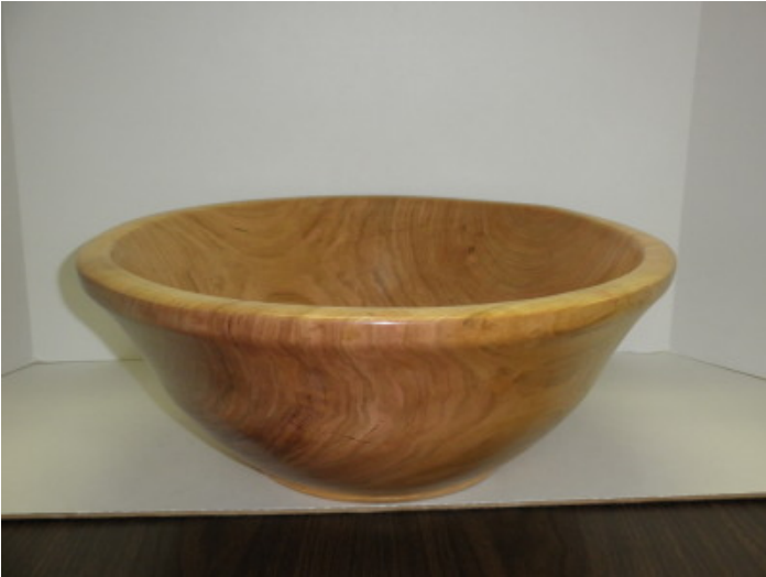
Cherry Salad Bowl - 2 of 3