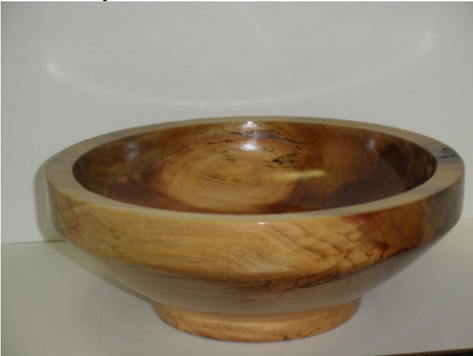
Large Poplar Bowl