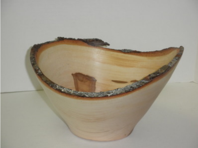
Natural Edge Maple Bowl