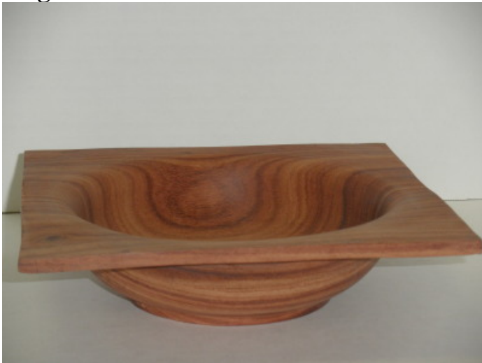
Square Edged Round Bowl