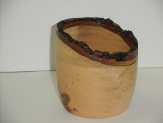
Natural Edge Vessel