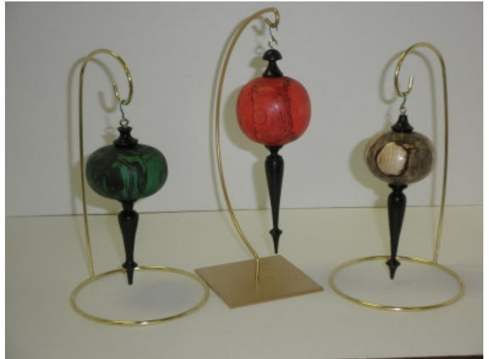
Three ornaments from the same wood (Spalted Beech) Dyed Green on Left, Red, Center, and Natural, Right. All have finials of African Blackwood