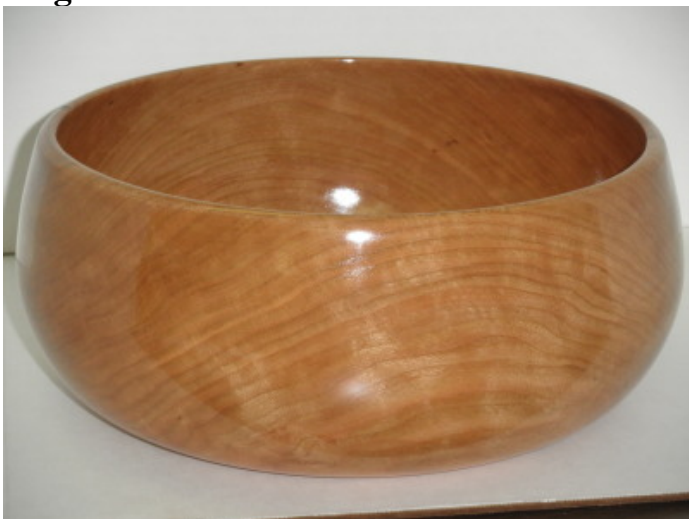
Fifteen Inch Cherry Salad Bowl