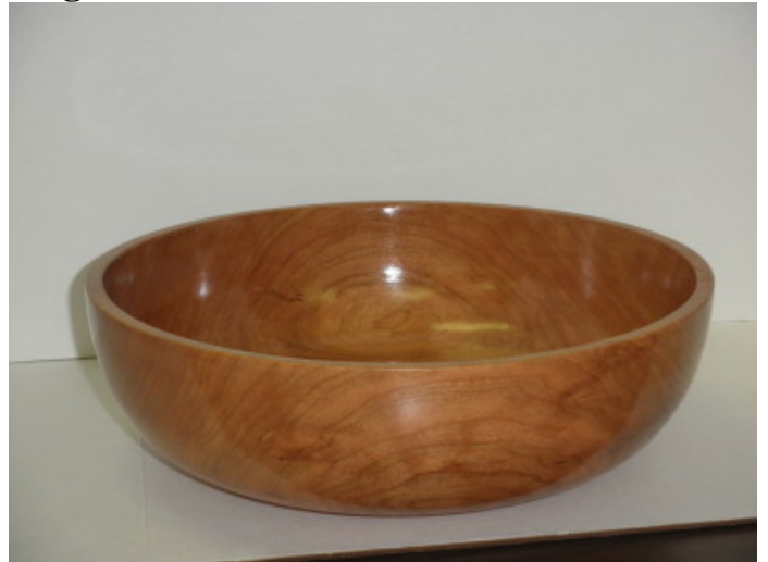
Fifteen Inch Cherry Bowl