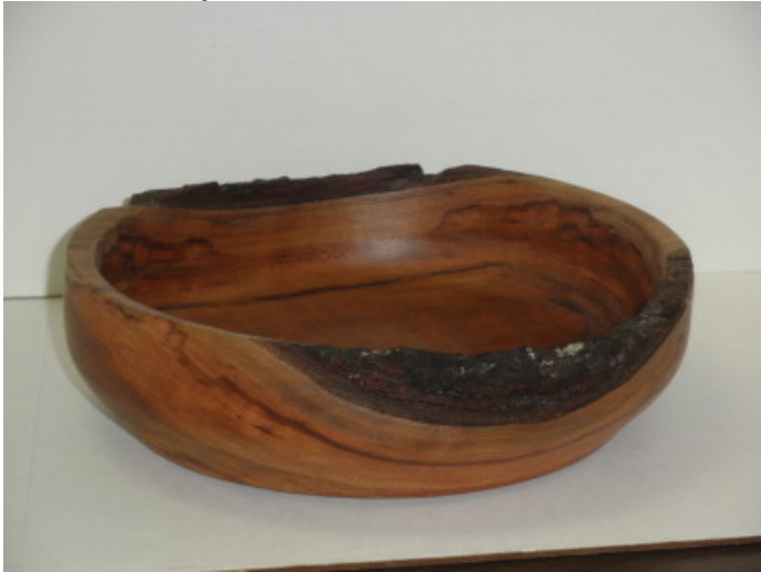
Natural Edge Cherry Bowl