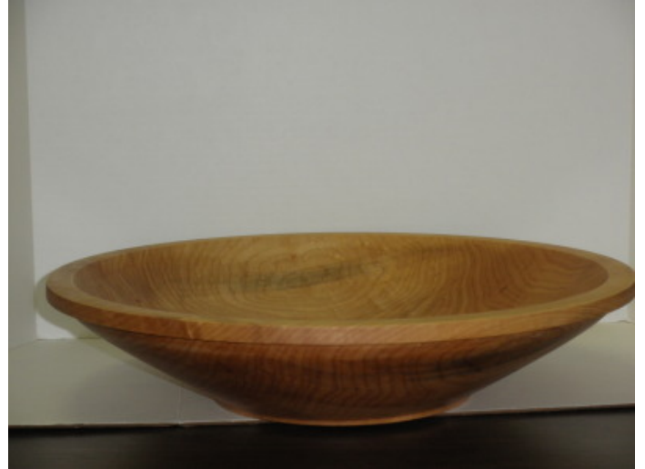
Large Poplar Bowl/Platter