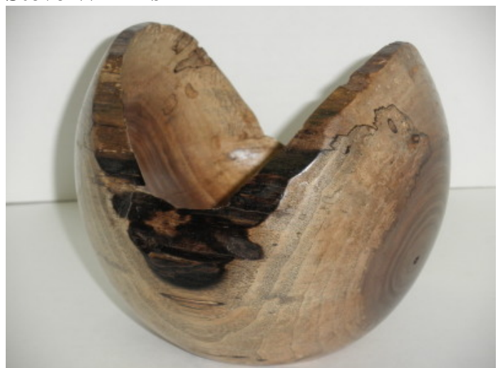
Spalted Walnut Natural Edge Bowl