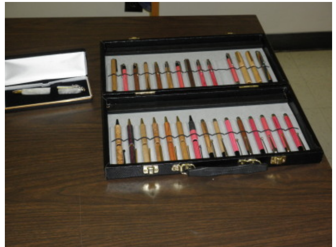
Some of her pens and styluses

Several times she emphasized safety issues, explaining that accidents can and do happen. She insisted we always use a face mask as we rough turn items and especially when turning a bowl.