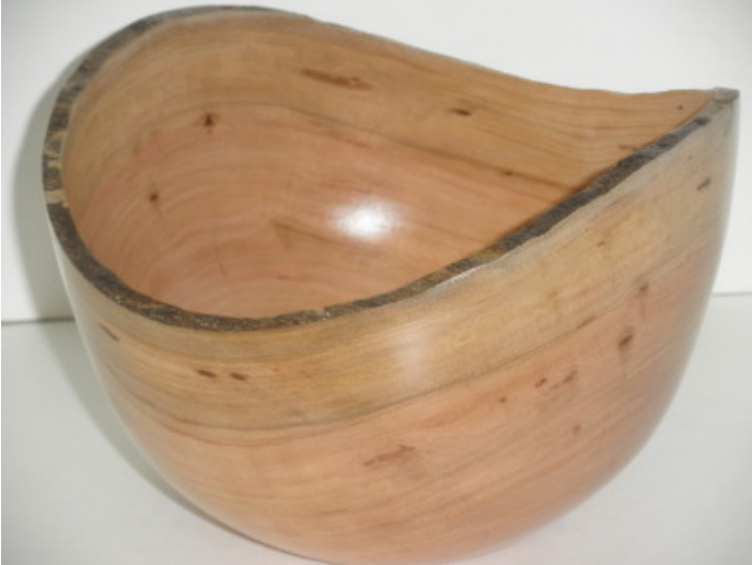
Natural Edge Cherry Bowl