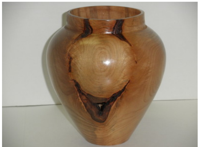
Maple Hollow Vase