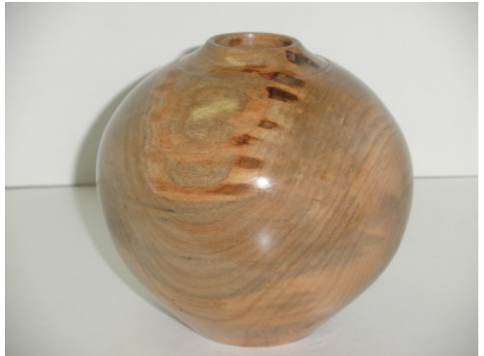
Maple Hollow Vessel