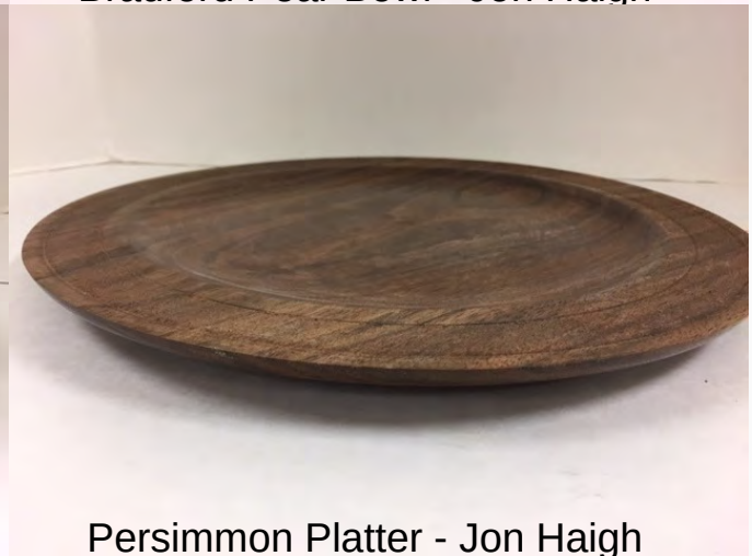
Persimmon Platter - Jon Haigh