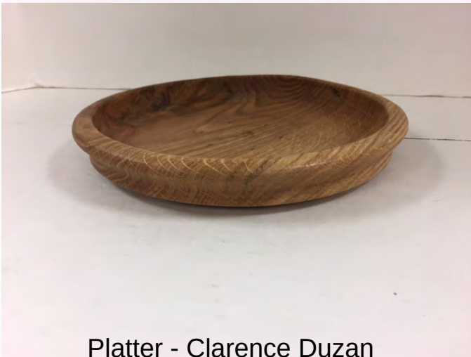
Platter - Clarence Duzan