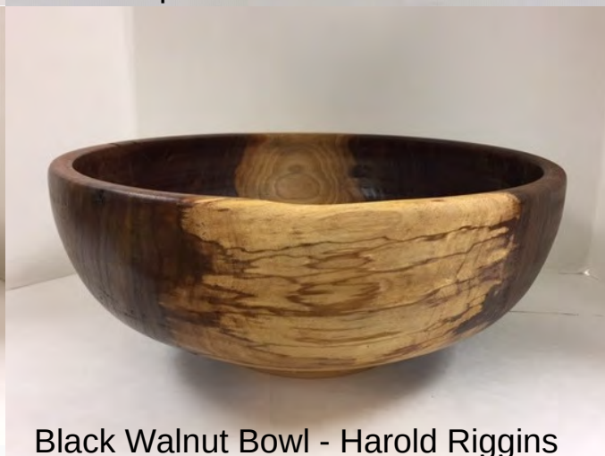
Black Walnut Bowl - Harold Riggins