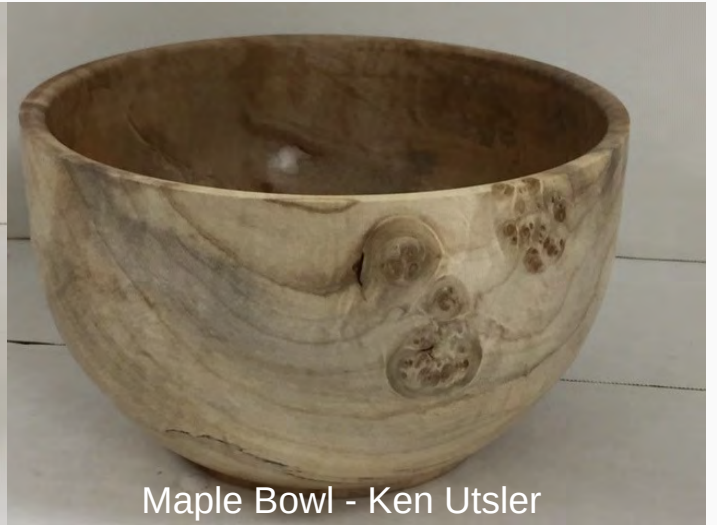
Maple Bowl - Ken Utsler