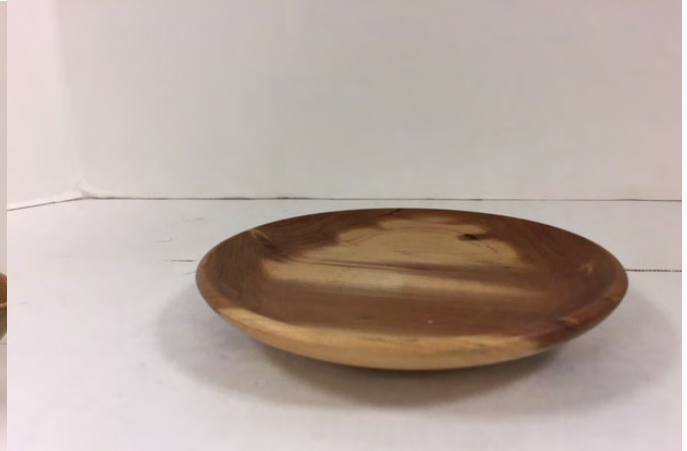
Platter - Clarence Duzan