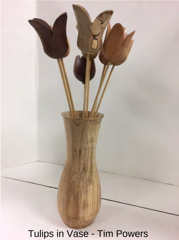
Tulips in Vase - Tim Powers