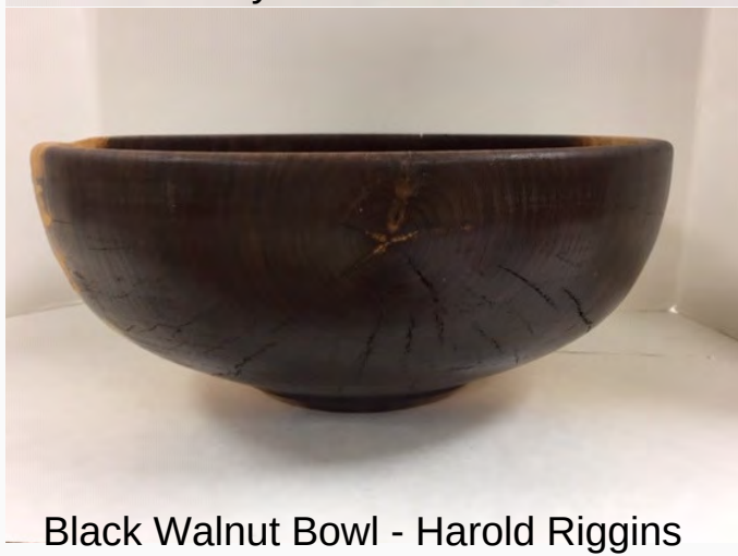
Black Walnut Bowl - Harold Riggins