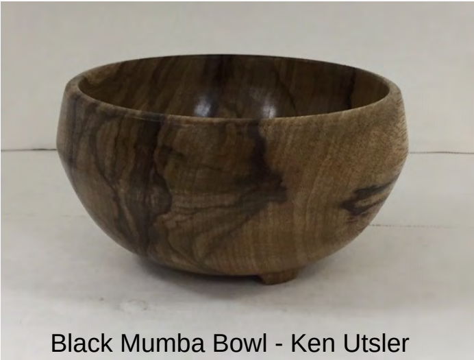
Black Mumba Bowl - Ken Utsler