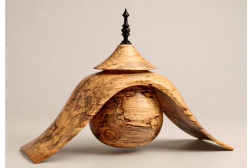
Photo: Samurai box – Jamie Donaldson http://www.fingerlakeswoodturners.com/2016/03/23/finger-lakes-woodturners-host-jamie-donaldson/

September Video - Jimmy Clewes Turns a Square Oriental Box https://www.youtube.com/watch?v=Vmz5BKXBGLA