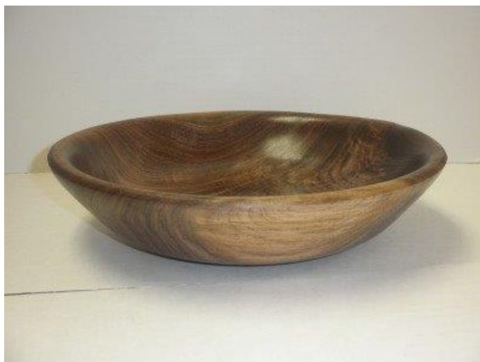
Salad Bowl, Walnut – Gene Doyon