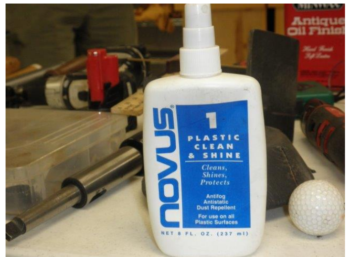
Product Steve Recommended to clean face shield.