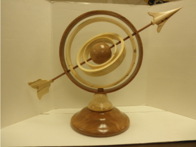
Cherry and Spalted Maple Armillary