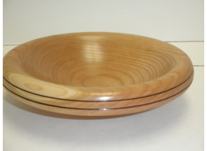
Platter for the Nashville Empty Bowls Project