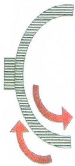
Open Bowl End-Grain