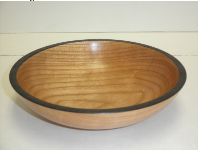
Cherry Bowl for Nashville Empty Bowls Project