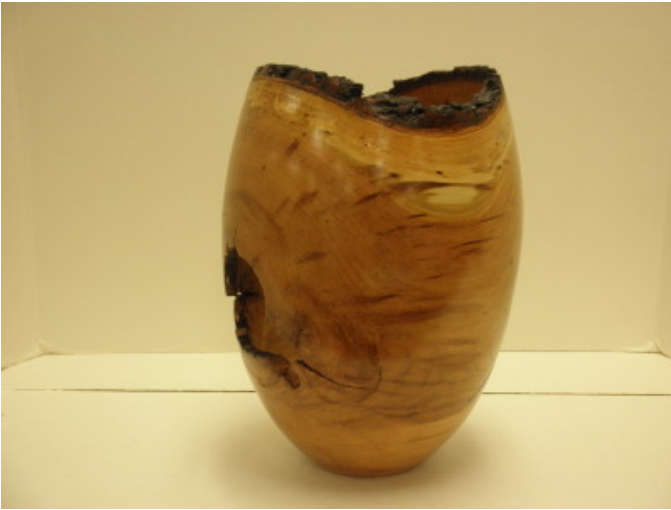
Natural Edge Cherry Vase with Voids