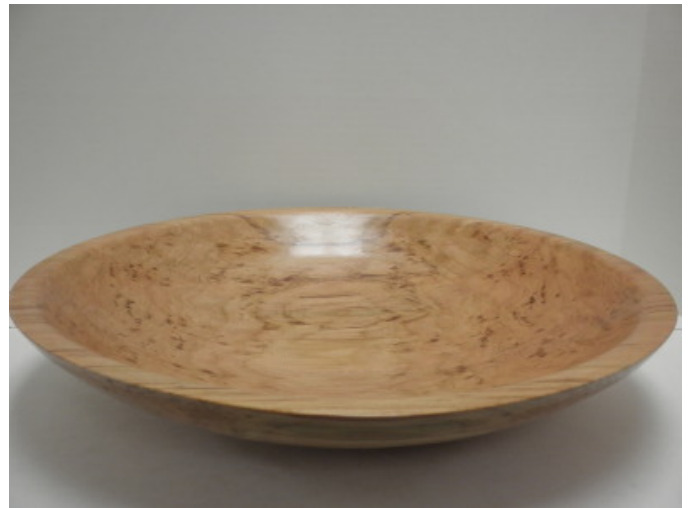
15 Inch Shallow Cherry Salad Bowl