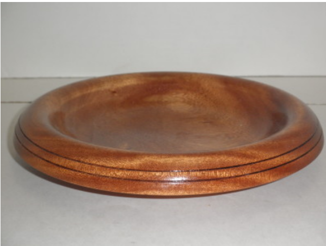
Platter for the Nashville Empty Bowls Project