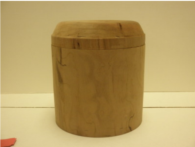
Cherry Bowl fumed with amonia