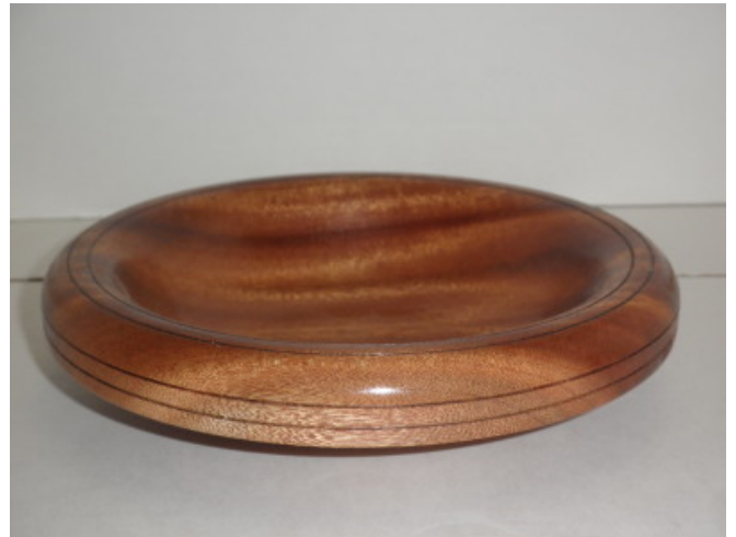
Platter for the Nashville Empty Bowls Project