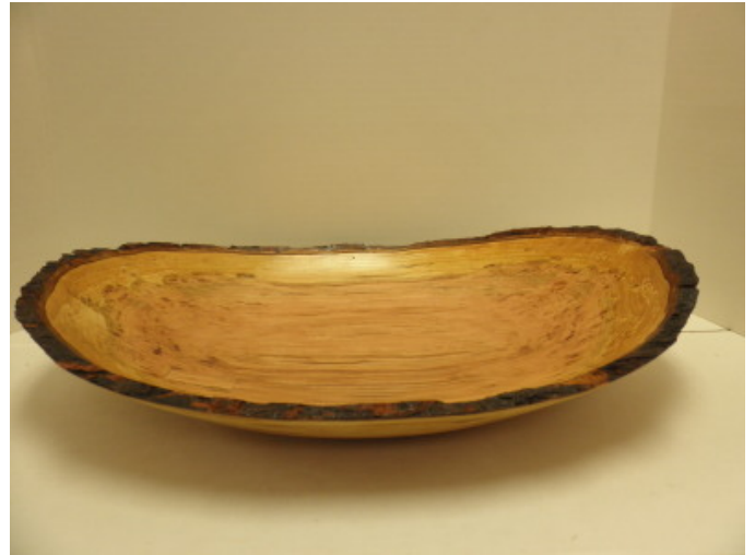
19 Inch Natural Edge Cherry Platter