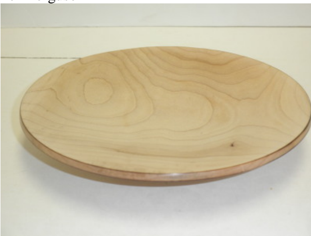
Maple bowl for Nashville Empty Bowls Project