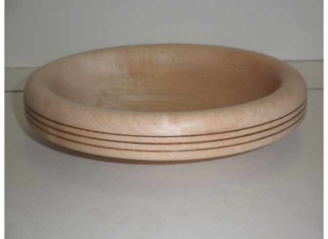
Platter for the Nashville Empty Bowls Project