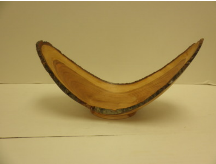
Natural edge cherry