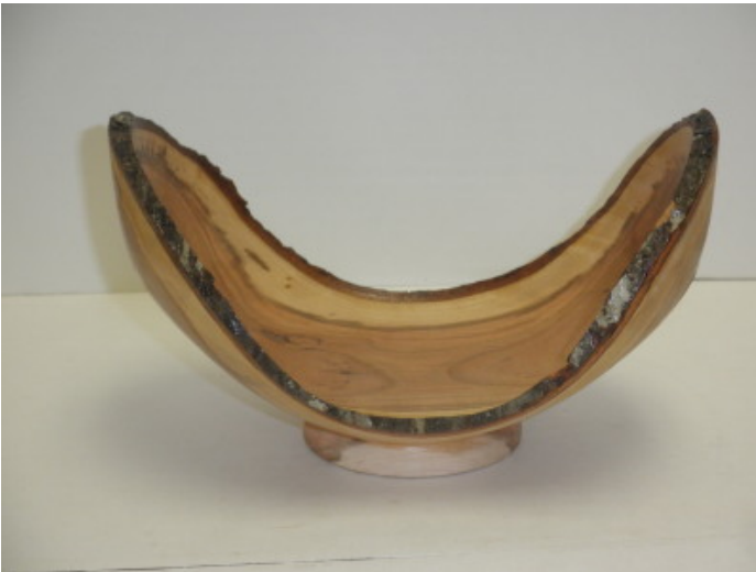
Natural edge cherry