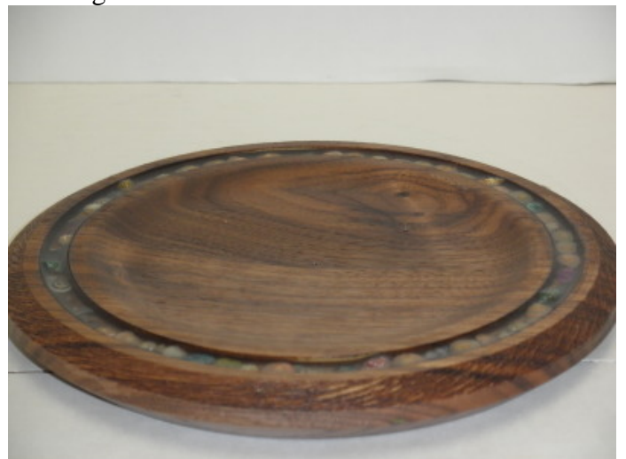
Walnut dish with inlay