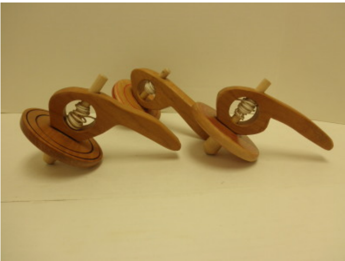
Cherry spin tops donated to the club