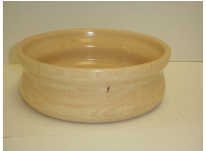
End grain bowl