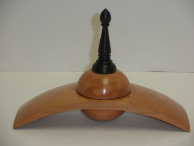
Cherry lidded box with African blackwood finial