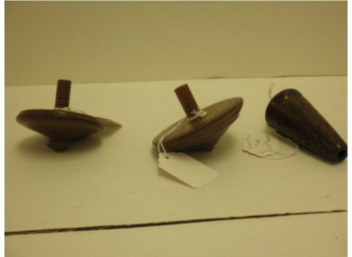
Historic walnut spin tops