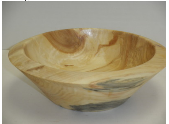
Silverleaf Poplar bowl