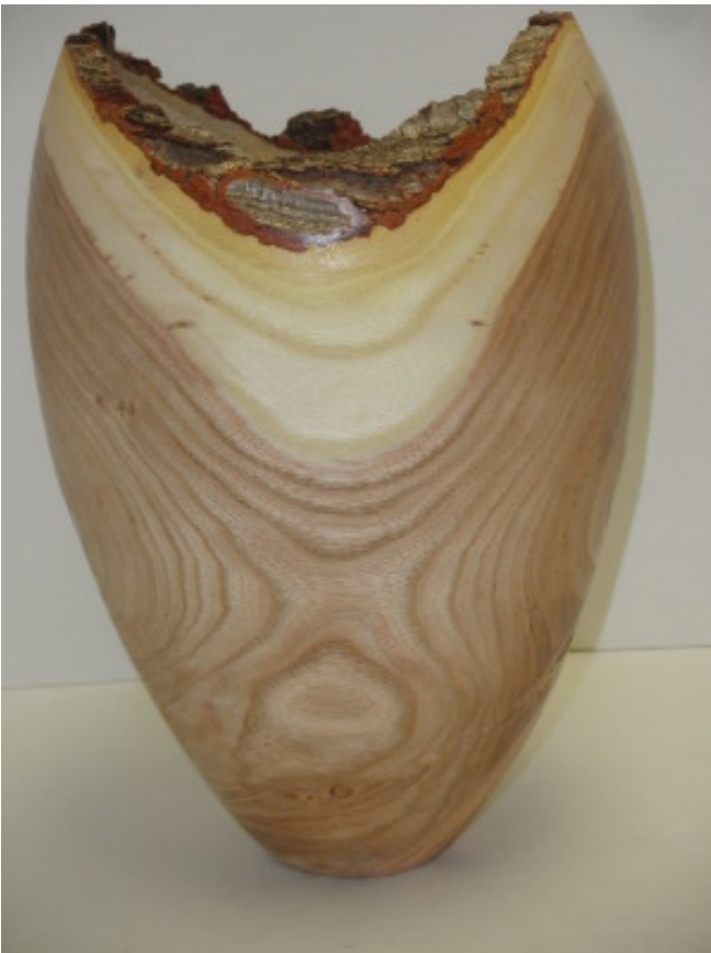
Coffeetree natural edge vase