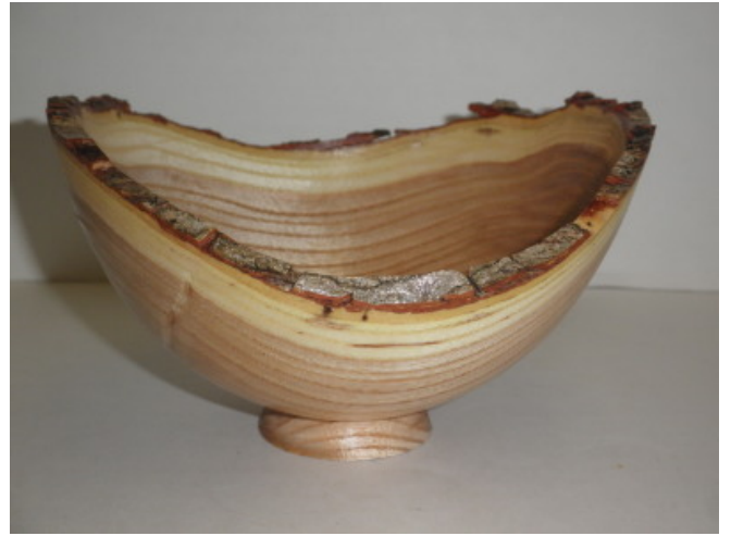
Coffeetree natural edge bowl