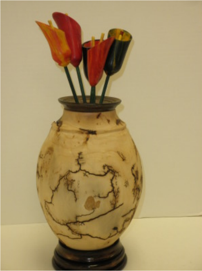
Hollow form with flowers