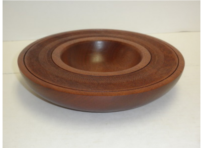
Mahogany Textured Bowl