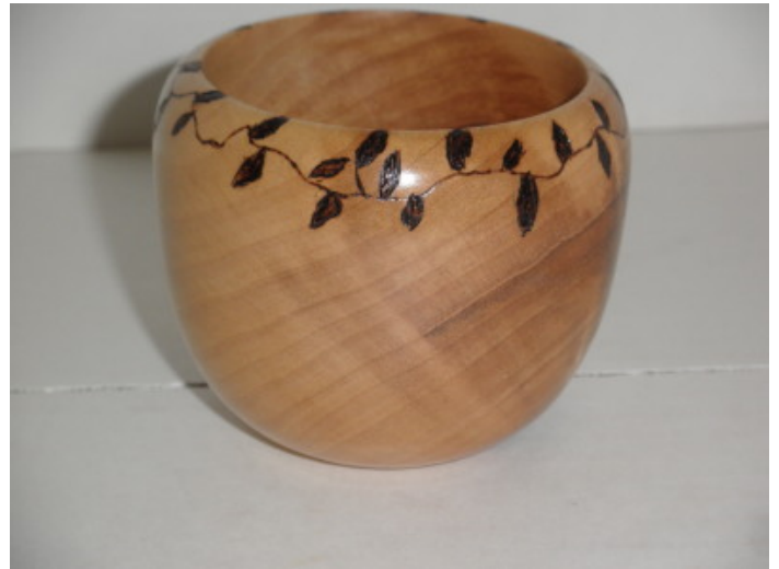
Small Cherry Bowl with Wood Burnings