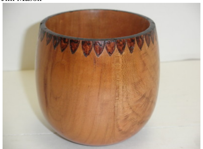
Small Cherry Bowl with Wood Burned Edge