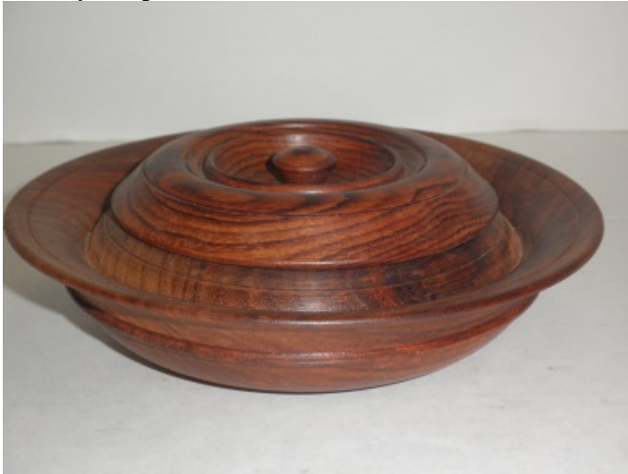
Lidded Box purchased at Longest Yard Sale