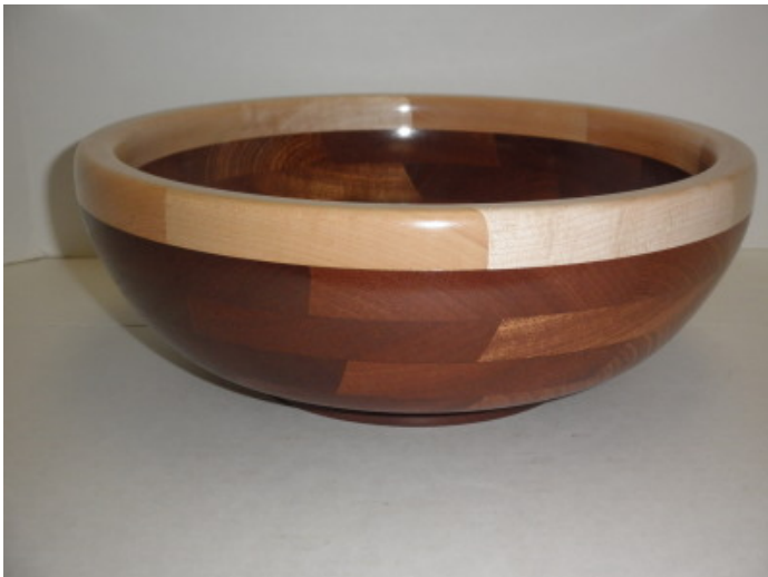
11" Salad Bowl - Maple and African Mahogany