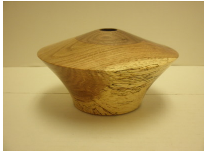
Oak Hollow Form