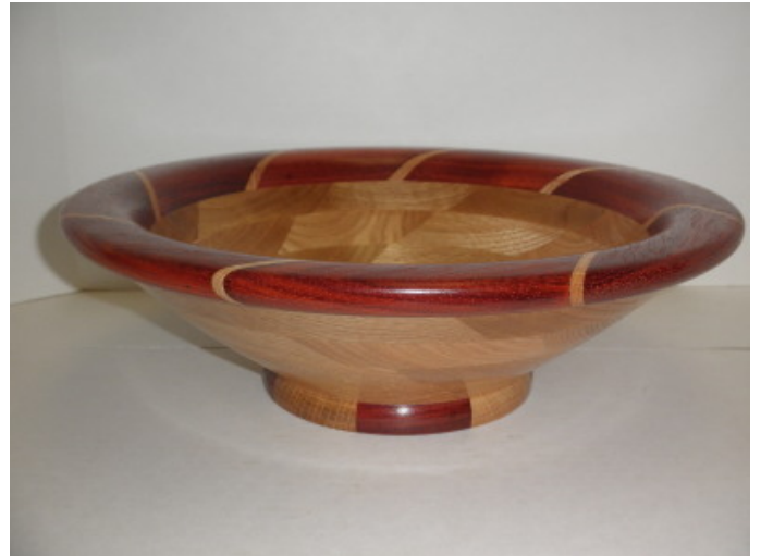
14" Salad Bowl - Oak and Padauk