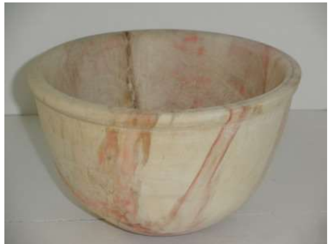
Box Elder bowl with no finish.