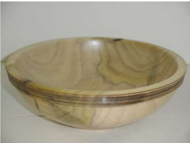
Poplar Salad Bowl