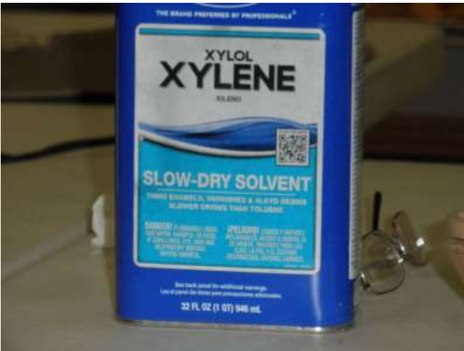
Xylene is used to transfer the image to the work piece.