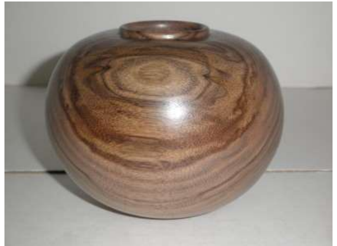
Walnut hollow form