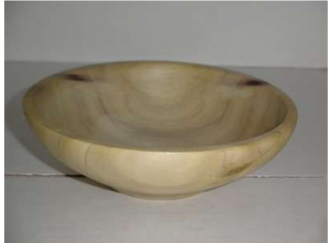
Poplar Salad Bowl