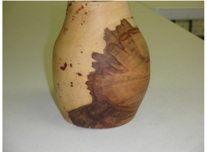
Sweet Gum Vase