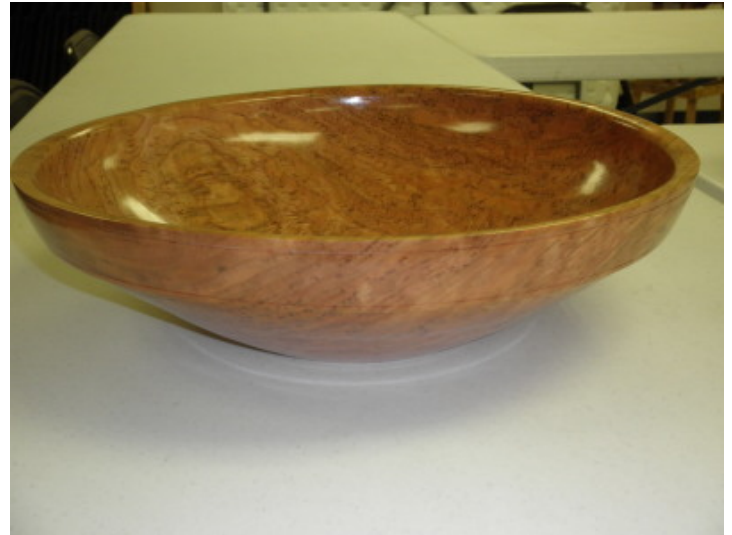
19" Cherry Salad Bowl