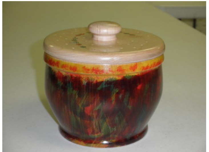
Box for Beads of Courage