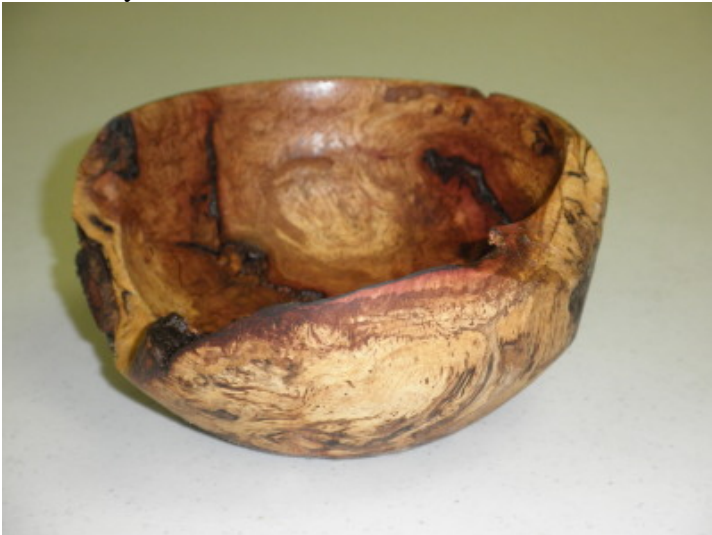
Oak Burl Bowl