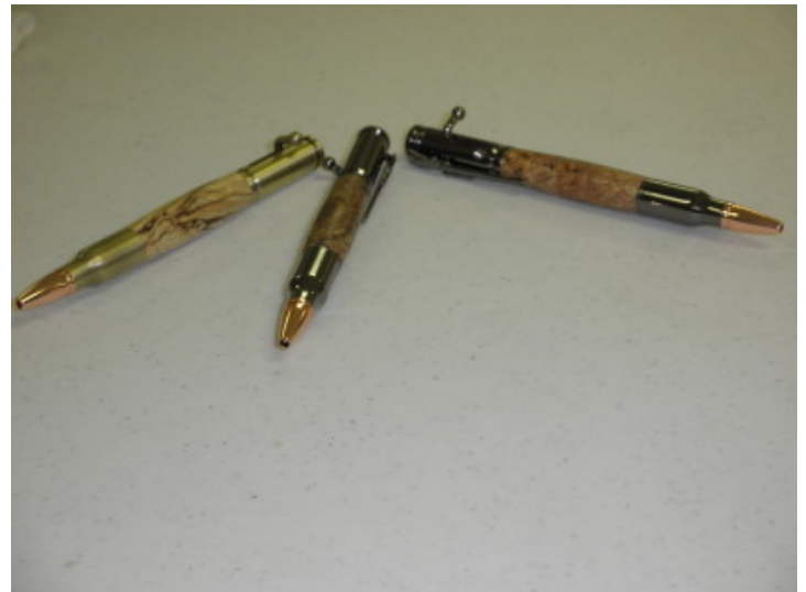
Bold Action pens... Gun Metal and Oak burl and Brass with Spalted Hackberry