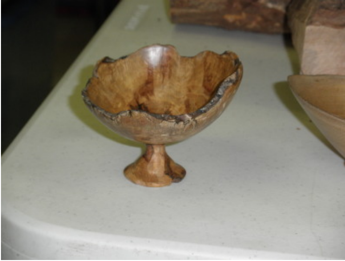
5" Cherry Burl Pedestal Bowl