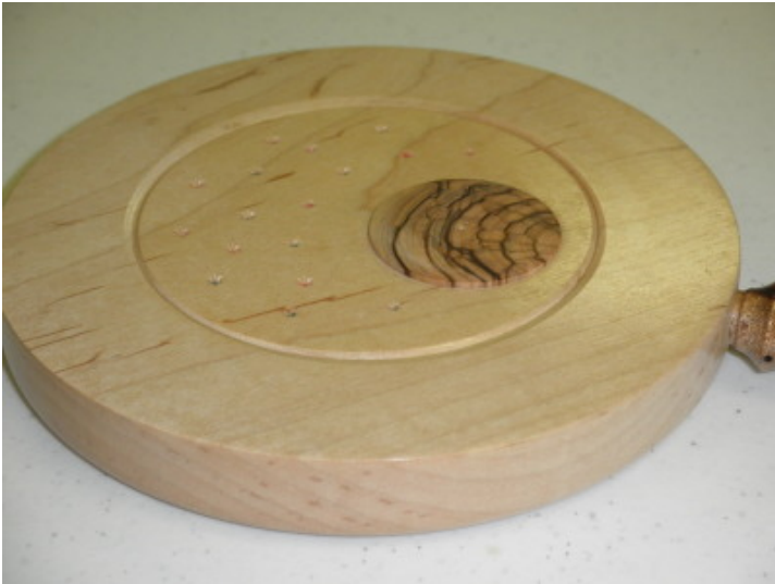
The back of mirror pictured next. Insert is wood from the Mount of Olives