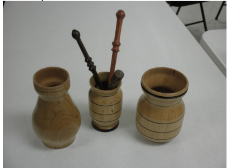
Cherry Vases, Wand and Honey Dipper