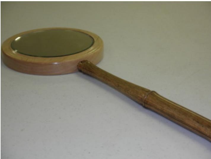
Hand Mirror of Maple and Olive Wood from Mount of Olives