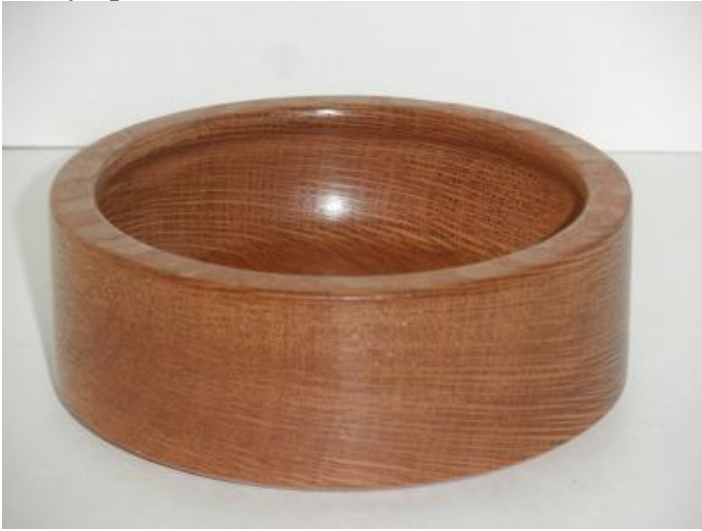
6" Lacewood Bowl