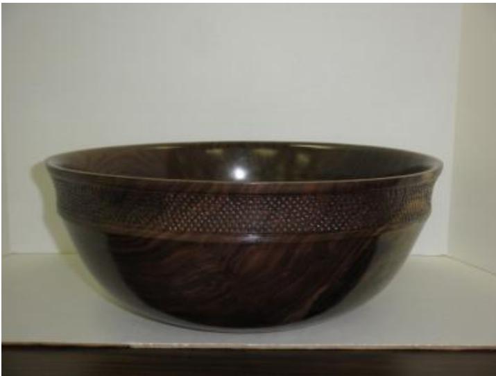
15" Walnut Bowl with Etching Indent