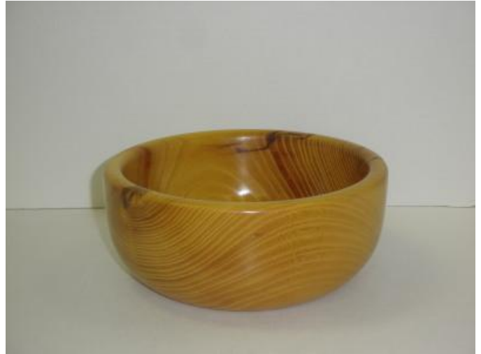
8" Osage Orange