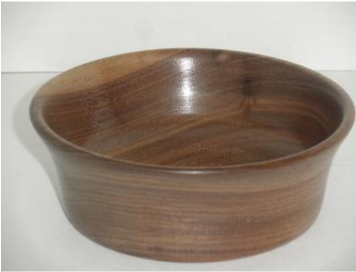
6" Walnut Bowl