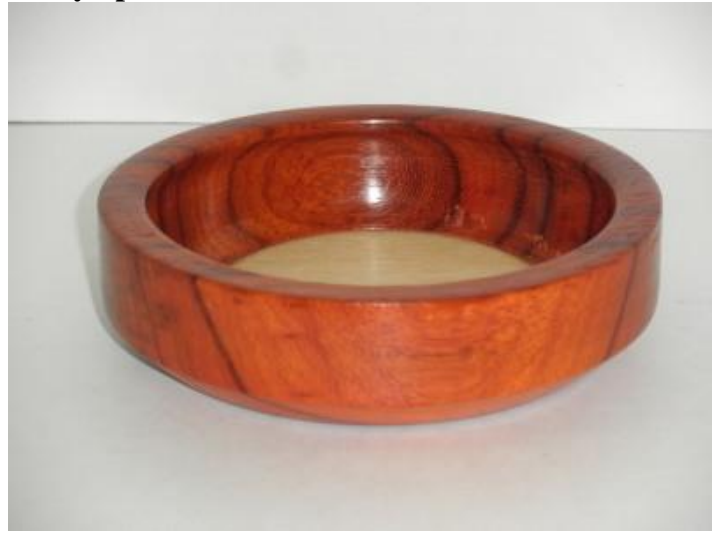
6" Padauk Bowl