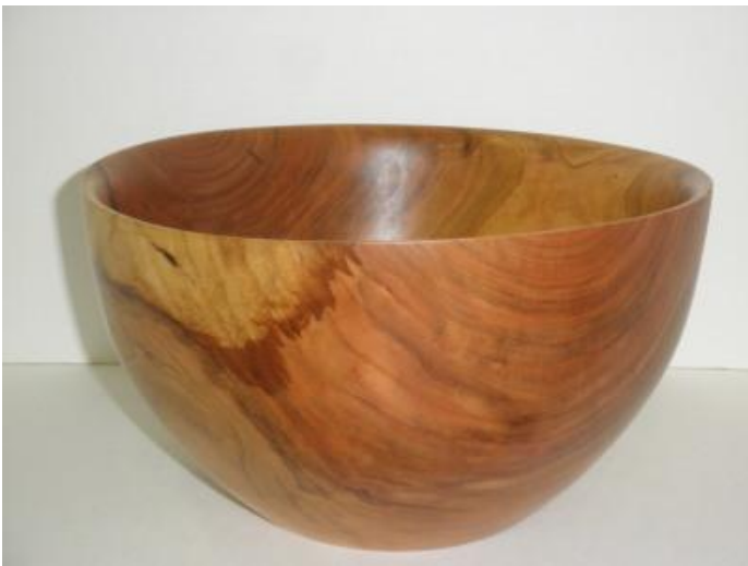
12" Cherry Bowl