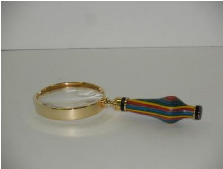
Magnify Glass Laminated Colored Wood