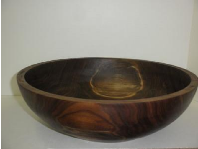
14" Walnut Salad Bowl