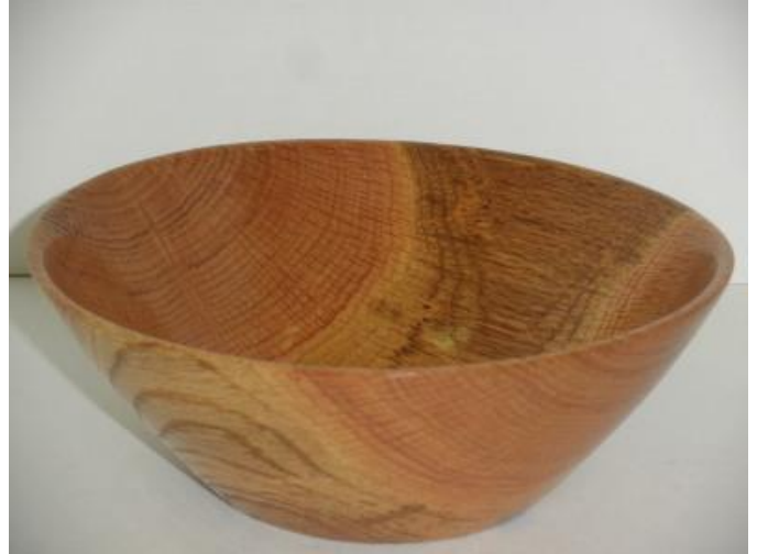
6" Oak Bowl