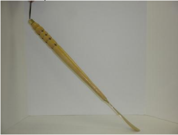
Walnut Shoe Horn