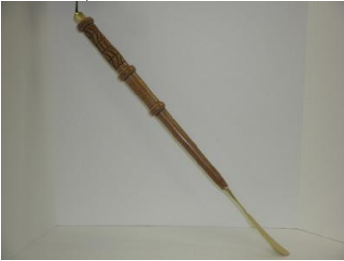
Tiger Maple Shoe Horn