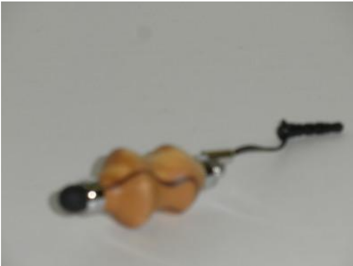
Cell Phone Stylus