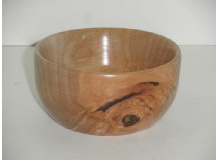
4" Maple Burl Bowl