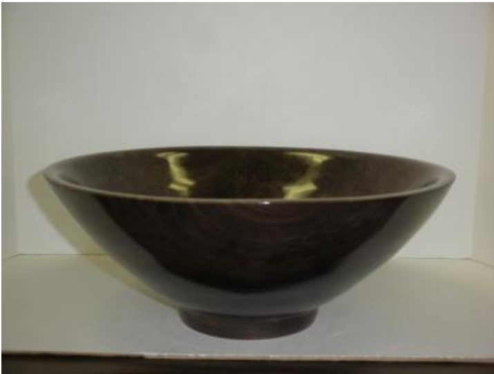
14" Walnut Bowl