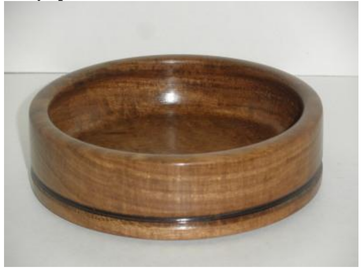
6" Blackbean Bowl