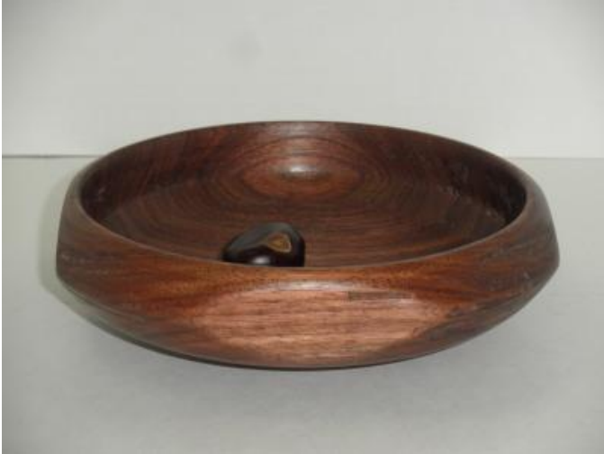
Small Walnut Bowl with Square Edges