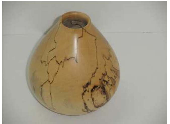
Spalted and Fluted Maple Vase