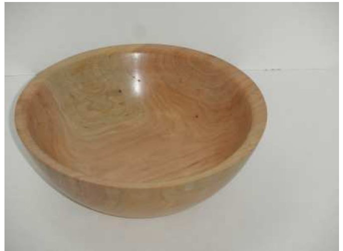
Cherry Salad Bowl