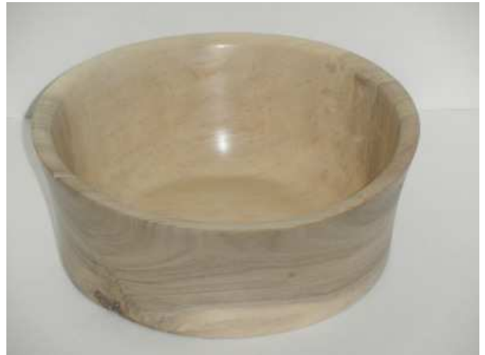
Black Gum Salad Bowl