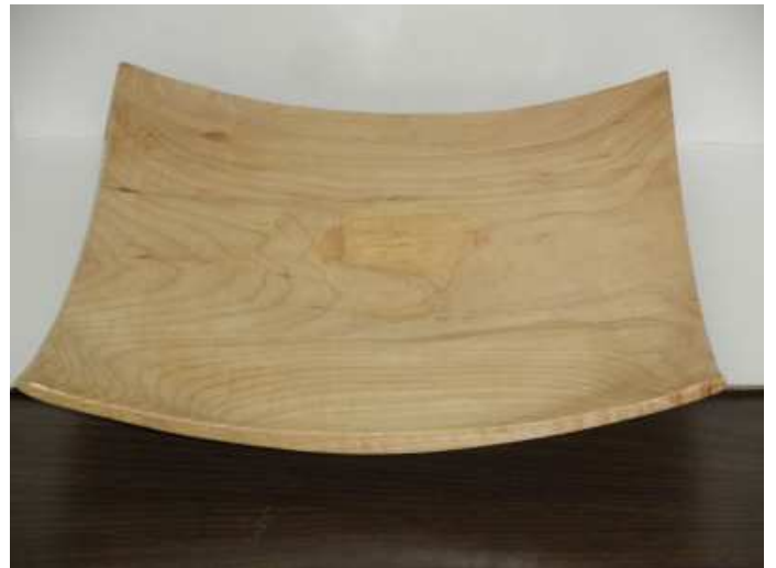
Square Elm Platter