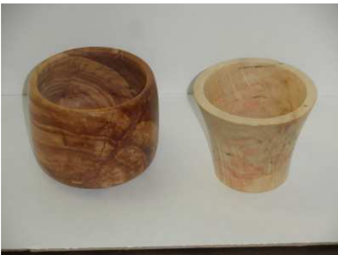
Left to right, Cedar Bowl and Box Elder Bowl