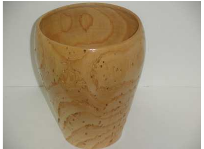
Wormy Silver Maple