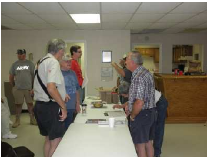
Other members sharing ideas and stories.