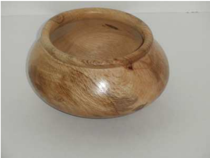
Pin Oak Bowl