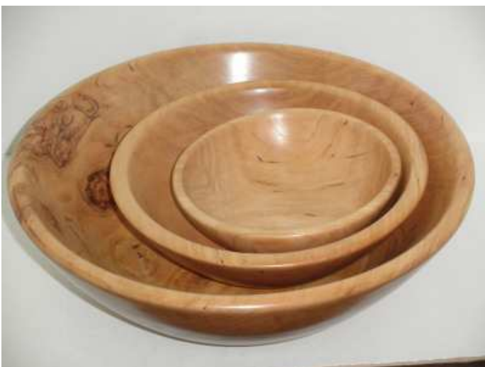
Cherry Bowl Set Turned From One Chunk of Wood