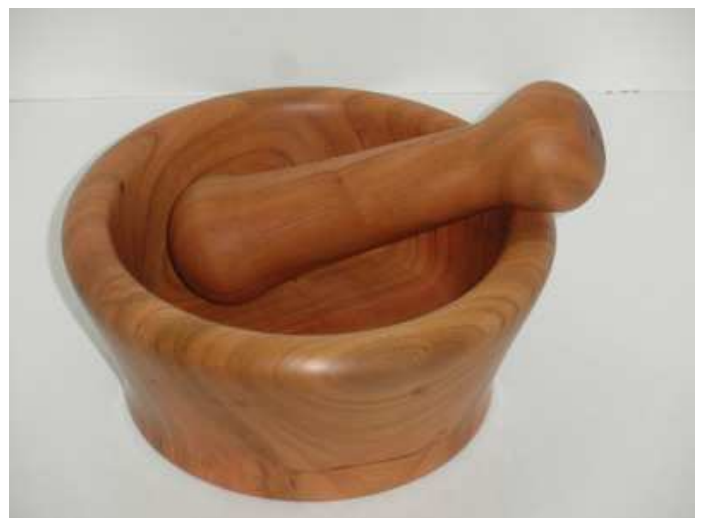
Cherry Mortar and Pestle