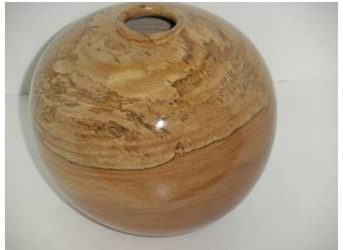
Sycamore Hollow Form