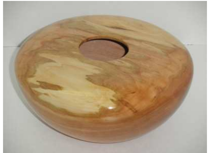
Cherry Hollow Form