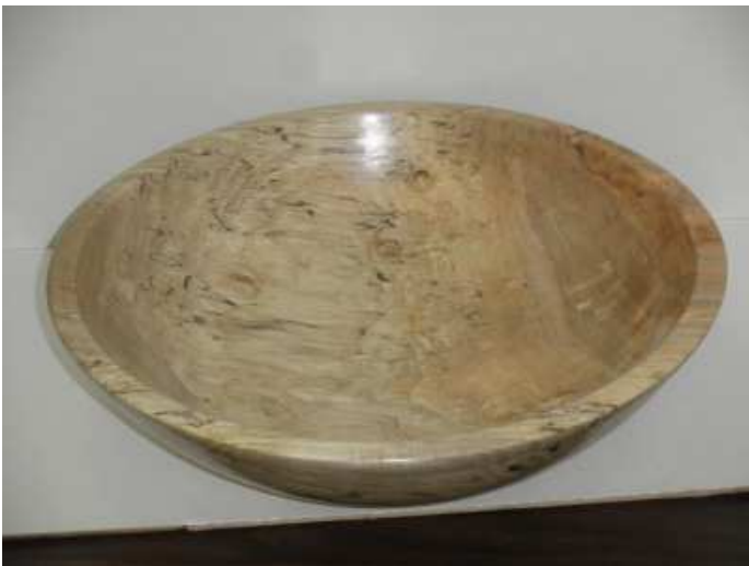
12 Inch Maple Bowl