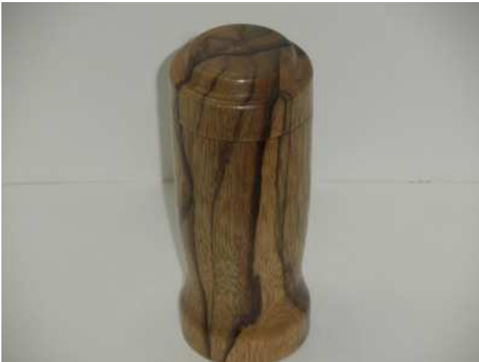
Zebra Wood Lidded Vase