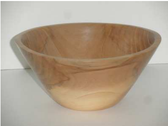
Bradford Pear Bowl