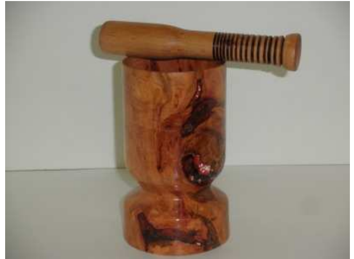
Mortar and Pestle