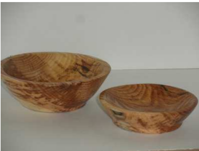
Black Locust Bowls

This is a good way to be motivated to practice enough so that you want to show how you have progressed, even if you have to bring an item you Please bring something to show for Show ‘n Tell have not finished and have a question about.