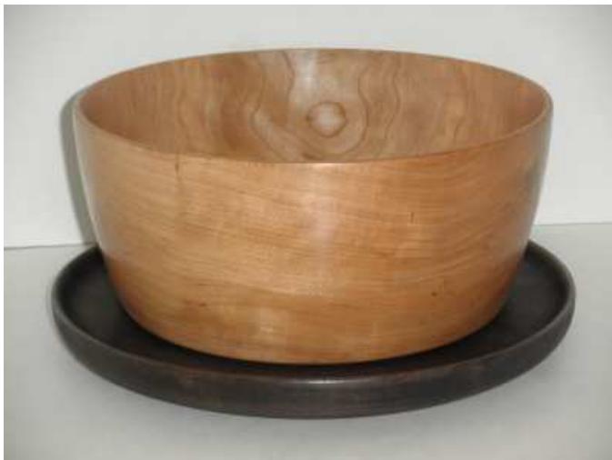
Cherry Bowl and Poplar Plate