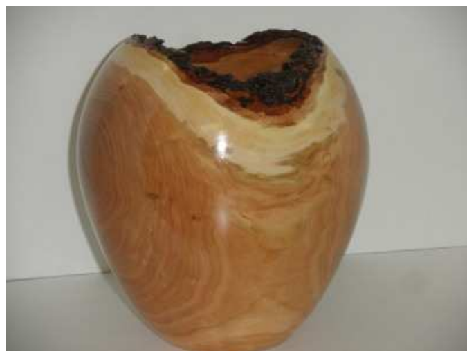
Cherry Natural Edge Vase