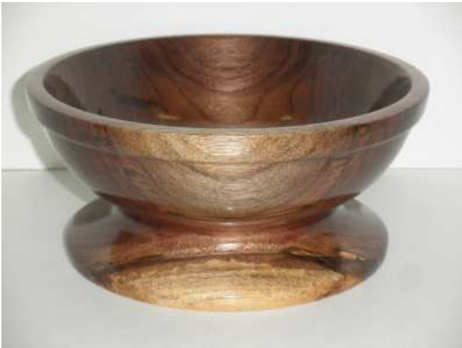
Walnut Bowl with Base