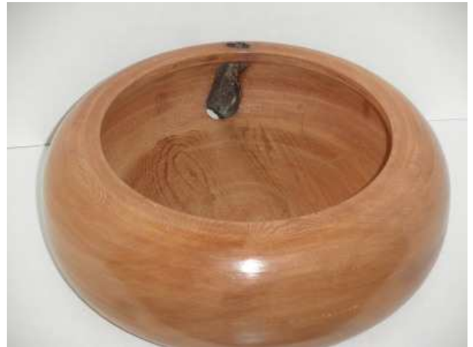
Western Cedar 10" Bowl