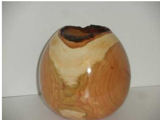
Cherry Vase (Natural Edge)